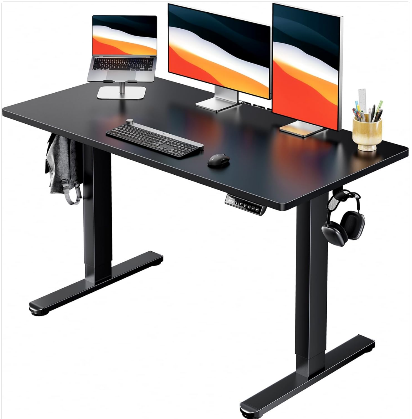
The HUANUO Electric Standing Desk, featuring a 48" x 24" whole piece desktop in black.