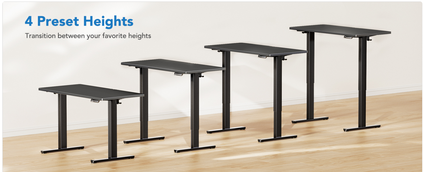
Easily transition between four preset heights for optimal comfort.