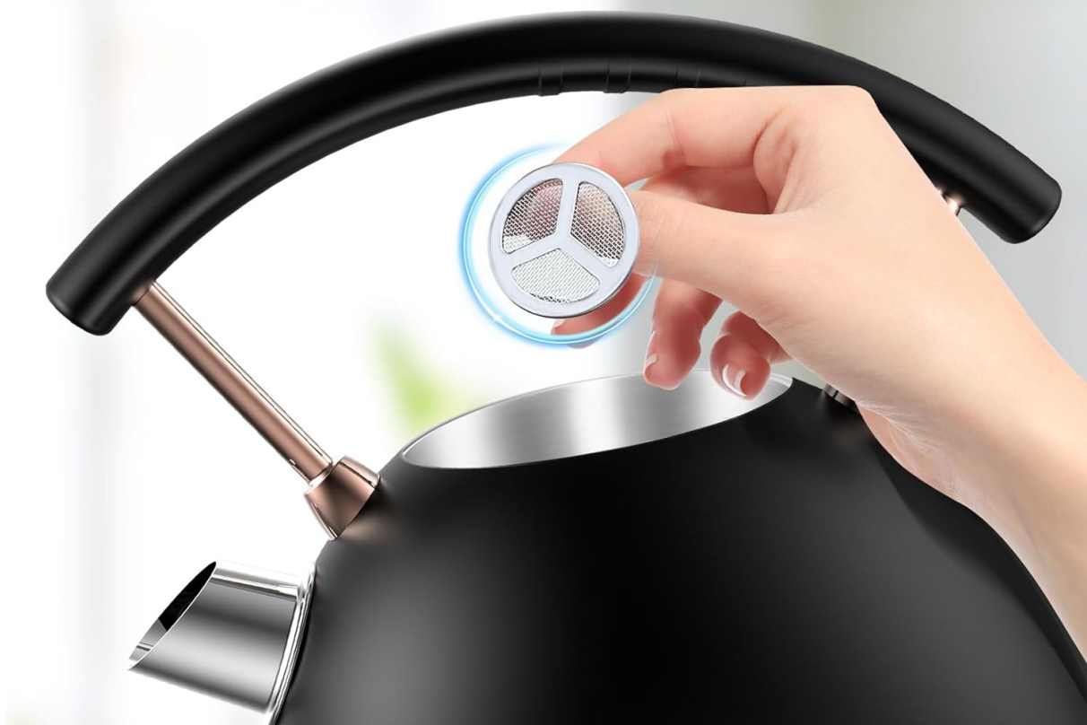
Image: A hand demonstrating the removal of the anti-limescale filter from the kettle's spout for cleaning.