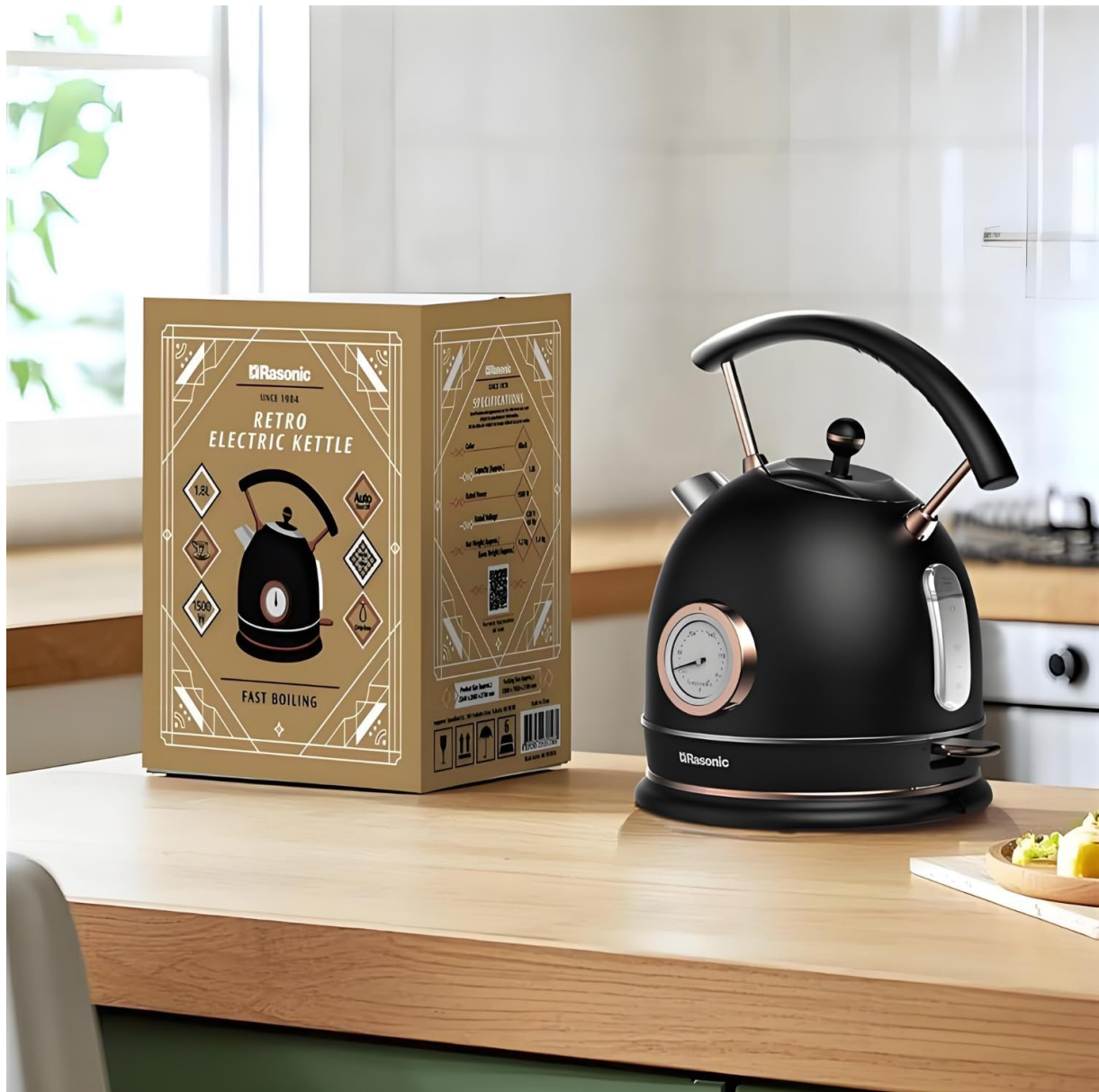
Image: Close-up of the kettle's water level indicator, showing clear markings for minimum and maximum fill, up to 1.8 liters.