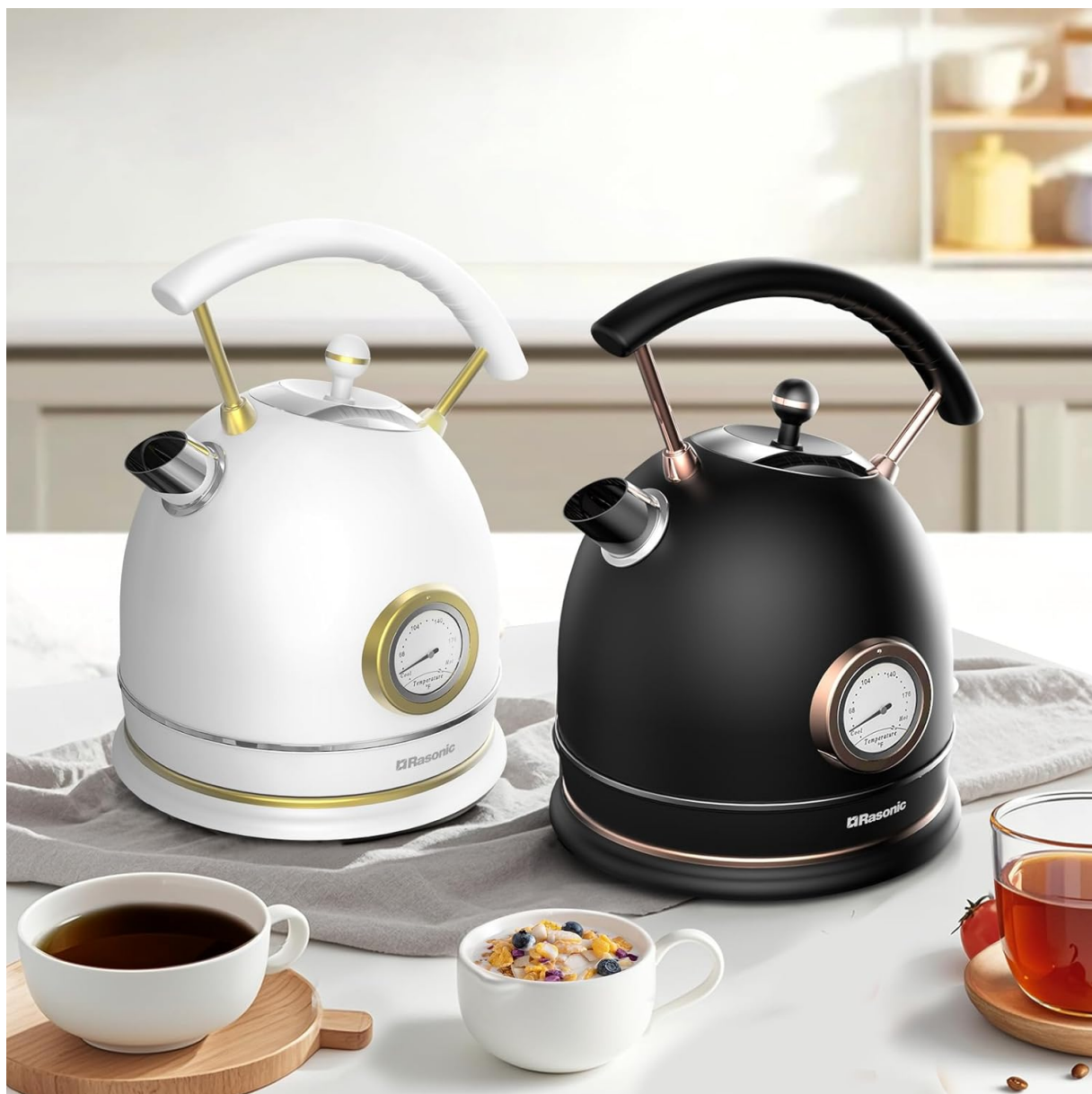
Image: A detailed shot of the kettle's side, emphasizing the temperature gauge and the clear water level window.