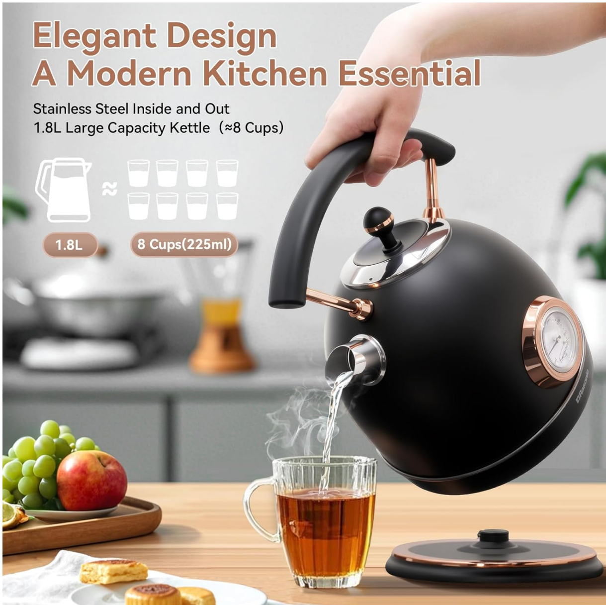
Image: Front view of the Rasonic Retro Electric Kettle, showcasing its matte black finish with rose gold accents and the integrated temperature gauge.