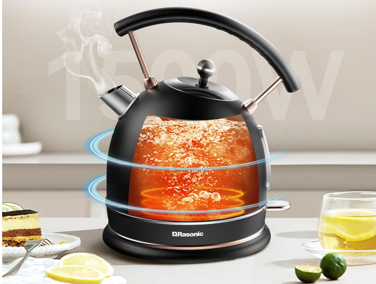
Image: Side view of the Rasonic Retro Electric Kettle, highlighting its ergonomic handle and spout design.

1500W Rapid Boiling Equipped with Heating Element