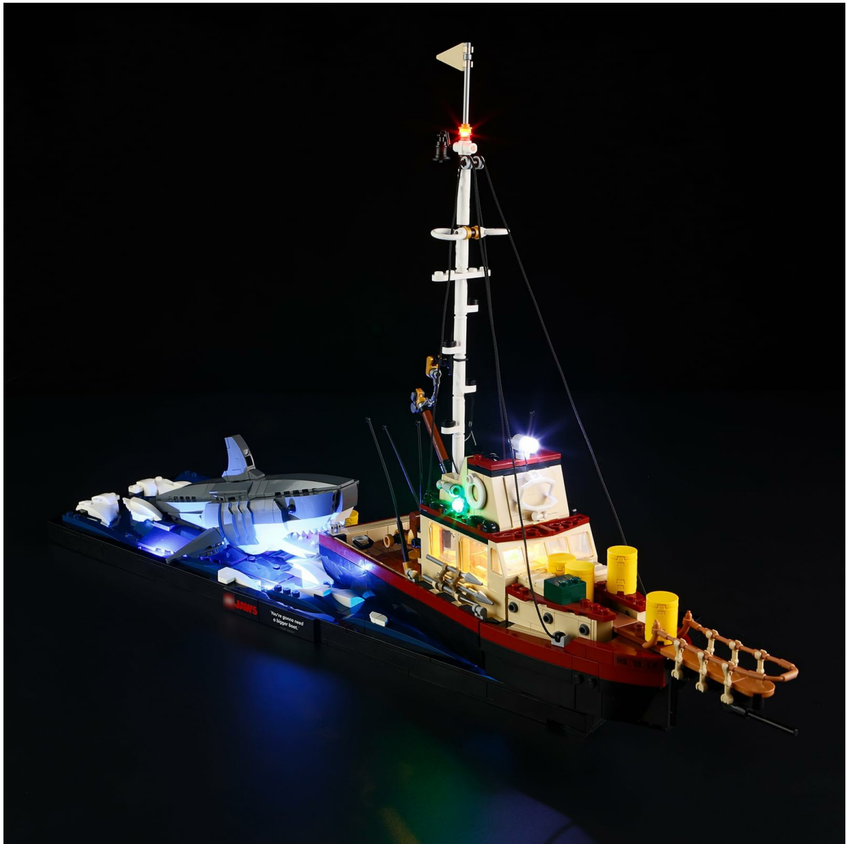
Image: The 21350 Ideas Jaws model with the YEABRICKS LED light kit installed, showcasing the illuminated boat and shark against a dark background.