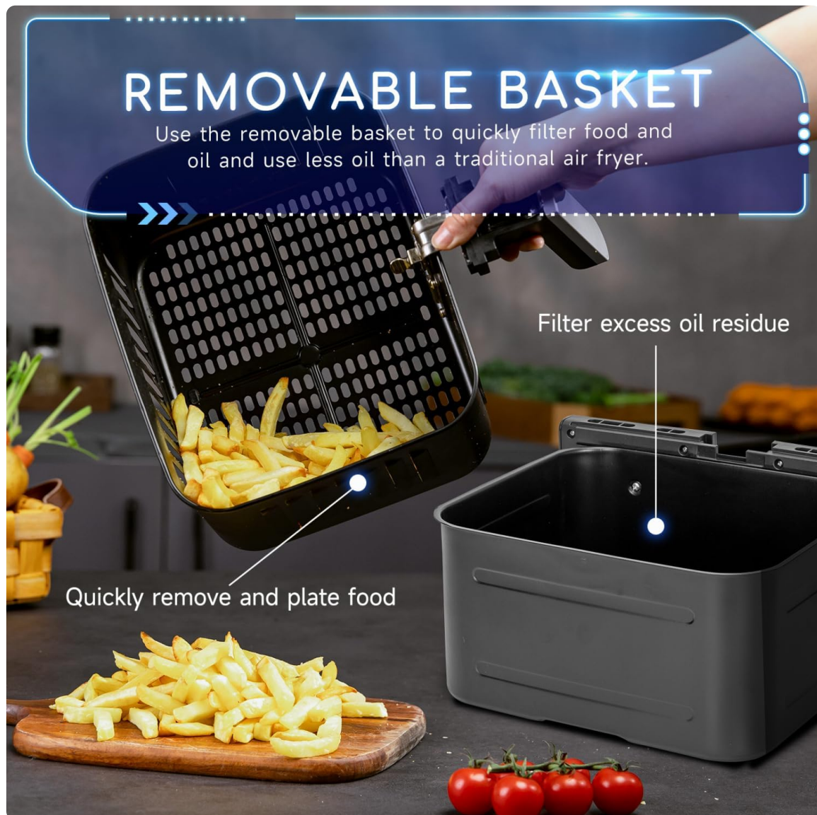
Image: A hand demonstrating the removal of the cooking basket, showing how excess oil residue is filtered to the bottom, and how easily food can be removed.