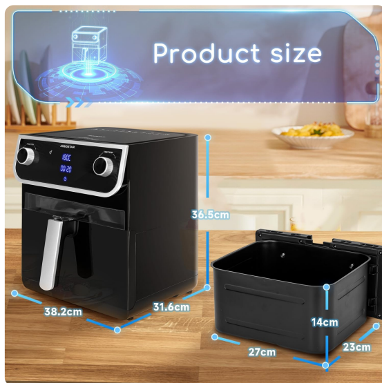
Image: Diagram showing the dimensions of the Aigostar Air Fryer (31.6cm depth, 38.2cm width, 36.5cm height) and its internal basket (27cm x 23cm x 14cm).

Familiarize yourself with the main parts of your Aigostar Air Fryer.