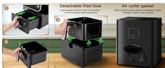
Image: Illustration of the detachable basket mechanism and the air outlet gasket located at the rear of the appliance.