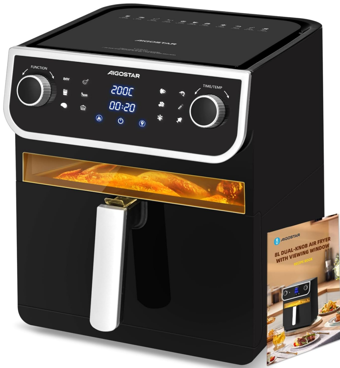
Image: The Aigostar 8L Air Fryer, featuring a sleek black design, a digital control panel, a transparent viewing window, and an accompanying recipe book.