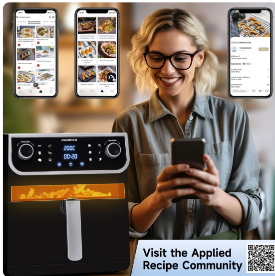
Image: A woman interacting with the Aigostar recipe community on her smartphone, with the air fryer visible in the background. A QR code is present for easy access.

Explore a wide range of recipes and connect with other users through the Aigostar recipe community.