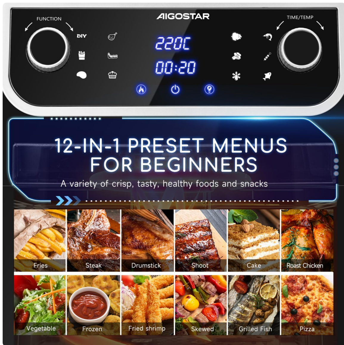
Image: The control panel displaying 12 preset menu options, including fries, steak, drumstick, roast chicken, vegetables, and pizza.