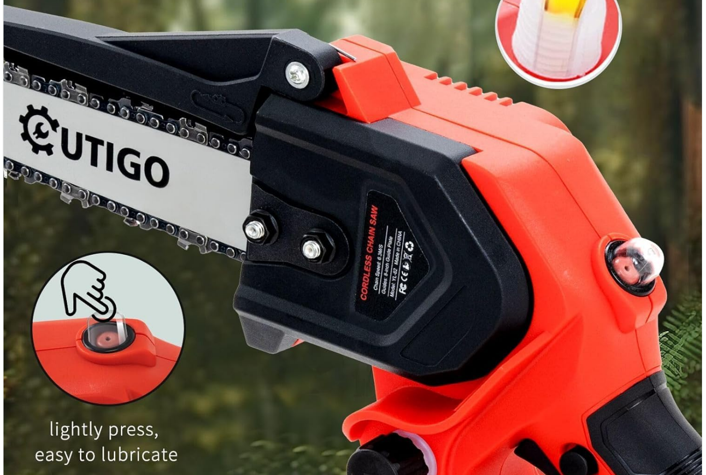
Image: Close-up of the automatic lubrication device on the chainsaw. The transparent oil tank allows for easy monitoring of oil levels. Pressing the oil filling chain button manually lubricates the chain.