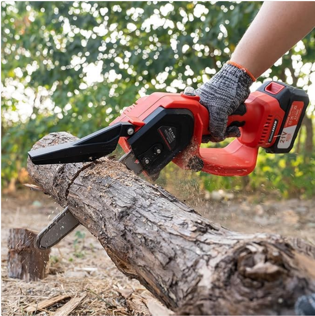
Image: The OUTIGO Mini Electric Chainsaw in use, demonstrating its capability to cut through a log. The user is wearing gloves for safety.