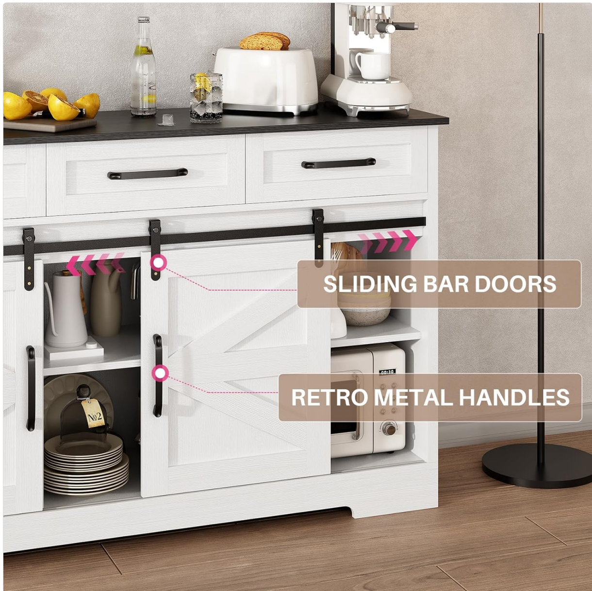
Figure 3: Detail view of the cabinet's sliding barn doors and the retro-style metal handles.