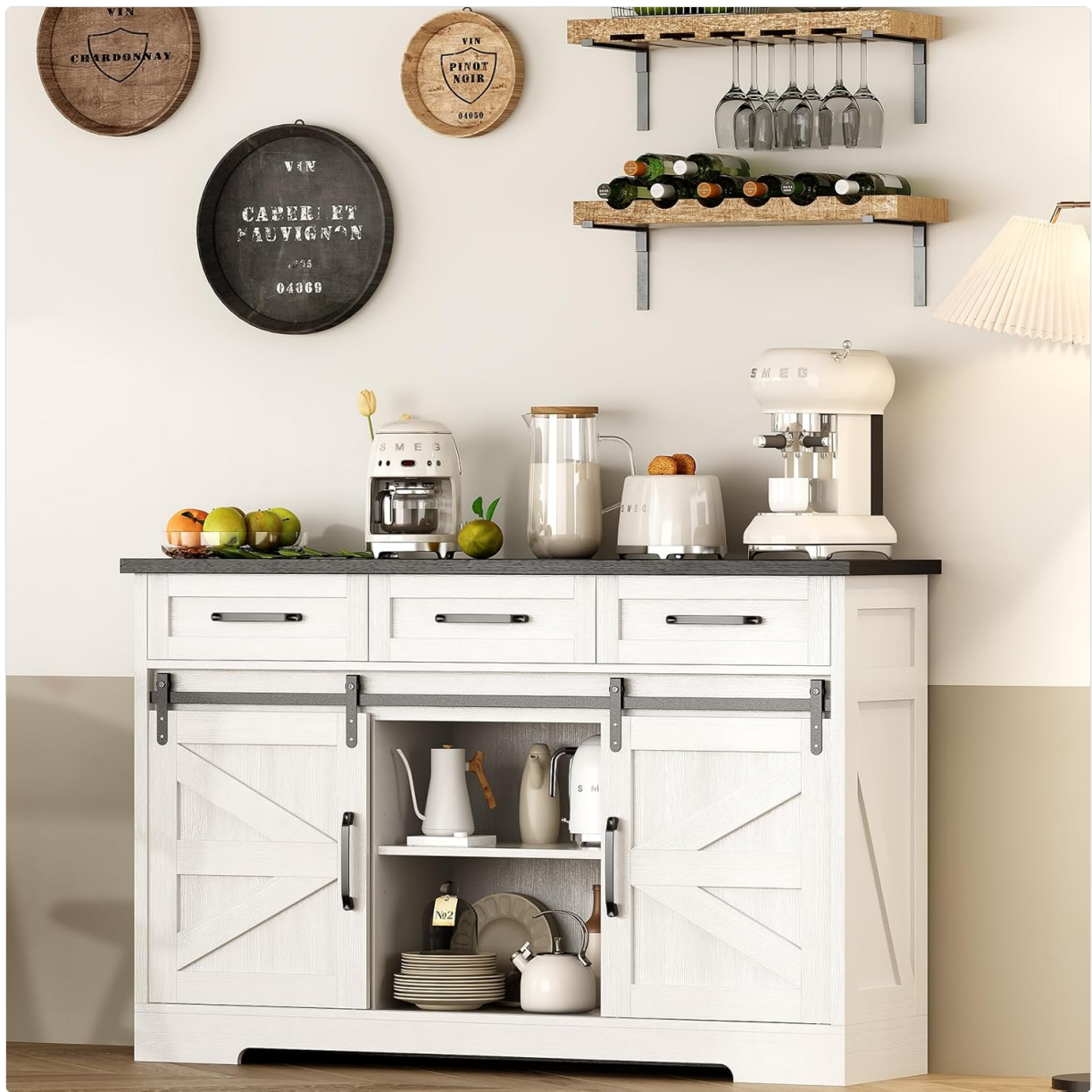
Figure 1: The Redlife Farmhouse Sideboard Buffet Cabinet, fully assembled and styled in a kitchen environment.