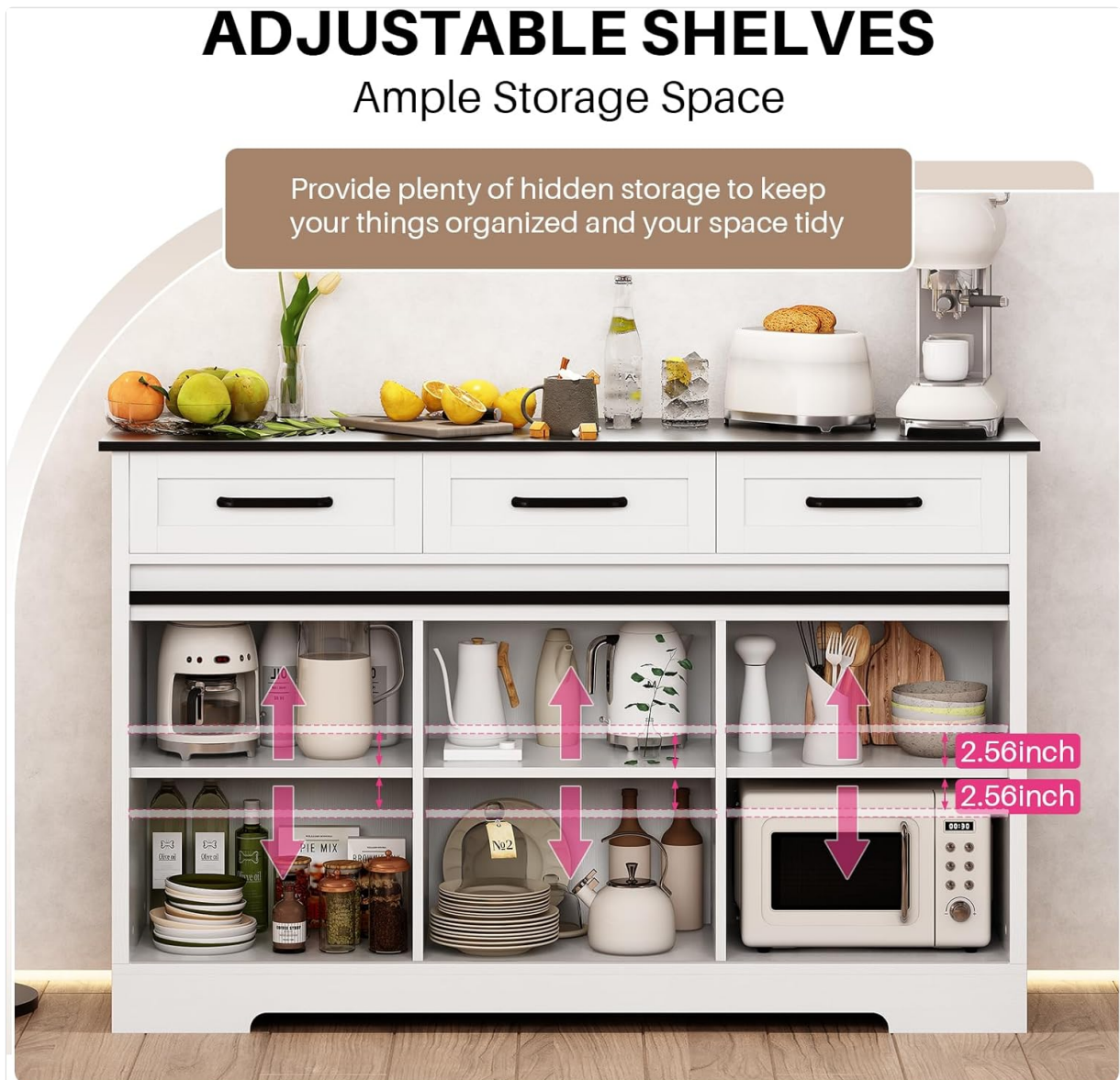
Figure 2: Illustration of the adjustable shelves within the cabinet, highlighting the flexibility for organizing items.