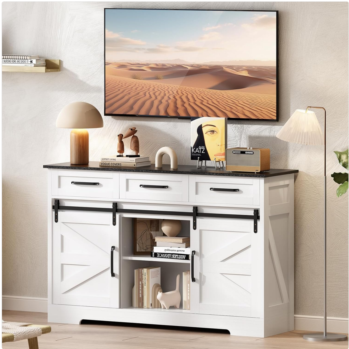
Figure 5: The cabinet integrated into a living room, demonstrating its use as a media console or display unit.