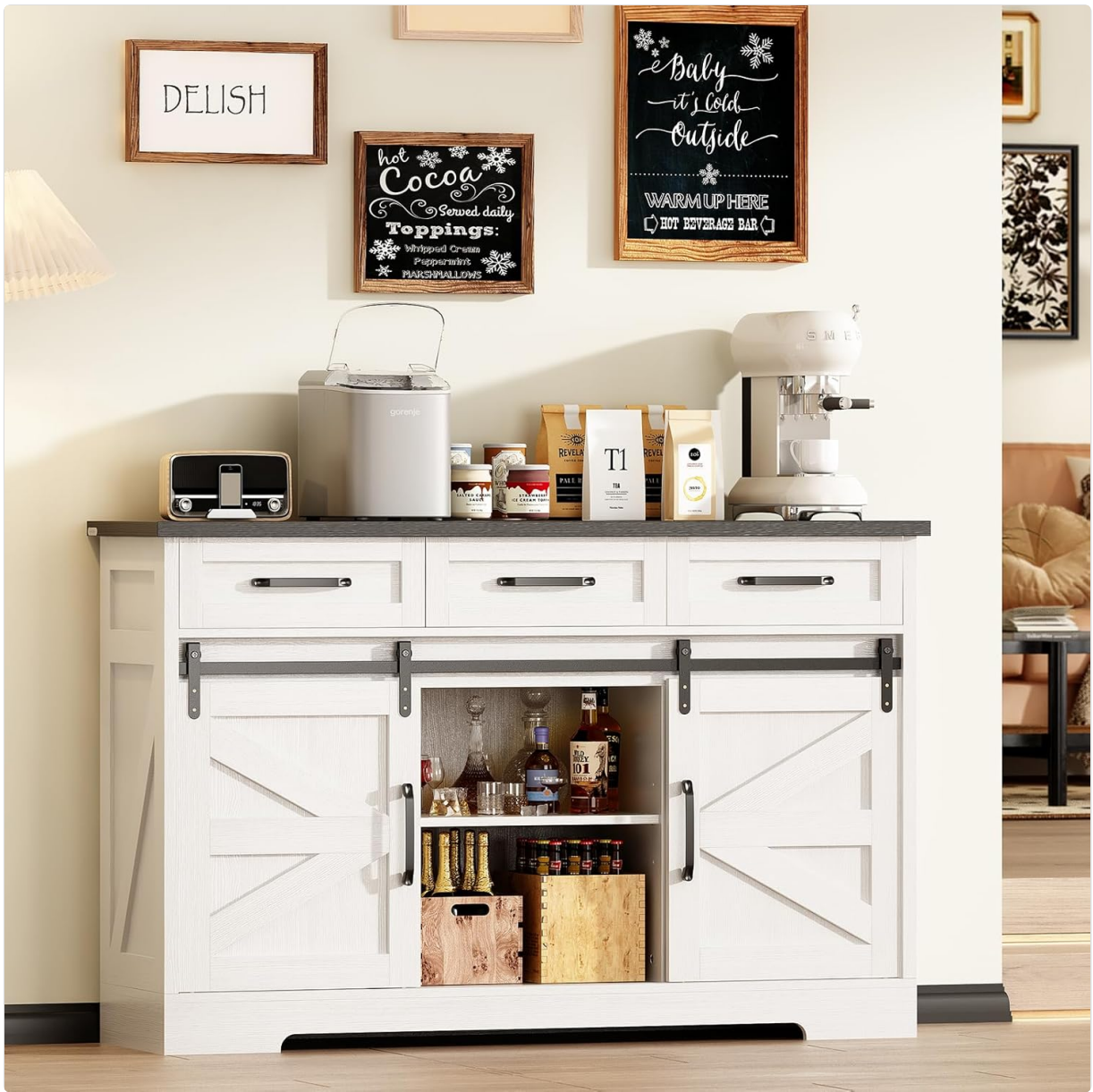
Figure 4: The cabinet configured as a coffee bar, showcasing its utility for beverages and small appliances.