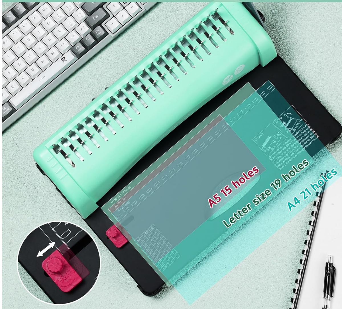
Image: The paper slider mechanism on the binding machine, used to lock paper for A5 (15 holes), Letter (19 holes), and A4 (21 holes) sizes.