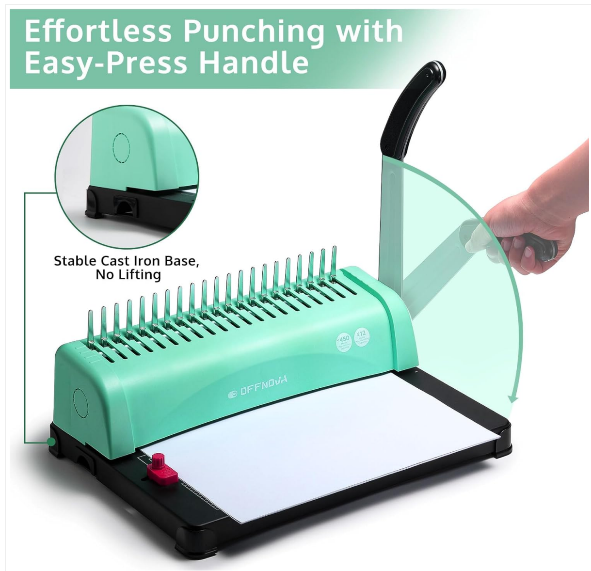
Image: The OFFNOVA RC12 Binding Machine in action, showing the easy-press handle for punching paper.