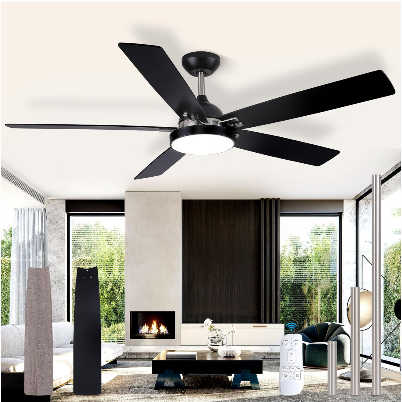
Figure 1.1: XCWIIIE 60 Inch Large Ceiling Fan in a living room setting.