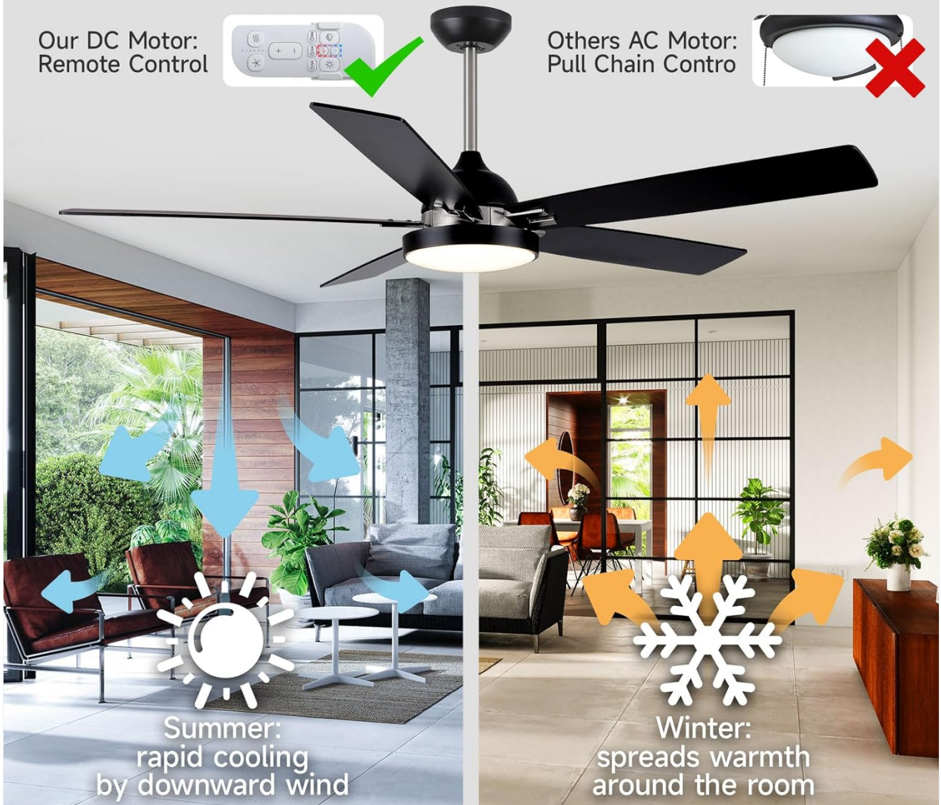
Figure 5.1: Reversible DC motor function for seasonal comfort.