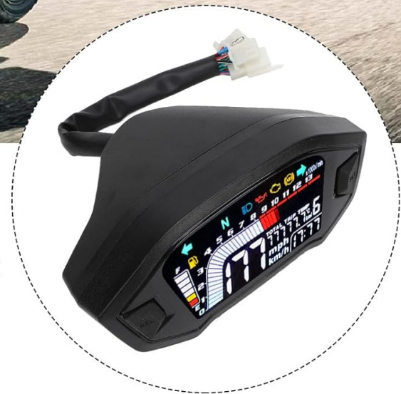
Image: Akozon digital speedometer installed on a motorcycle, demonstrating its integration into the bike's system.

Made of ABS materials that are impact resistant, wear resistant Optimal performance in any harsh environment