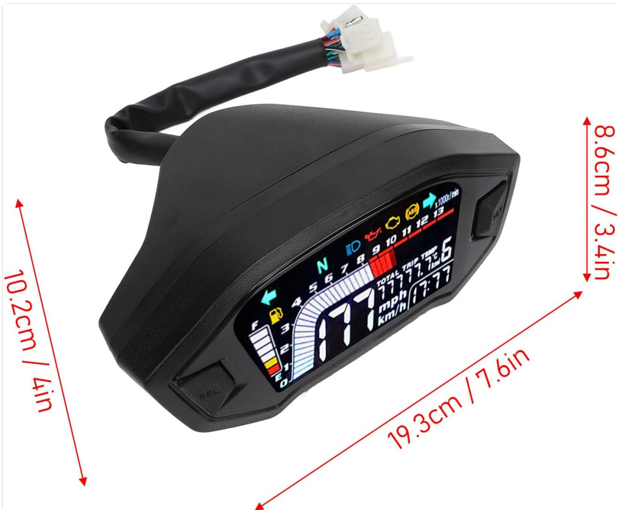
Image: Dimensions of the Akozon Motorcycle Speedometer, showing its length, width, and height for proper fitment.