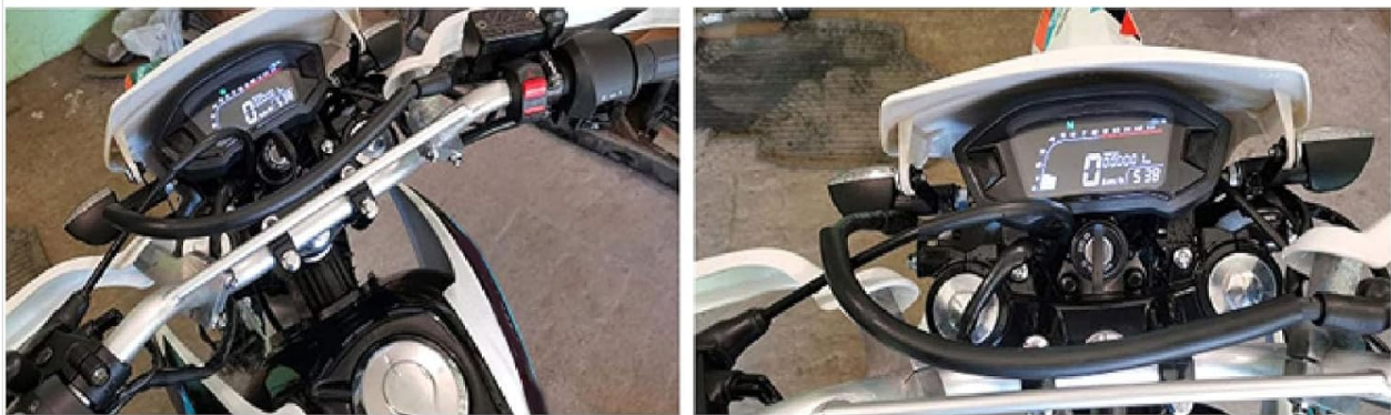
Image: Close-up view of the Akozon digital speedometer display on a motorcycle, showing speed, RPM, and gear indicators.