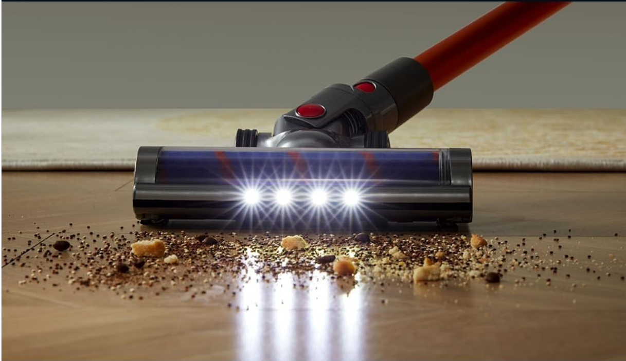
Image: The LED floor brush lights up the area in front of the vacuum, making dirt visible in dark spaces. The integrated LED lights on the floor brush illuminate dark areas under furniture or in dimly lit rooms, making hidden dirt and debris visible for comprehensive cleaning.

See the dirt in dark space. Avoid using laser light to protect the eyes of children and pets.