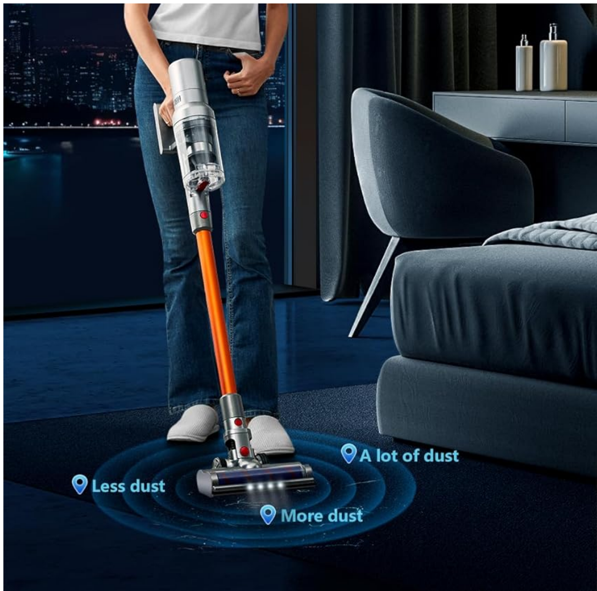
Image: Illustration of the vacuum's real-time dust sensing capability, adjusting suction based on dust volume.

In Auto mode, the vacuum cleaner utilizes infra-red dust sensing technology to detect dust particles. It automatically boosts motor speed when higher dust concentrations are detected, ensuring thorough cleaning and optimizing power consumption.