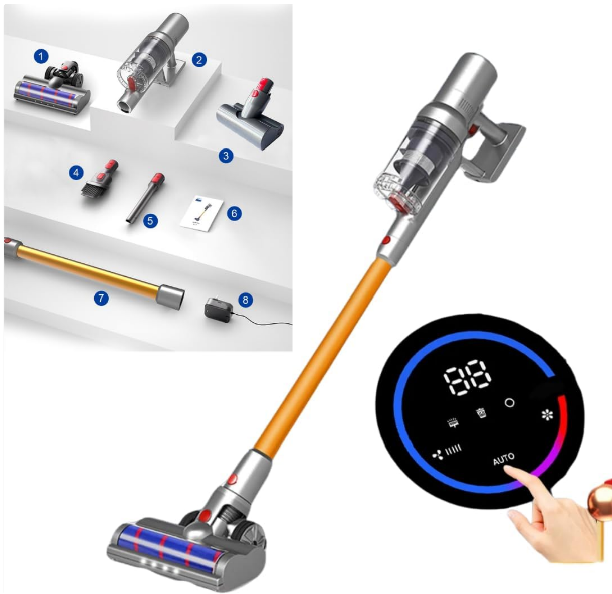
Image: Exploded view of the ABIR VC205 Cordless Vacuum Cleaner showing its main body, extension wand, floor brush, and various accessories.