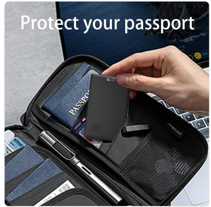
Image: The tracker card securely placed within a passport holder for travel security.