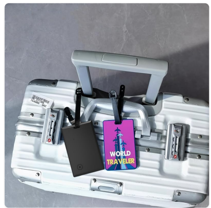
Image: The tracker card attached to a suitcase, demonstrating its use for travel items.