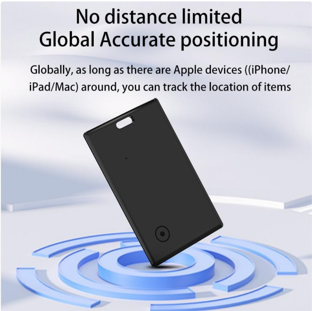
Image: The Novzix S11 tracker card demonstrating its global accurate positioning capability within the Find My app.

To find your item, open the Find My app on your Apple device. Select the Novzix S11 Tracker Card from your list of items. The app will display its last known location on a map. If the item is nearby, you can use the Play Sound feature to emit an audible alert from the tracker, helping you pinpoint its exact location.