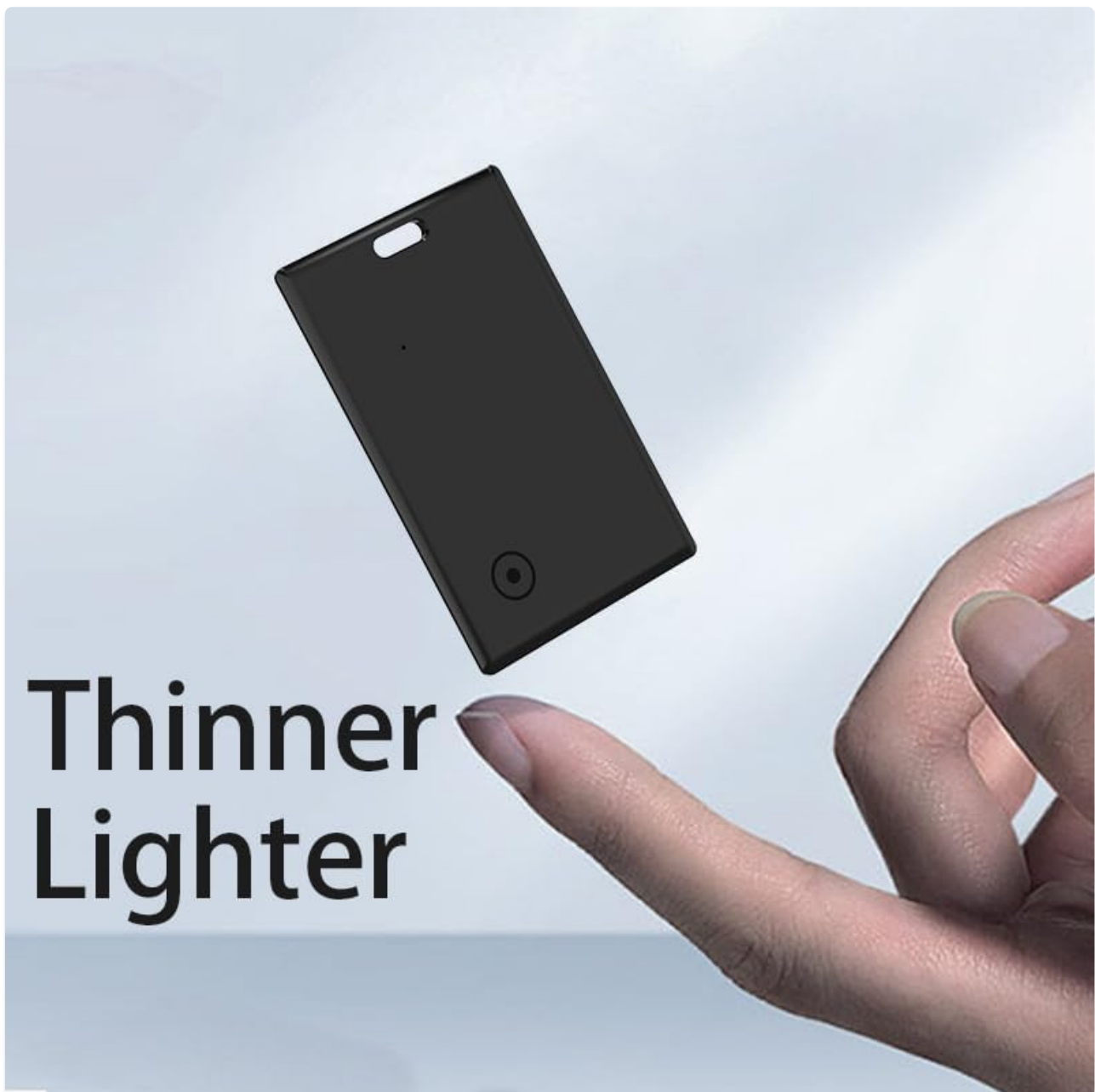
Image: The Novzix S11 tracker card held to demonstrate its thin and lightweight profile.