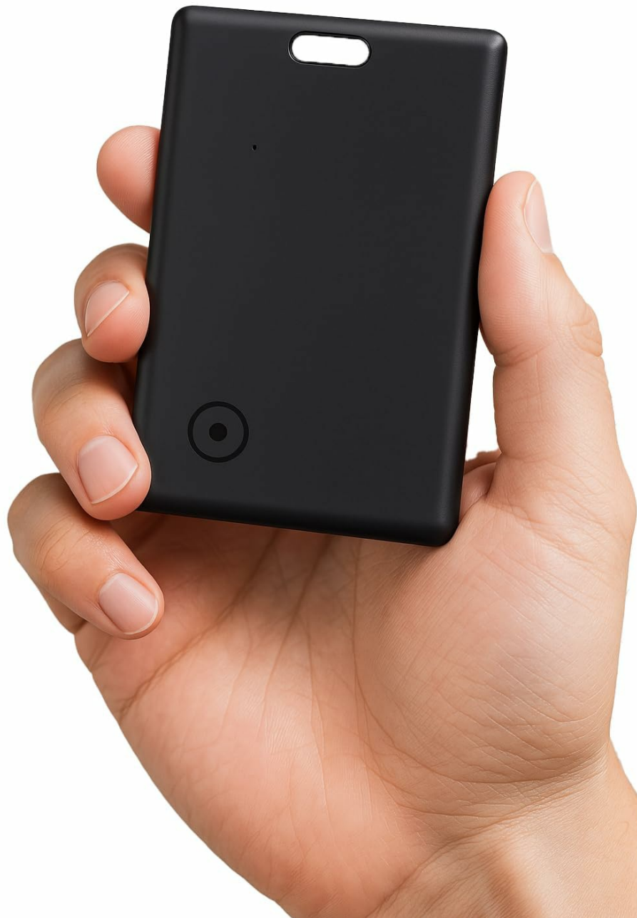
Image: The Novzix Slim Wallet Tracker Card S11, highlighting its wireless functionality and compatibility with Apple Find My.