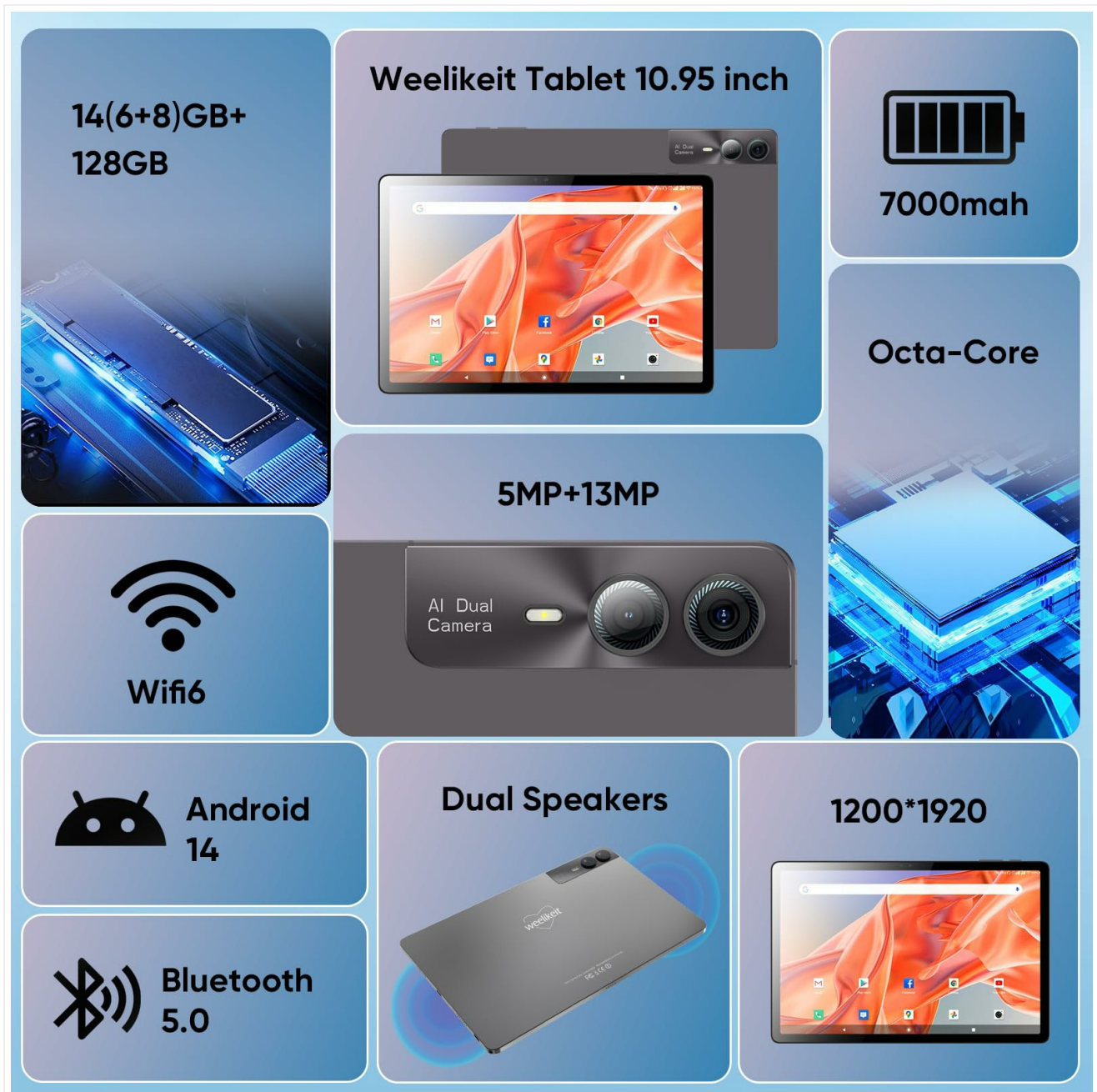
Figure 4.2: 10.95-inch FHD Display. The tablet's screen showcases a high-resolution image, highlighting its 10.95-inch IPS FHD display with 1200x1920 resolution.