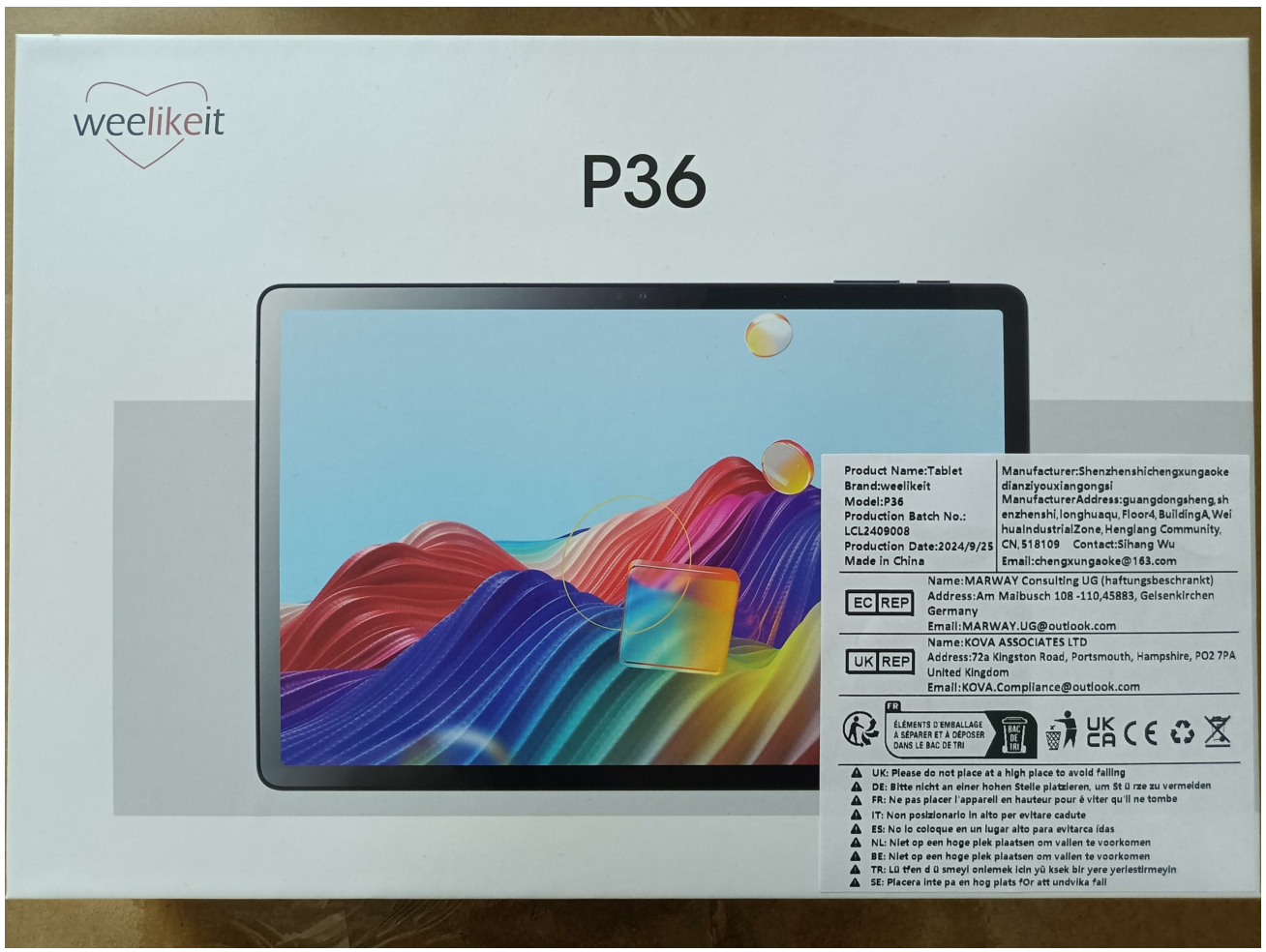
Figure 2.1: Tablet Packaging. The image shows the weelikeit P36 tablet box, indicating the product model and brand.