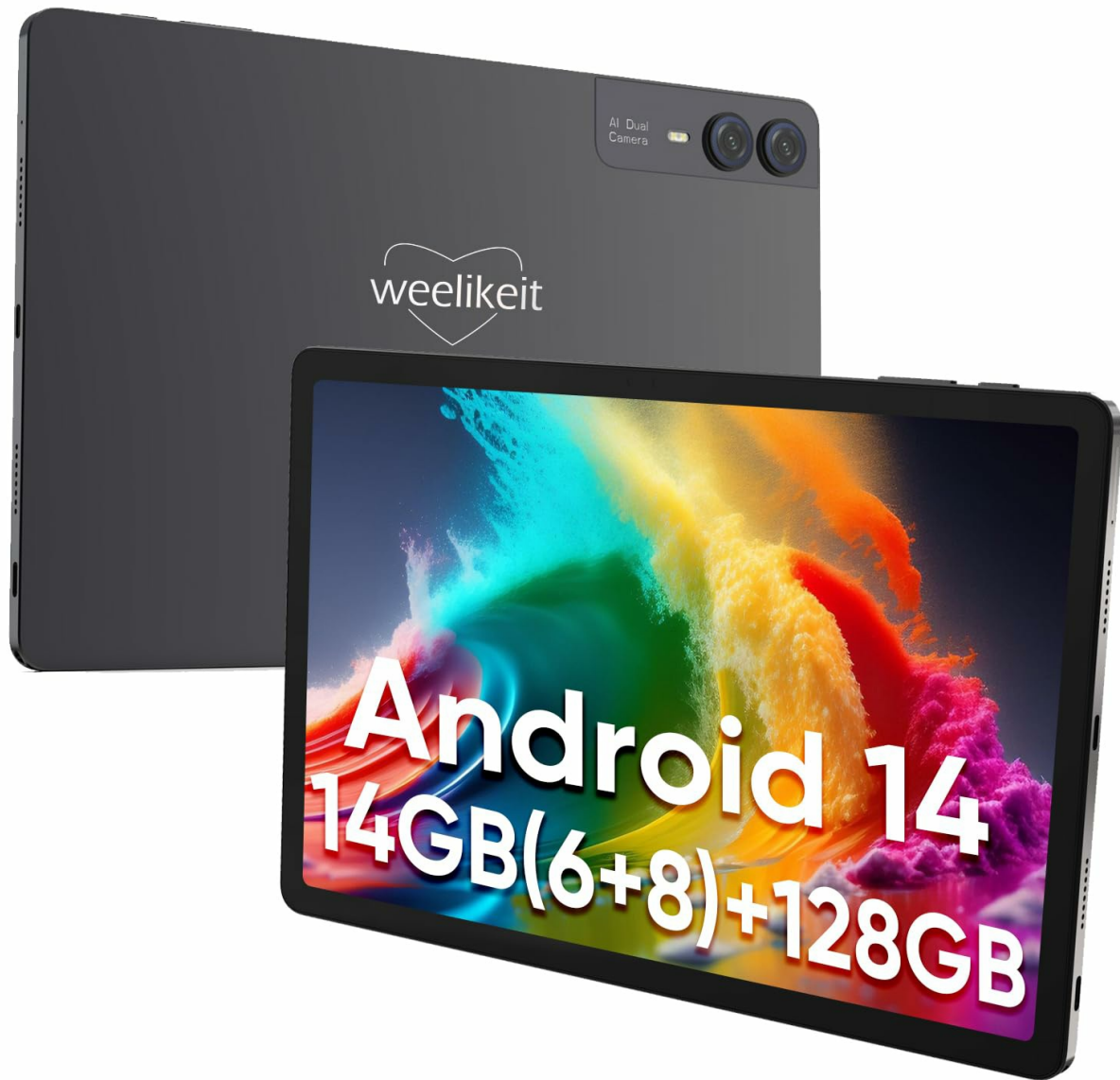
Figure 1.1: weelikeit 11-inch FHD Tablet. This image displays the tablet from both front and rear perspectives, showcasing its sleek design and camera setup.