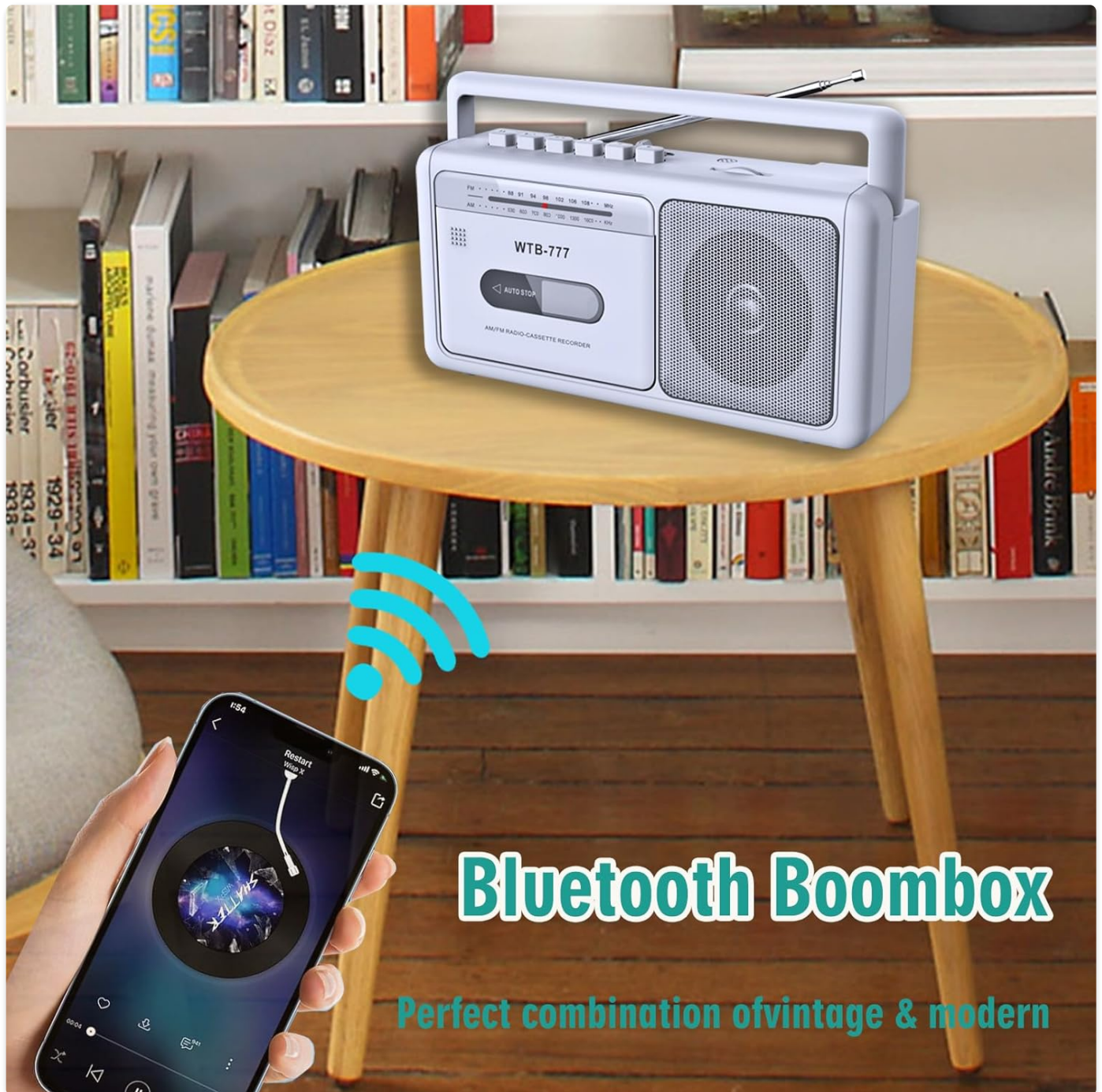
Figure 6: Bluetooth Connectivity