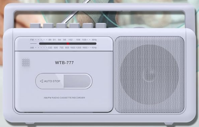
Figure 5: Enjoying AM/FM Radio