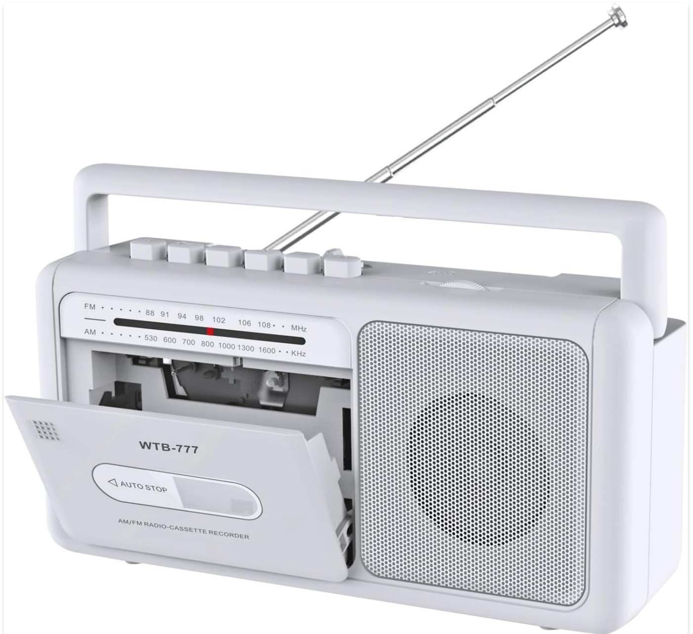
Figure 1: WIITHINK WTB-777 Portable Cassette Player and Recorder