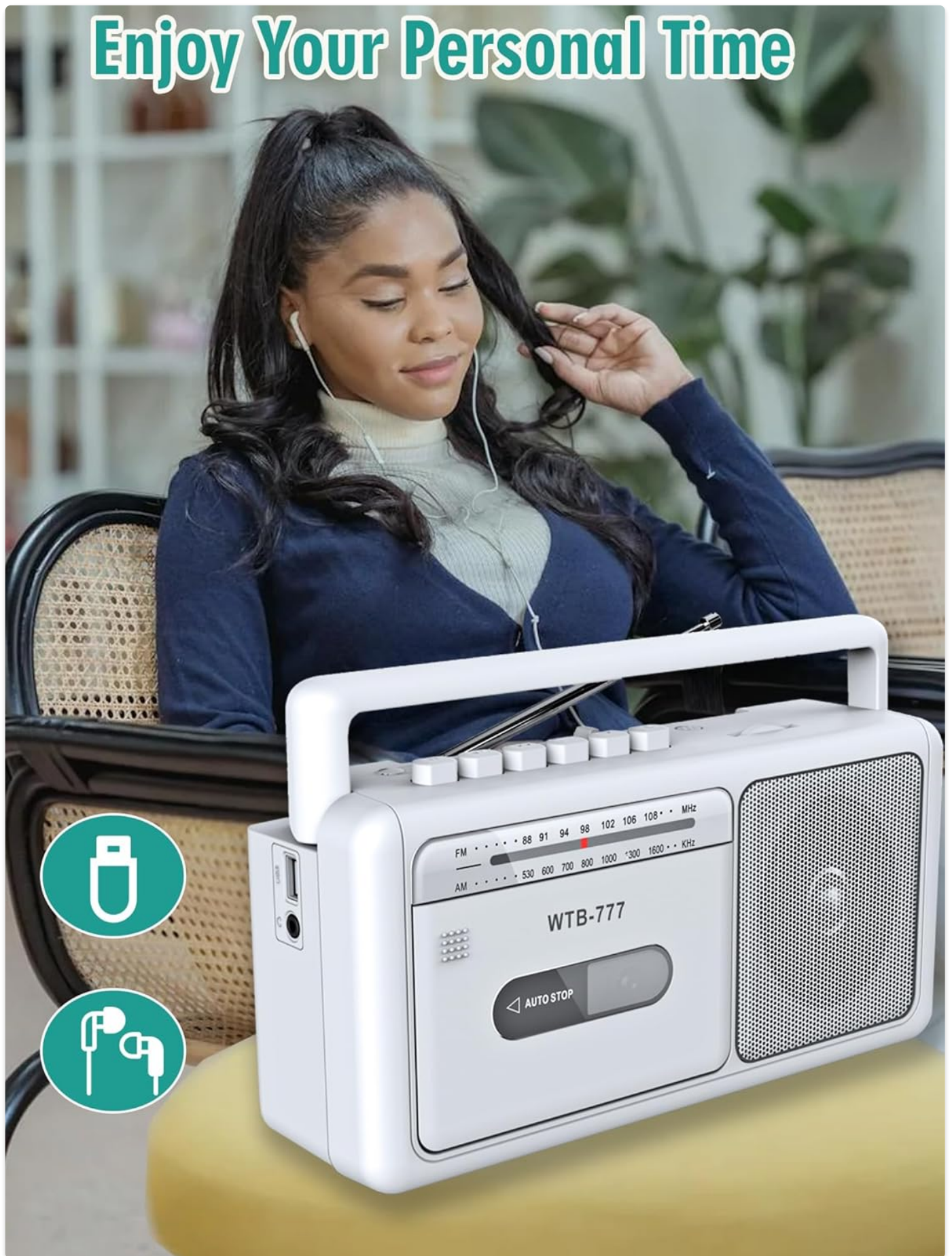
Figure 7: USB Playback and Earphone Jack