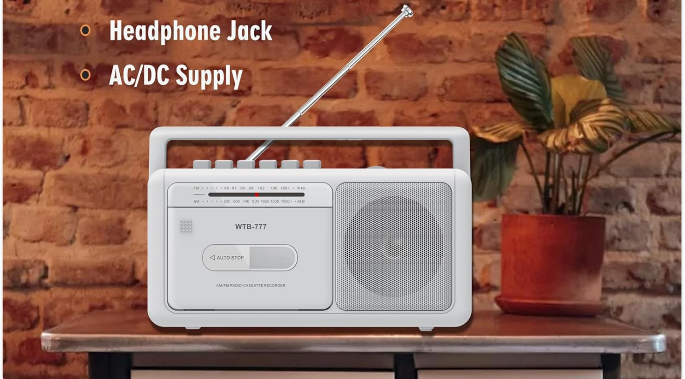
Figure 2: Key Features of the WTB-777