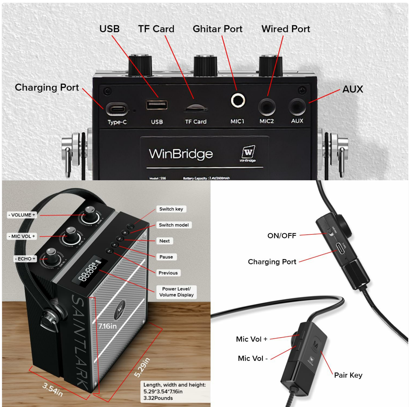
Figure 3.1.1: Illustration of charging ports on the main unit and the wireless microphone headset.