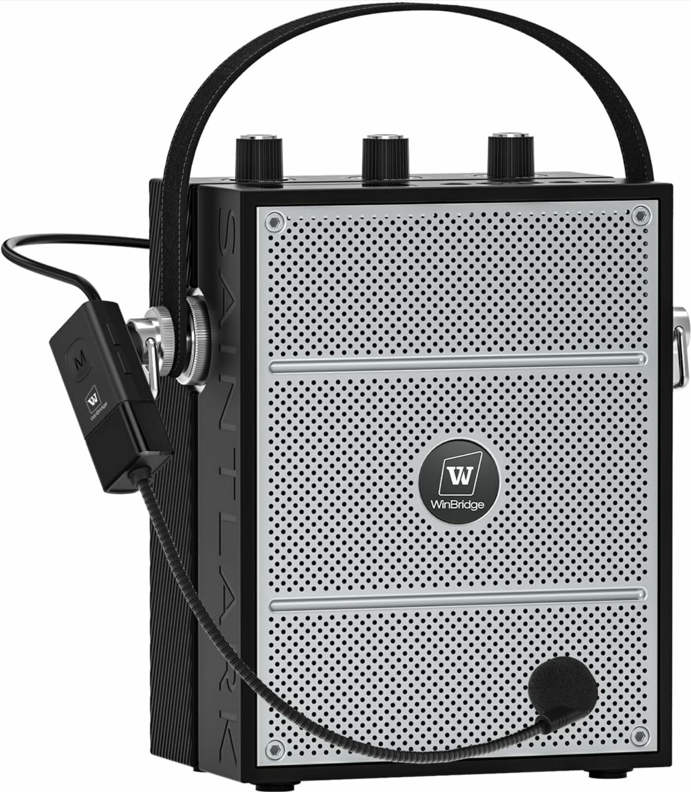
Figure 2.3.1: Front view of the WinBridge S98 Voice Amplifier with the wireless microphone headset connected.