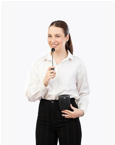
Figure 3.3.1: Proper wearing of the wireless headset microphone for clear voice amplification.