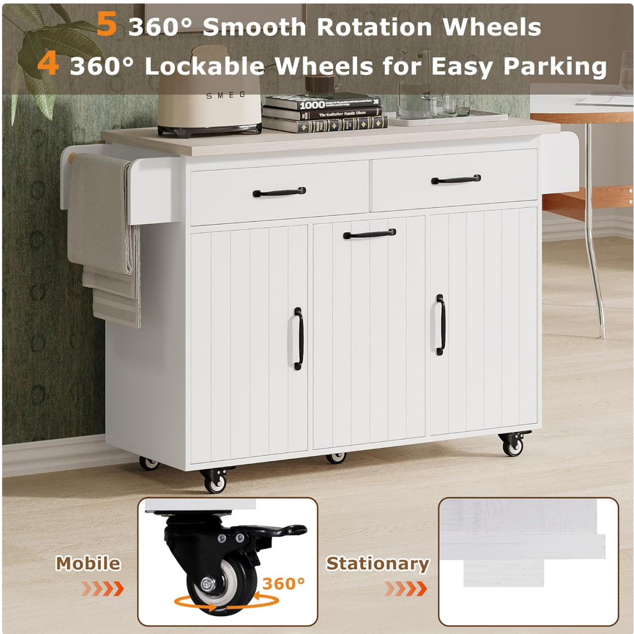
Figure 3.3.1: Mobile and stationary configuration options.