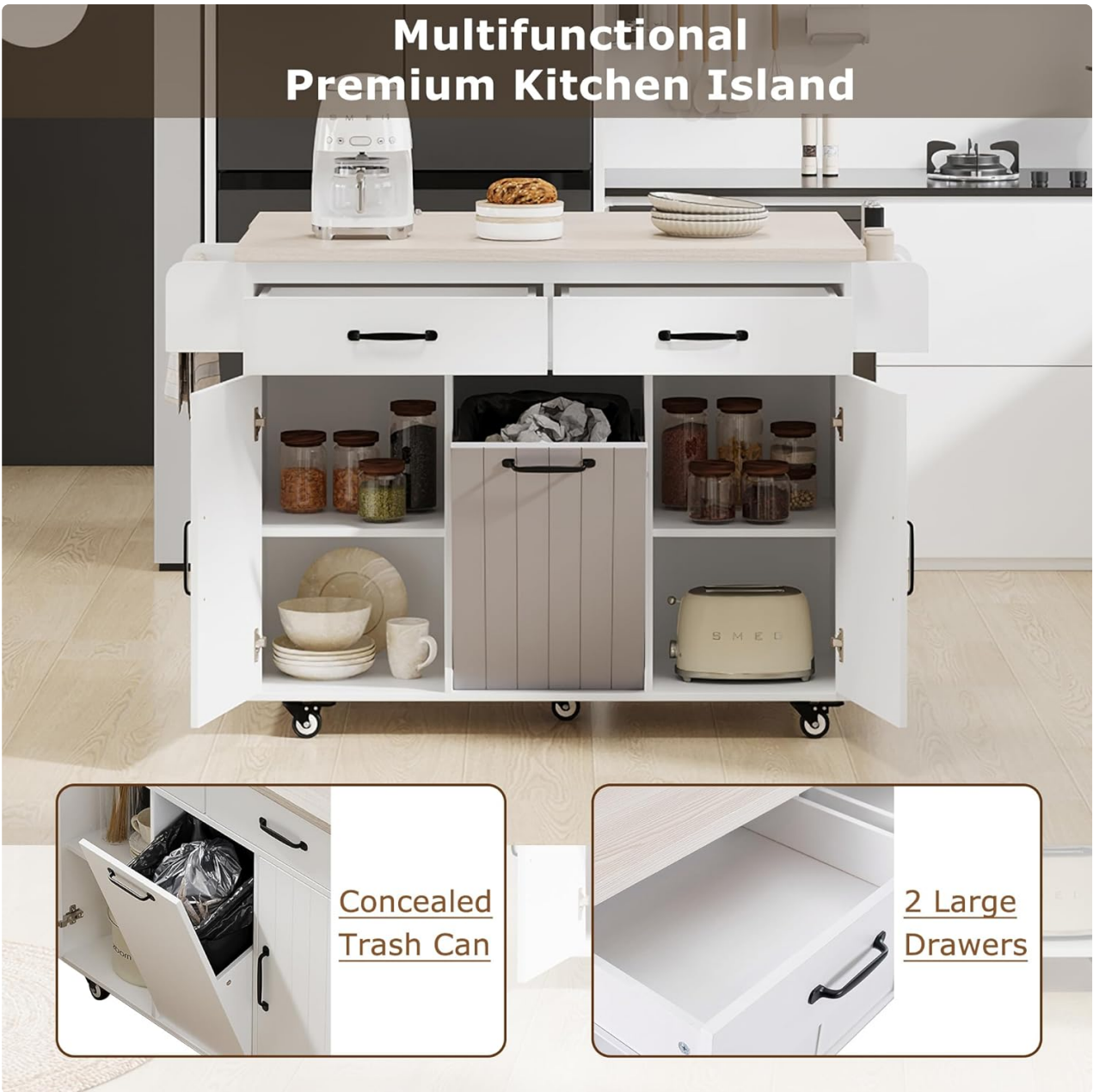
Figure 3.2.1: Overview of storage features including drawers and concealed trash bin.