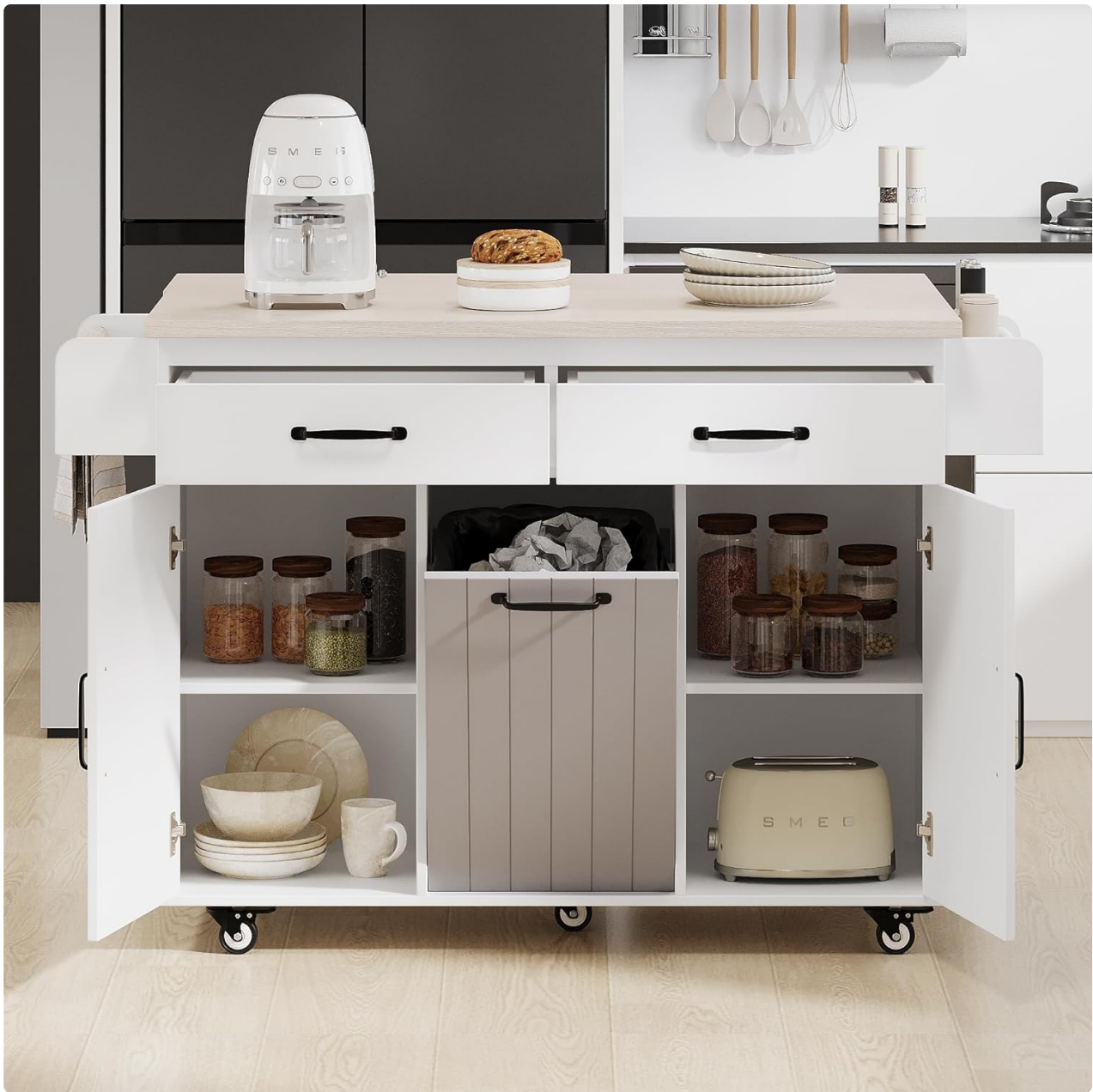
Figure 2.1: Front view of the cloblane Kitchen Island Cart with storage compartments open.

Key features include a multipurpose tilt-out trash can compartment, ample storage with drawers and adjustable shelves, a drop-leaf countertop for extended workspace, and both mobile (locking wheels) and stationary (cabinet feet) setup options.