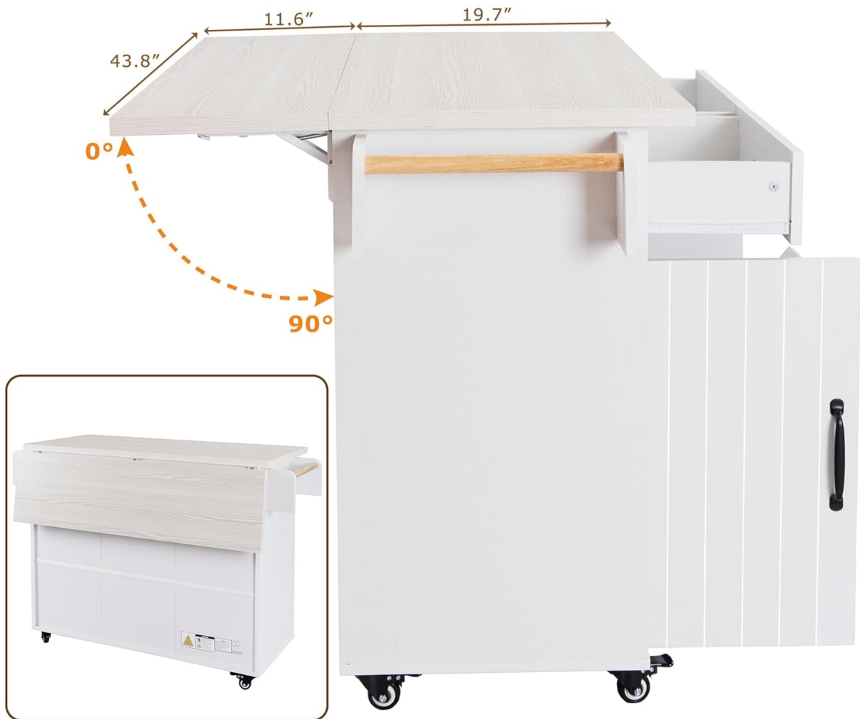
Figure 3.4.1: Drop leaf countertop in extended and folded positions.

Extending cooking space and drop down when not use.