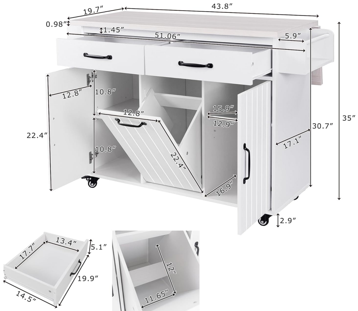
Figure 8.1: Product dimensions and weight capacities.