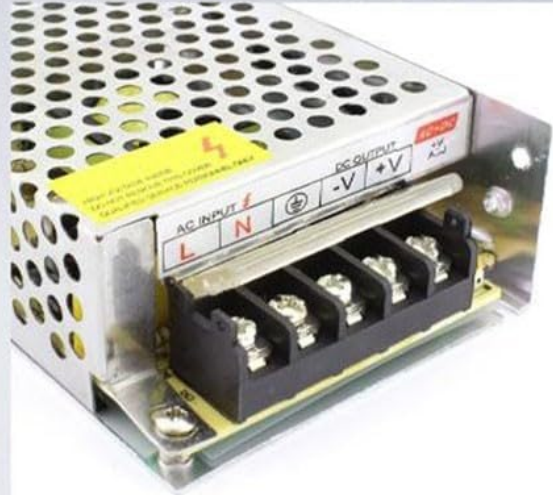
Switching power supply