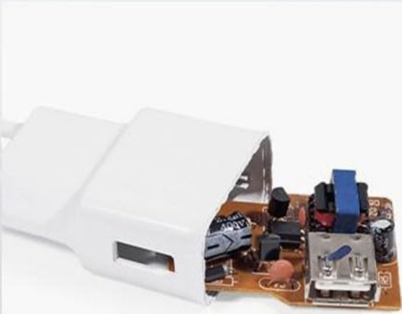
Power supply ripple