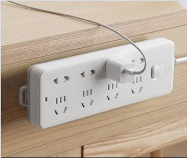
220V mains power