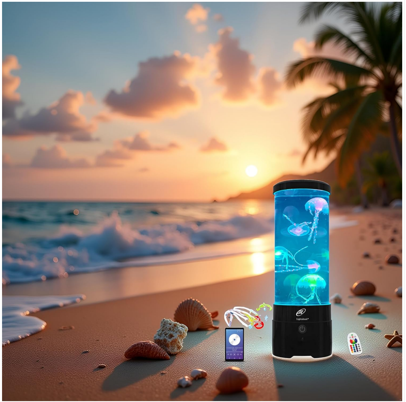
Image: All components included with the Lightahead Jellyfish Lamp, showing the main unit, jellyfish, remote control, and power accessories.