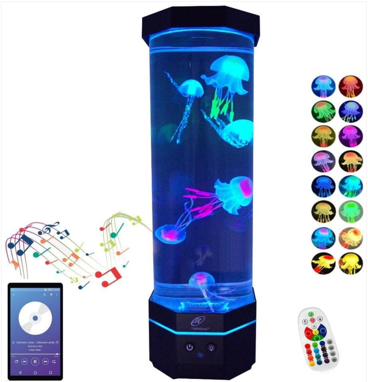
Image: The Lighthead Jellyfish Lamp in operation, displaying multiple colorful jellyfish models illuminated by internal LEDs.