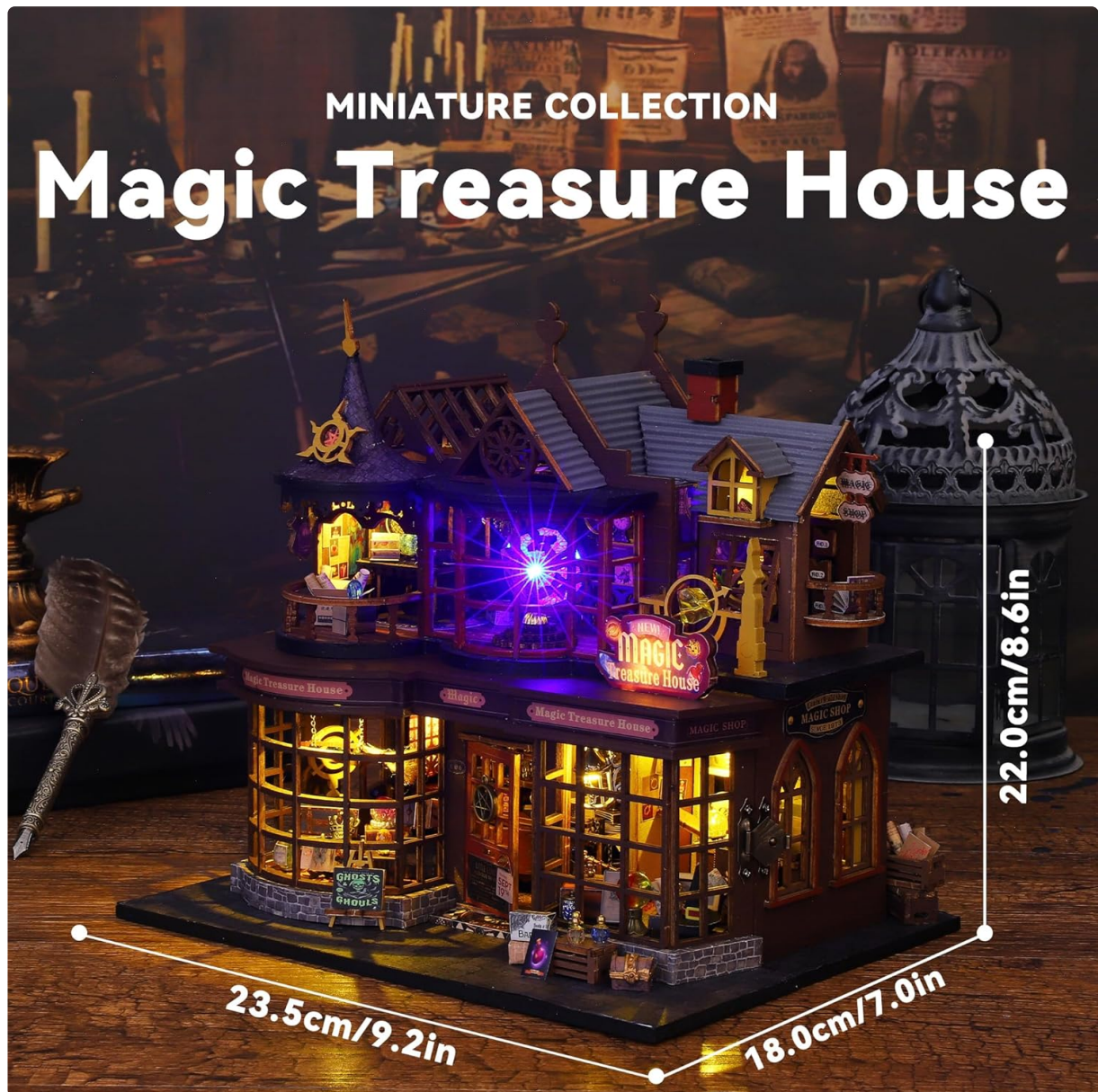
Image: The assembled dollhouse with its dimensions clearly marked, indicating its compact size.