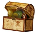
Image: The fully assembled Flever Magic Treasure House, showcasing its intricate details and illuminated interior.