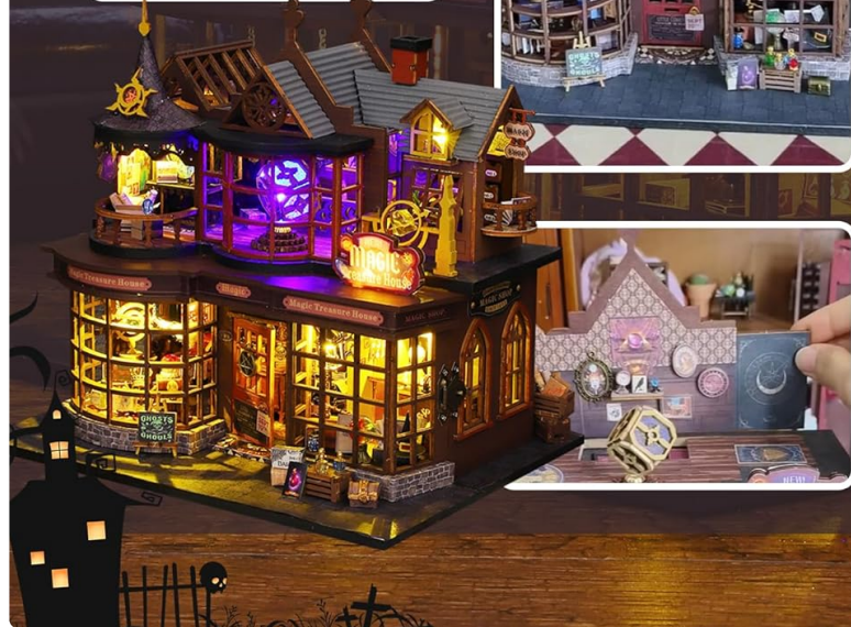
Image: The assembled dollhouse with its internal LED lights glowing, creating a cozy and enchanting atmosphere.