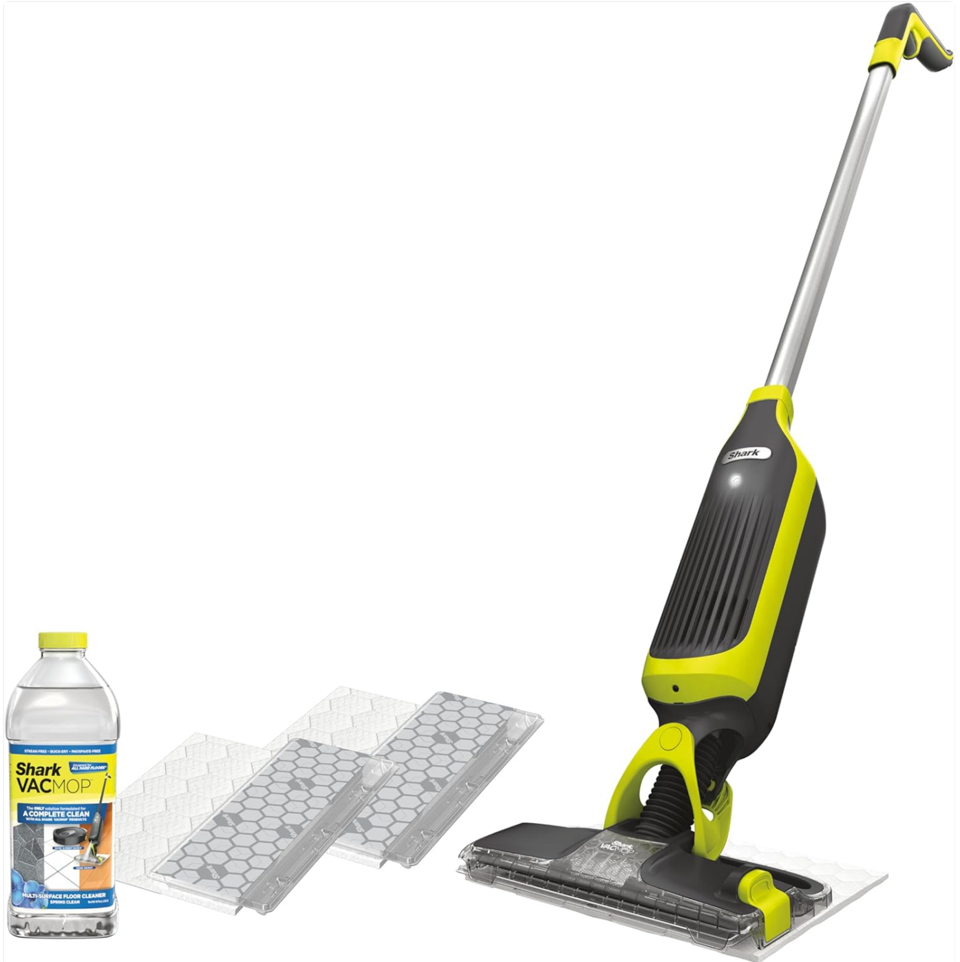
Figure 1: The Shark VACMOP VM180 unit, including the main body, handle, cleaning solution, and disposable VACMOP pads.