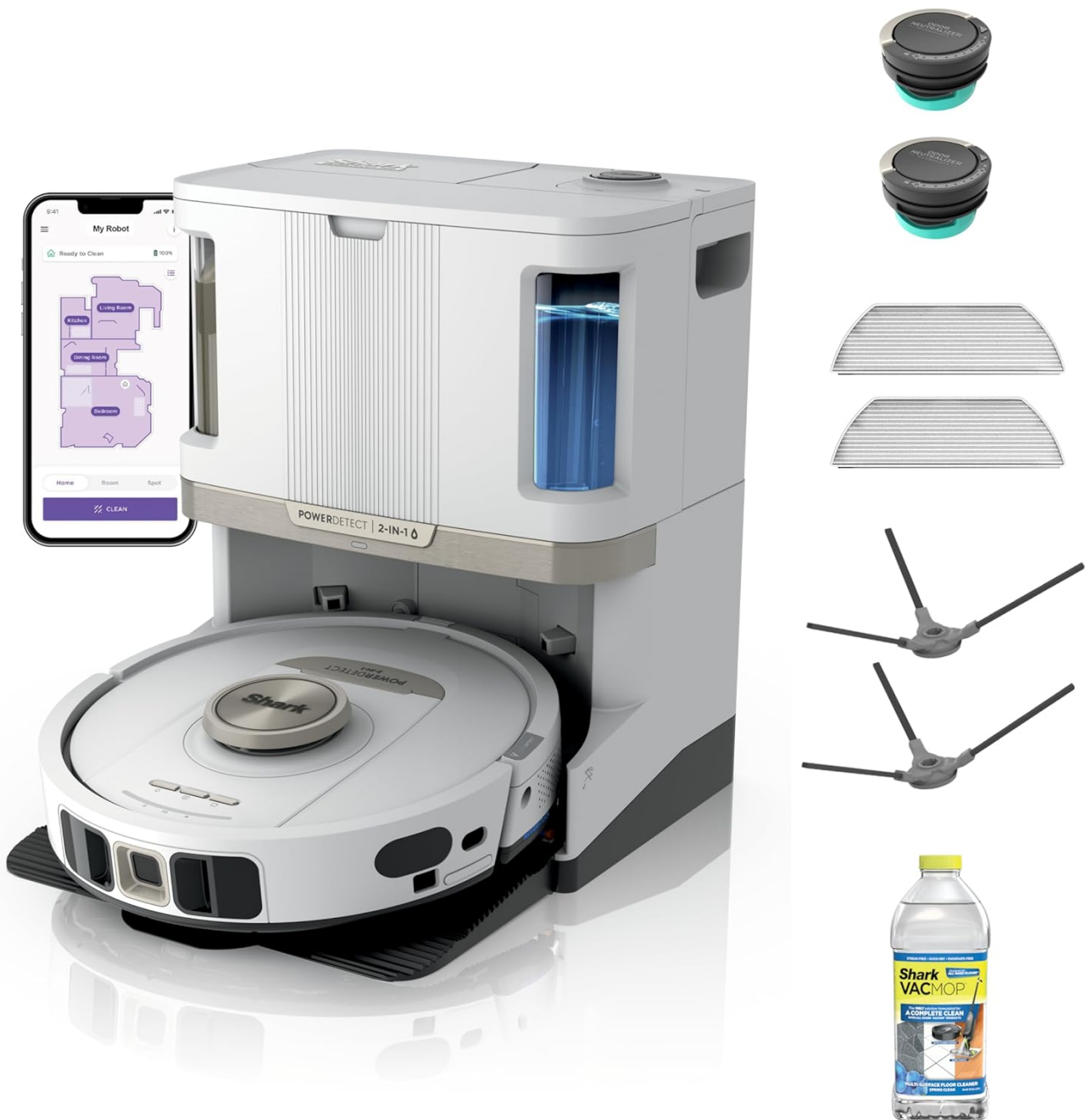
Figure 1: Shark PowerDetect NeverTouch Pro Robot Vacuum and Mop Combo with its self-emptying and self-refilling base station, alongside included accessories.