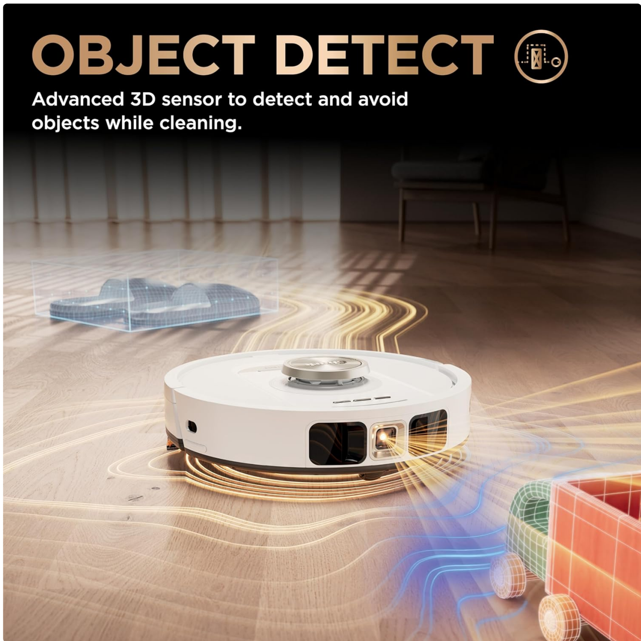
Figure 4: The robot's advanced 3D sensor actively detecting and avoiding objects and furniture during a cleaning cycle.

thresholds, ensuring comprehensive coverage.