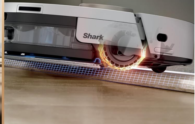
Figure 6: NeverStuck Technology in action, showing the robot lifting its mopping pad to prevent wetting carpets.