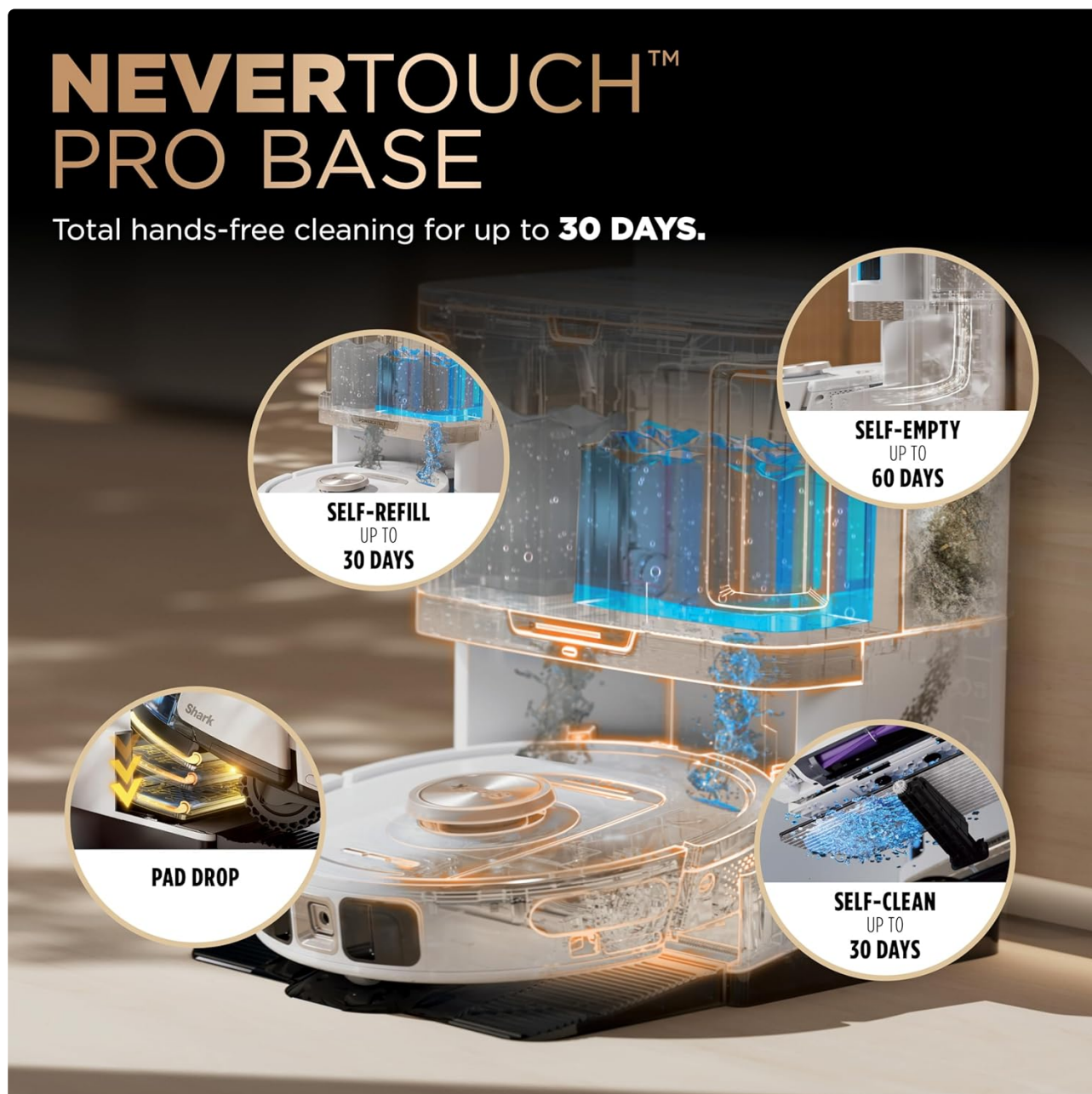
Figure 2: The NeverTouch Pro Base illustrating its self-emptying (up to 60 days), self-refilling (up to 30 days), pad drop, and self-cleaning (up to 30 days) functionalities.

Place the NeverTouch Pro Base on a hard, level surface against a wall, ensuring adequate clearance around it for the robot to dock and maneuver. Plug the base station into a power outlet. The base station is designed for hands-free operation, managing debris and water for up to 60 days (debris) and 30 days (water).