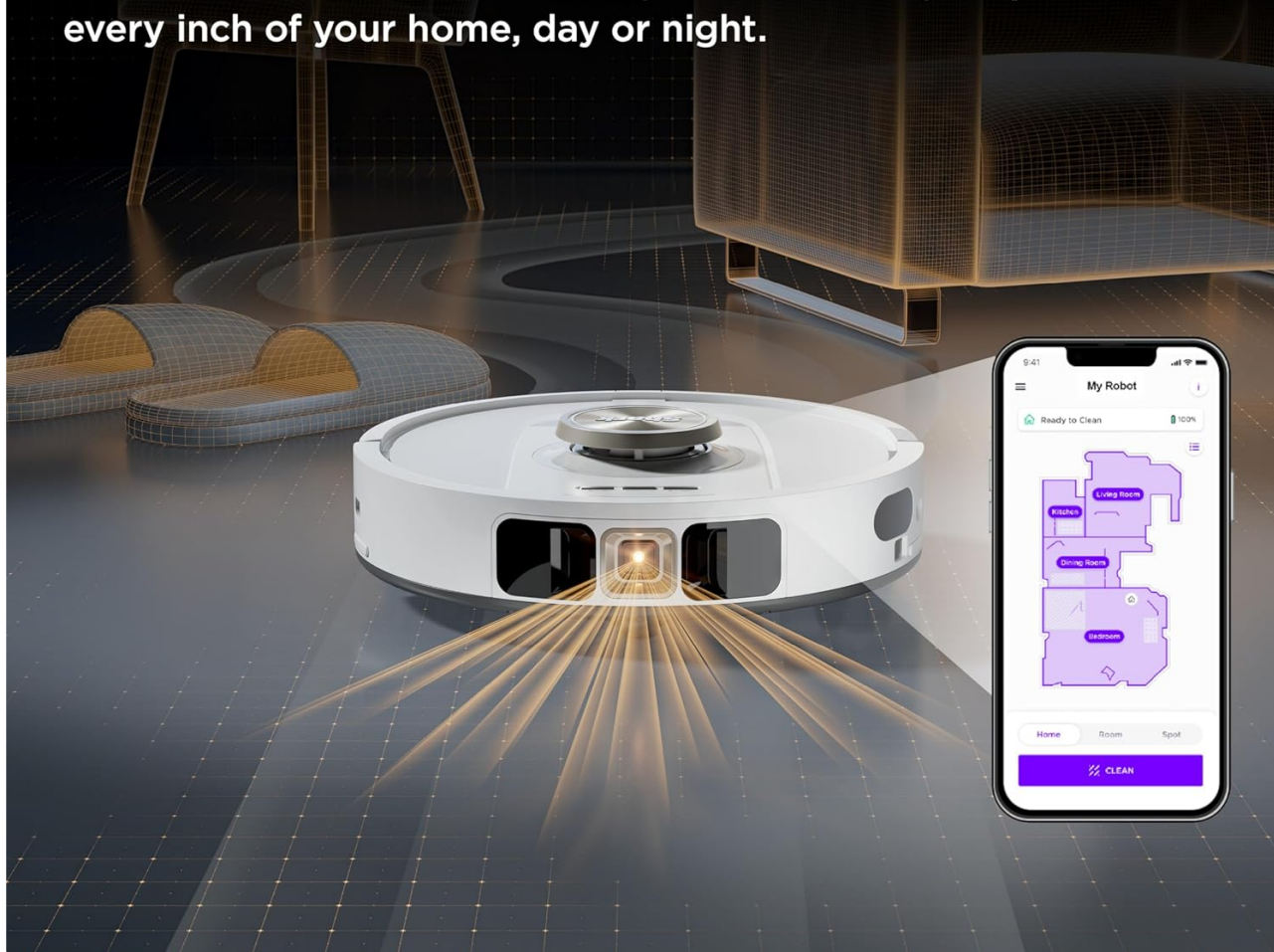
Figure 3: The robot utilizing 360° LiDAR vision for automatic and accurate home mapping, visible on the SharkClean app interface.

360° LiDAR vision automatically and accurately maps every inch of your home, day or night.