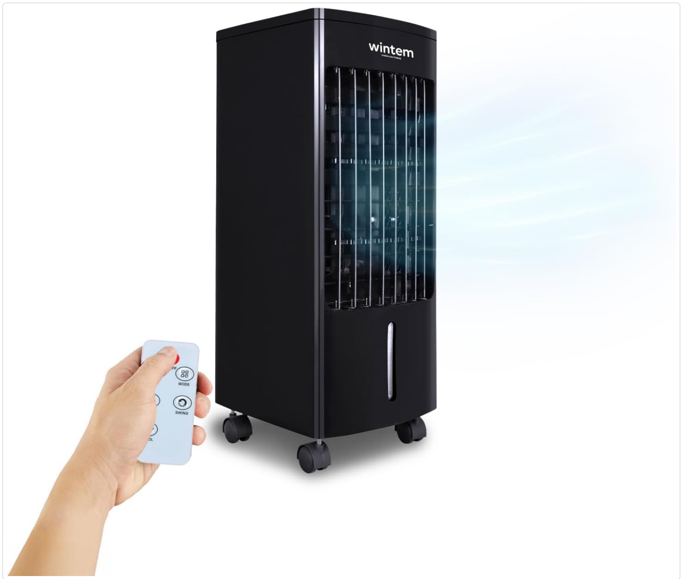
Image: The Wintem Arctic Cooling Fan, a black tower unit with a visible water level indicator, shown alongside its white remote control. The unit is on wheels, indicating portability.