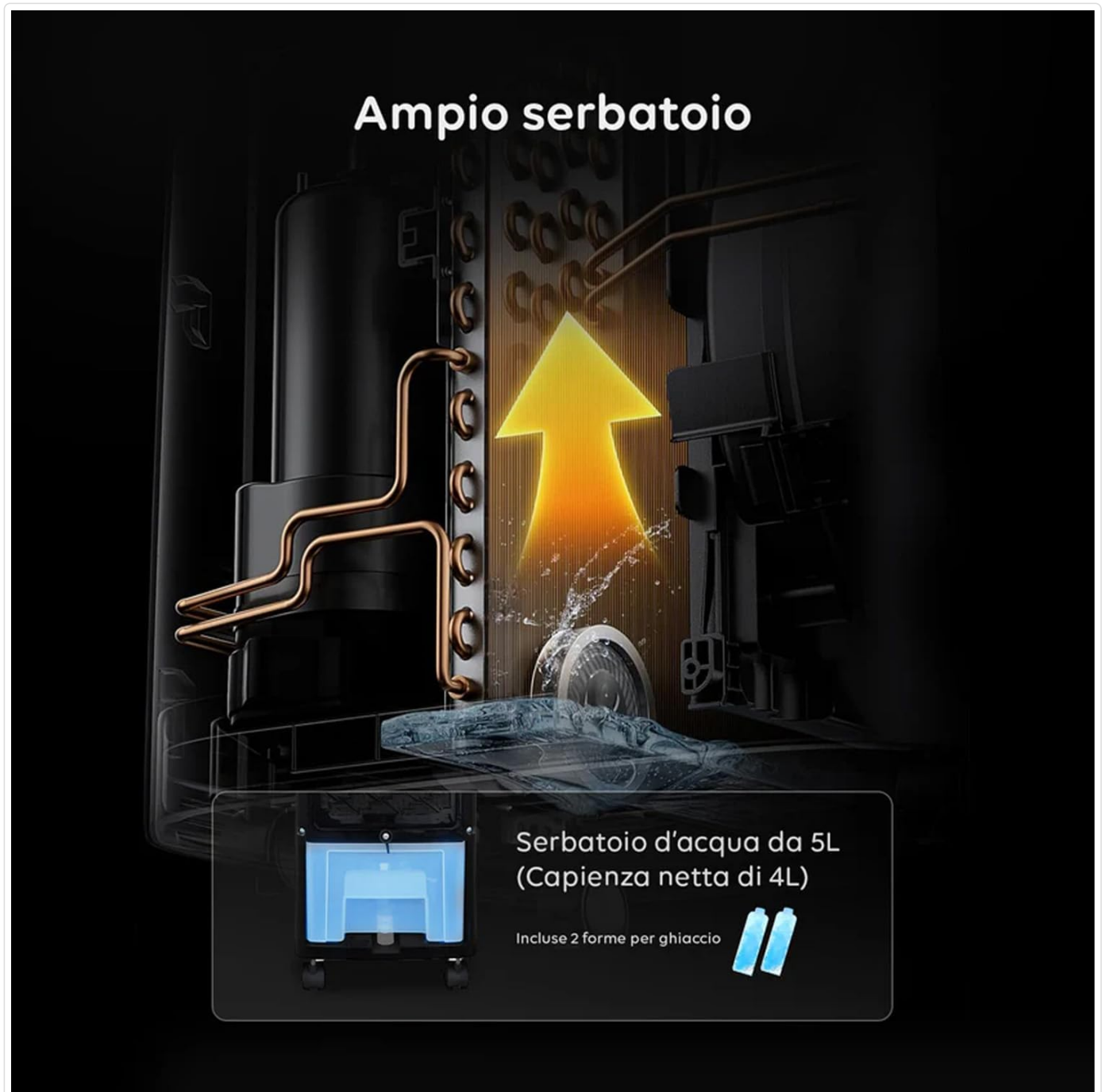
Image: An internal diagram showing the water tank (5L capacity, 4L net) and the cooling mechanism, with an arrow indicating the upward flow of cool air. Two ice pack forms are also depicted.