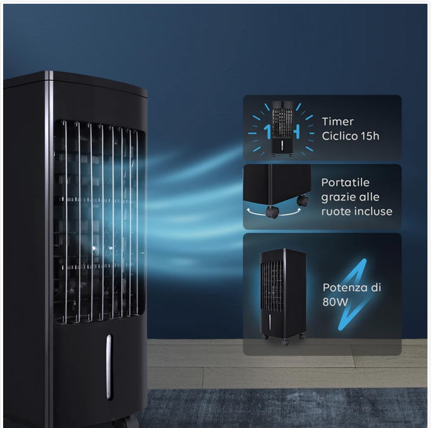
Image: Diagram highlighting key features: a 15-hour cyclic timer, portability with included wheels, and 80W power output. The main unit is shown with air flowing from its side.