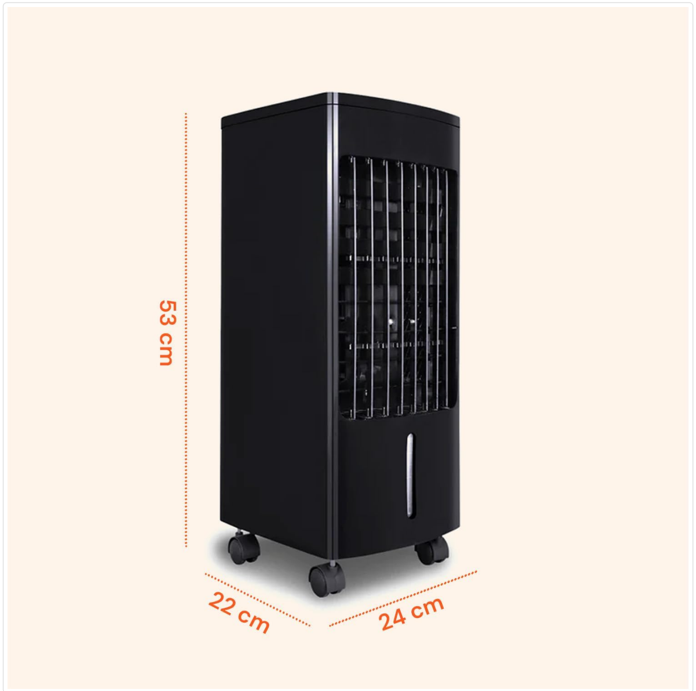
Image: A diagram showing the dimensions of the Wintem Arctic Cooling Fan: 53 cm height, 22 cm width, and 24 cm depth.