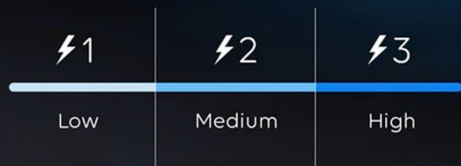
Image: A graphic illustrating the low noise level of 50.2 dB(A) and the three speed settings: Low, Medium, and High, with the fan unit in the background.