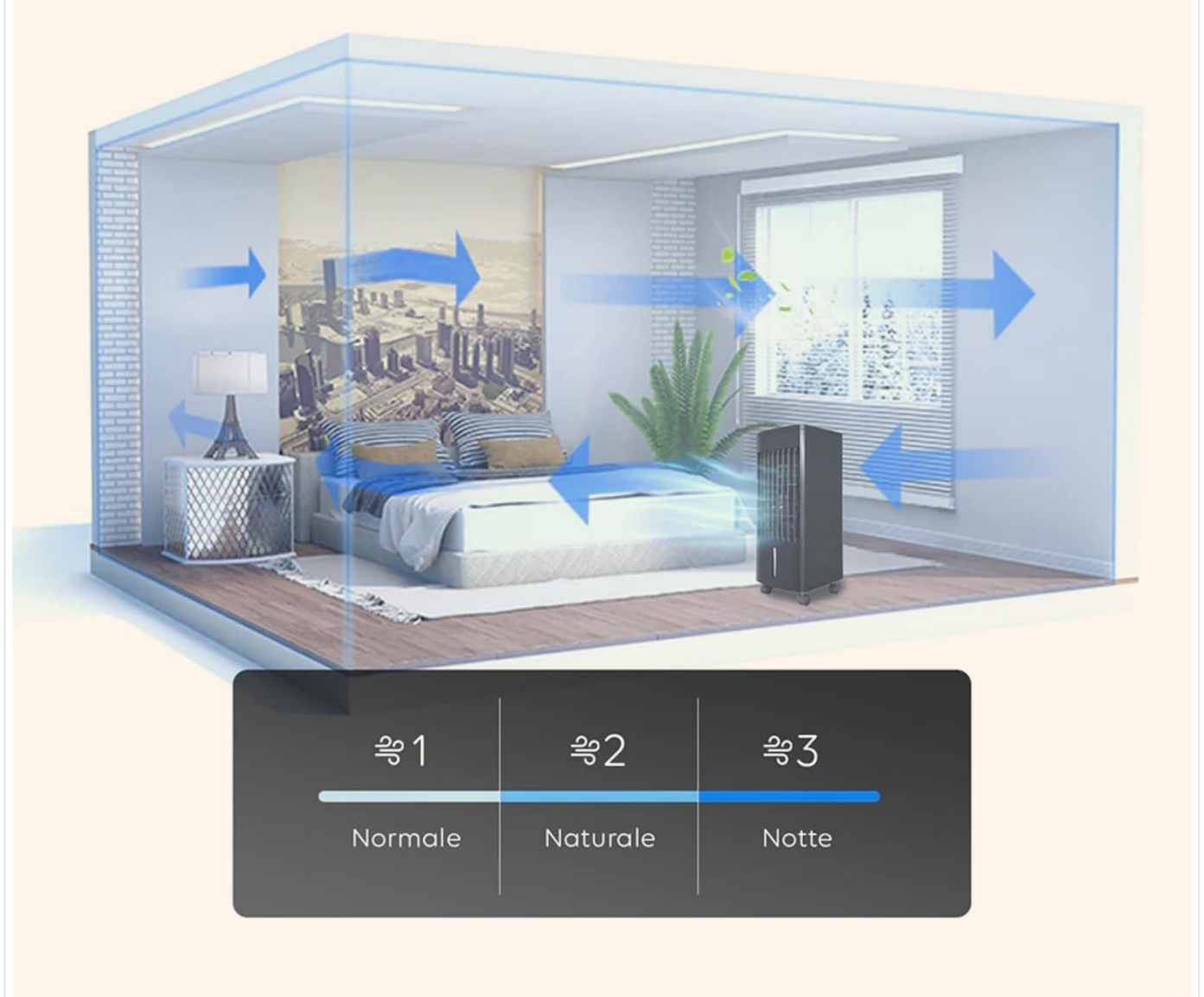
Image: An illustration demonstrating the three ventilation modes: Normal, Natural, and Night. The diagram shows air circulation within a room, with the fan positioned to cool the space.