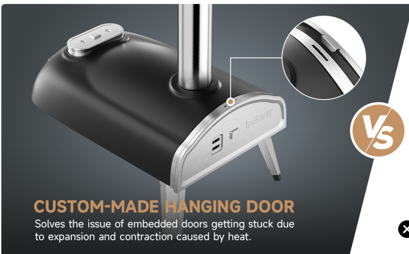
Image: A detailed view of the oven's custom-made hanging door, designed to prevent sticking, and the built-in thermometer for precise temperature monitoring.

For Precision Cooking Easier to use than an external