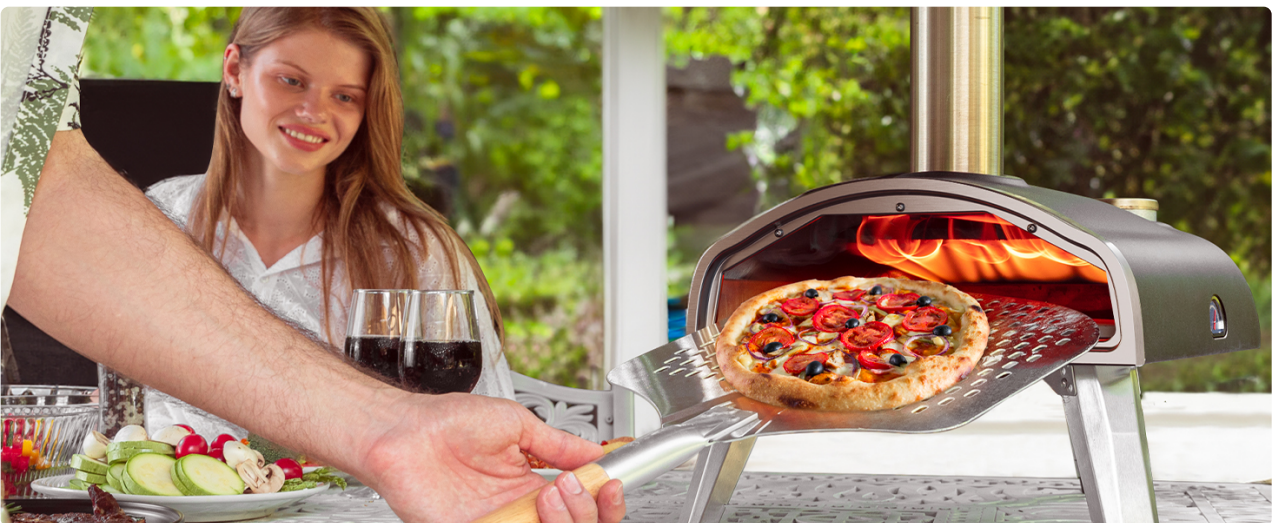
Image: A close-up of a pizza baking inside the hot oven, showcasing the intense heat and cooking process.

Image: A pizza cooking inside the oven, emphasizing the fast cooking capabilities due to optimized airflow and heat transfer.