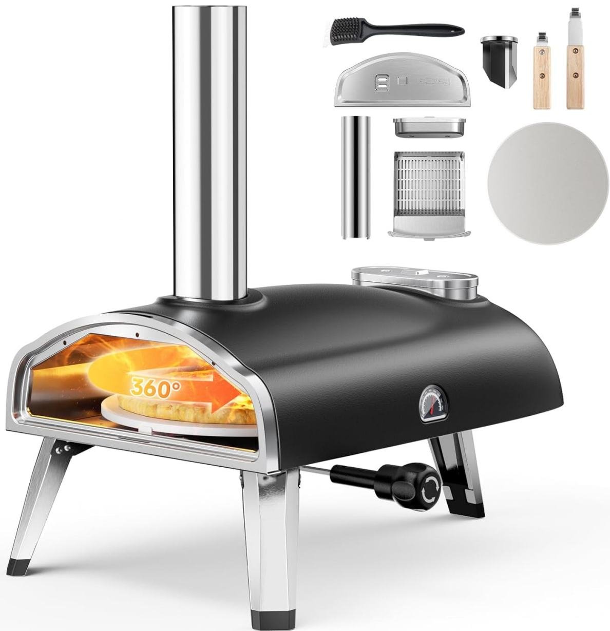
Image: The IsEasy 12-inch Outdoor Wood Fire Pizza Oven shown with its main components including the oven body, chimney, and various accessories.