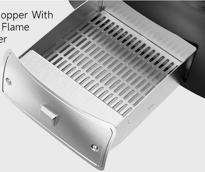
Fuel Hopper With Wider Flame Stopper