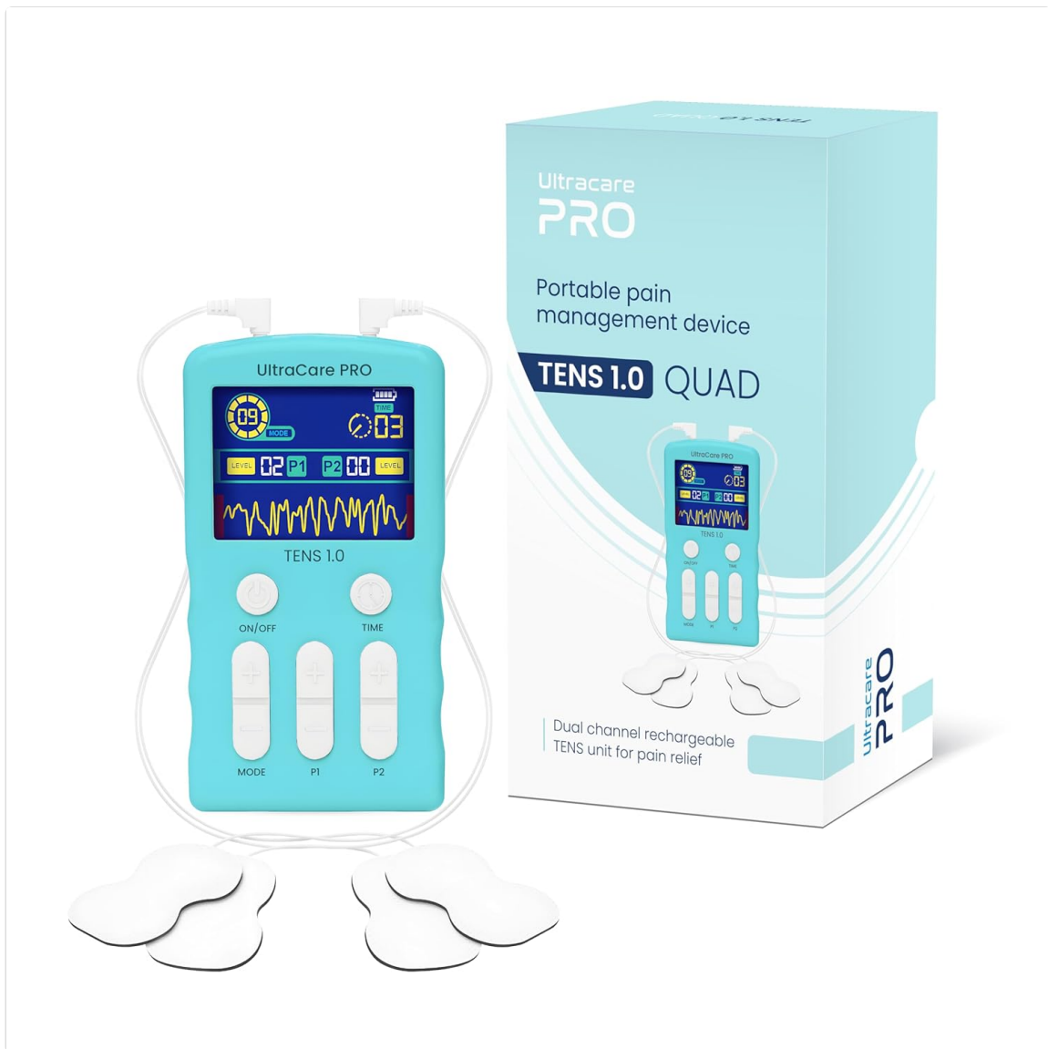
Image: UltraCare PRO TENS 1.0 QUAD device and its retail packaging.