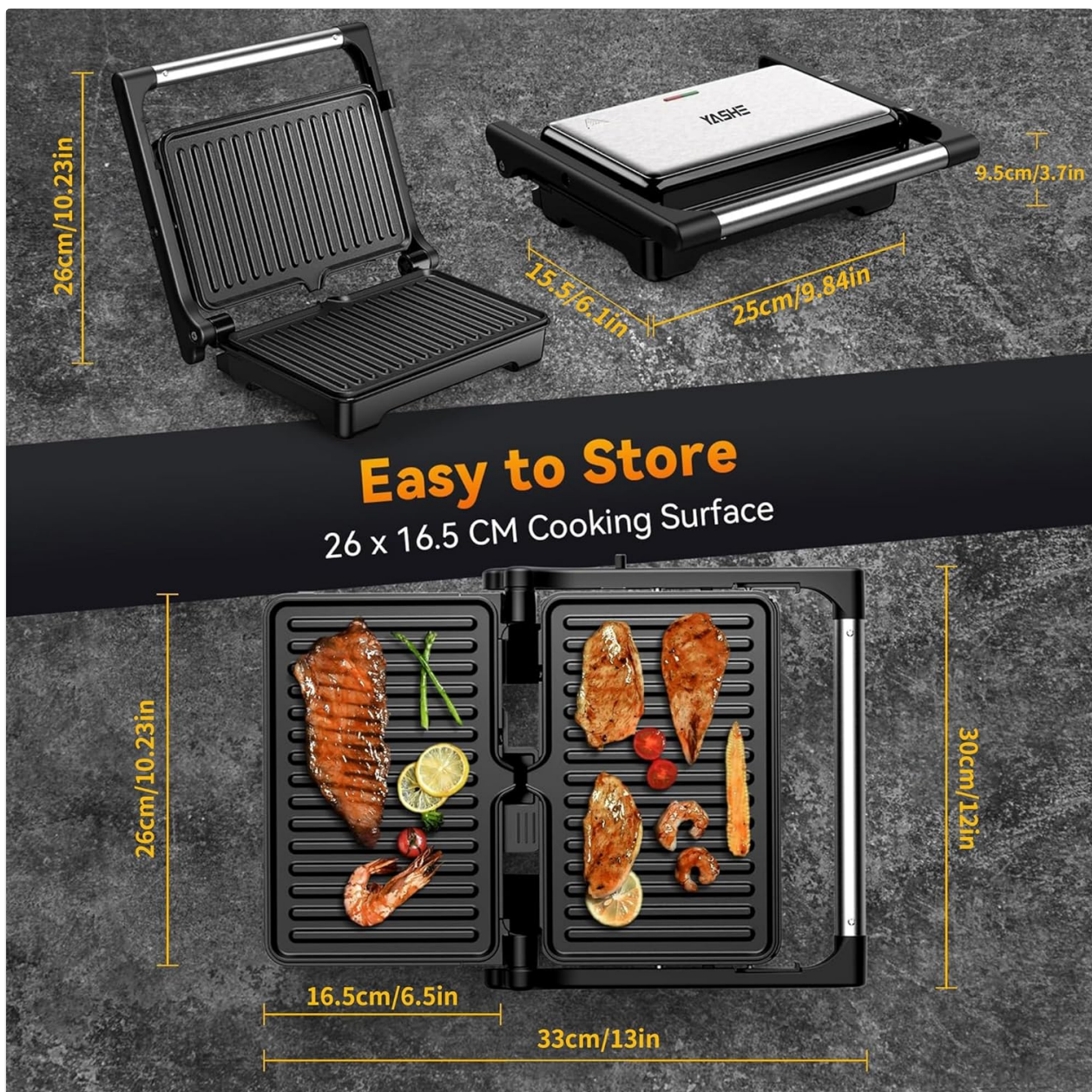
Figure 5: Dimensions and compact design for easy storage of the panini press.