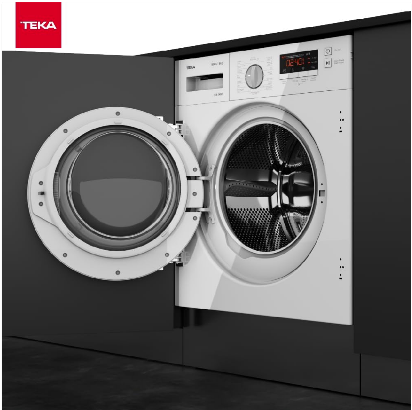
Figure 3.2: The Teka Li6 1481 washing machine integrated into kitchen cabinetry, with the cabinet door open, revealing the appliance's front-loading door.