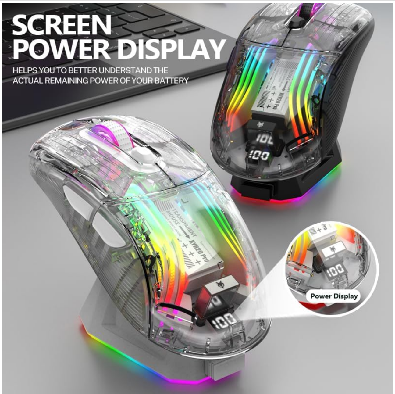
Image: Close-up of the mouse's digital power display.