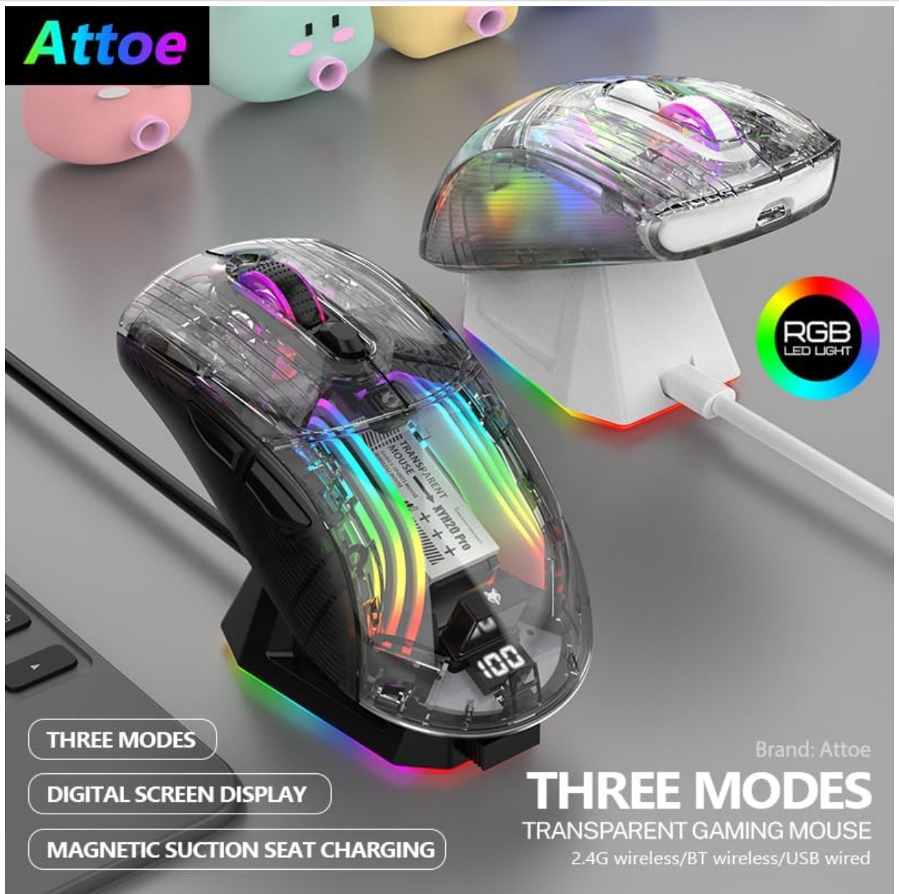
Image: Two Attoe mice (black and white) illustrating the three connection modes.