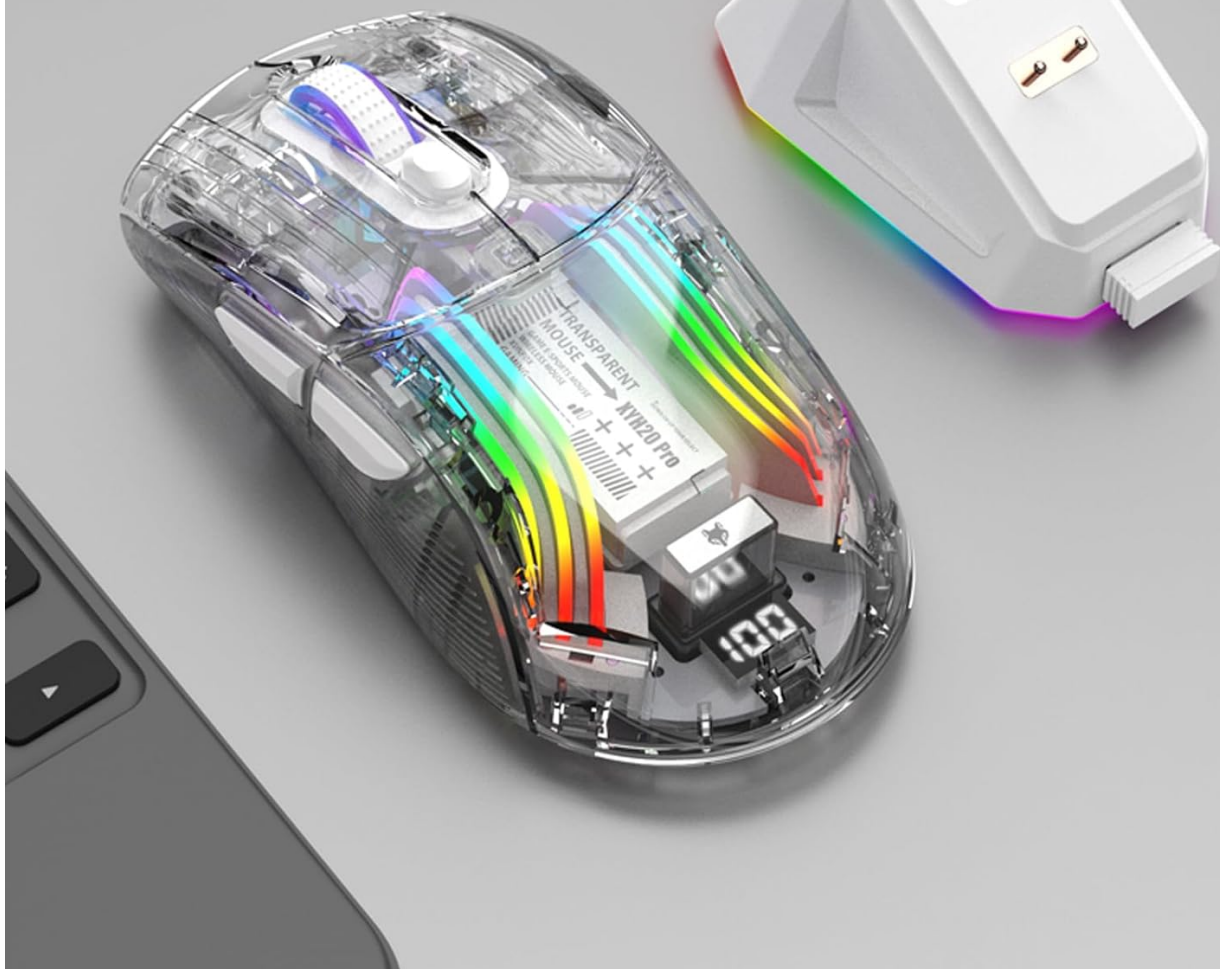
Image: Transparent shell of the mouse showcasing the internal RGB lighting.

High-purity PP crystal is selected, with high standard for double detection, Reject cheap and inferior workshop materials