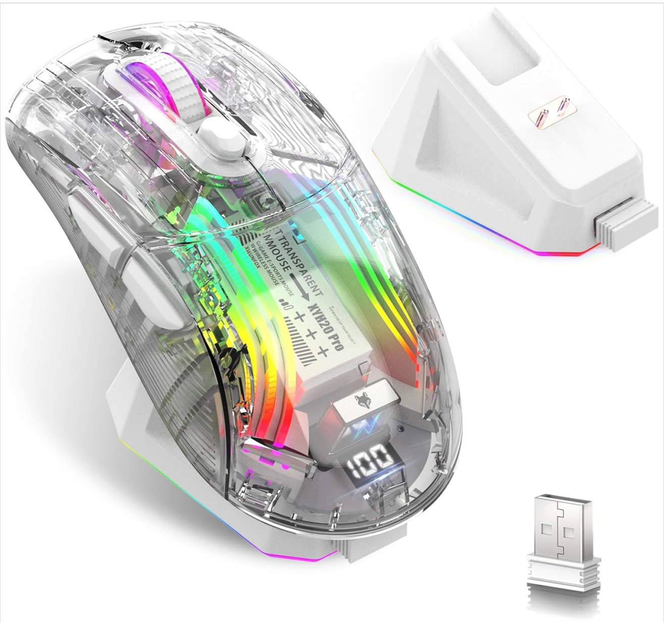
Image: Attoe Wireless Gaming Mouse, charging base, and USB receiver.