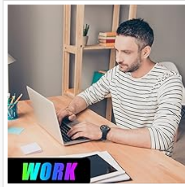
Image: Visual representation of the mouse's quiet click functionality.

The mouse is designed with silent click buttons, providing a quiet user experience suitable for various environments without disturbing others.