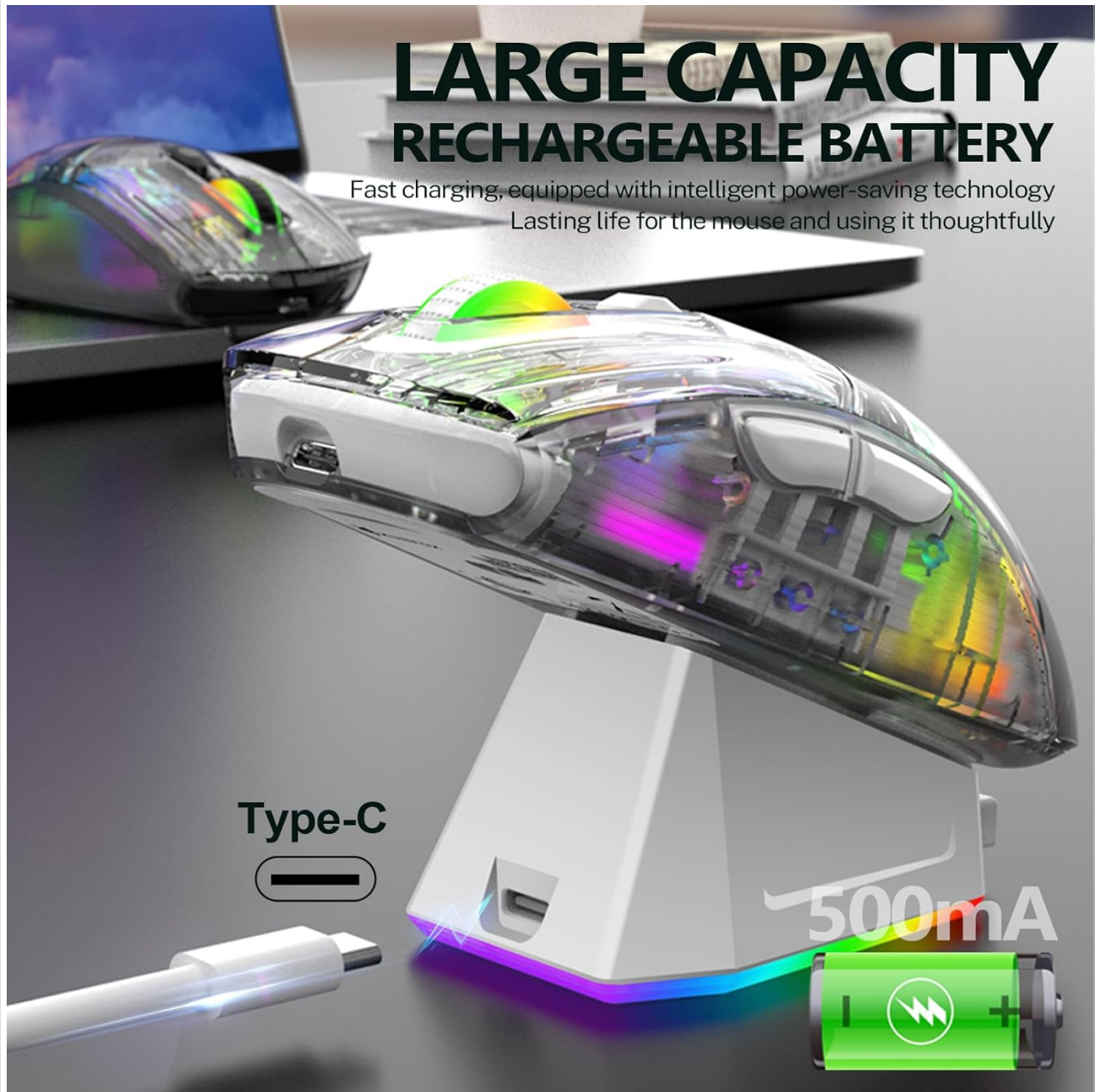
Image: Mouse on charging base, connected via Type-C cable.

The mouse features a digital display at the rear, showing the current power level. This allows you to monitor the battery status at any time.