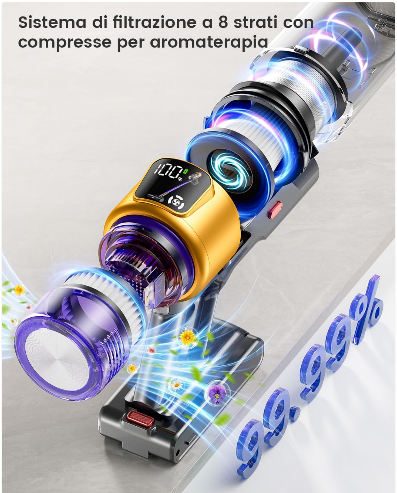
Figure 6.1: Components of the 8-layer filtration system.