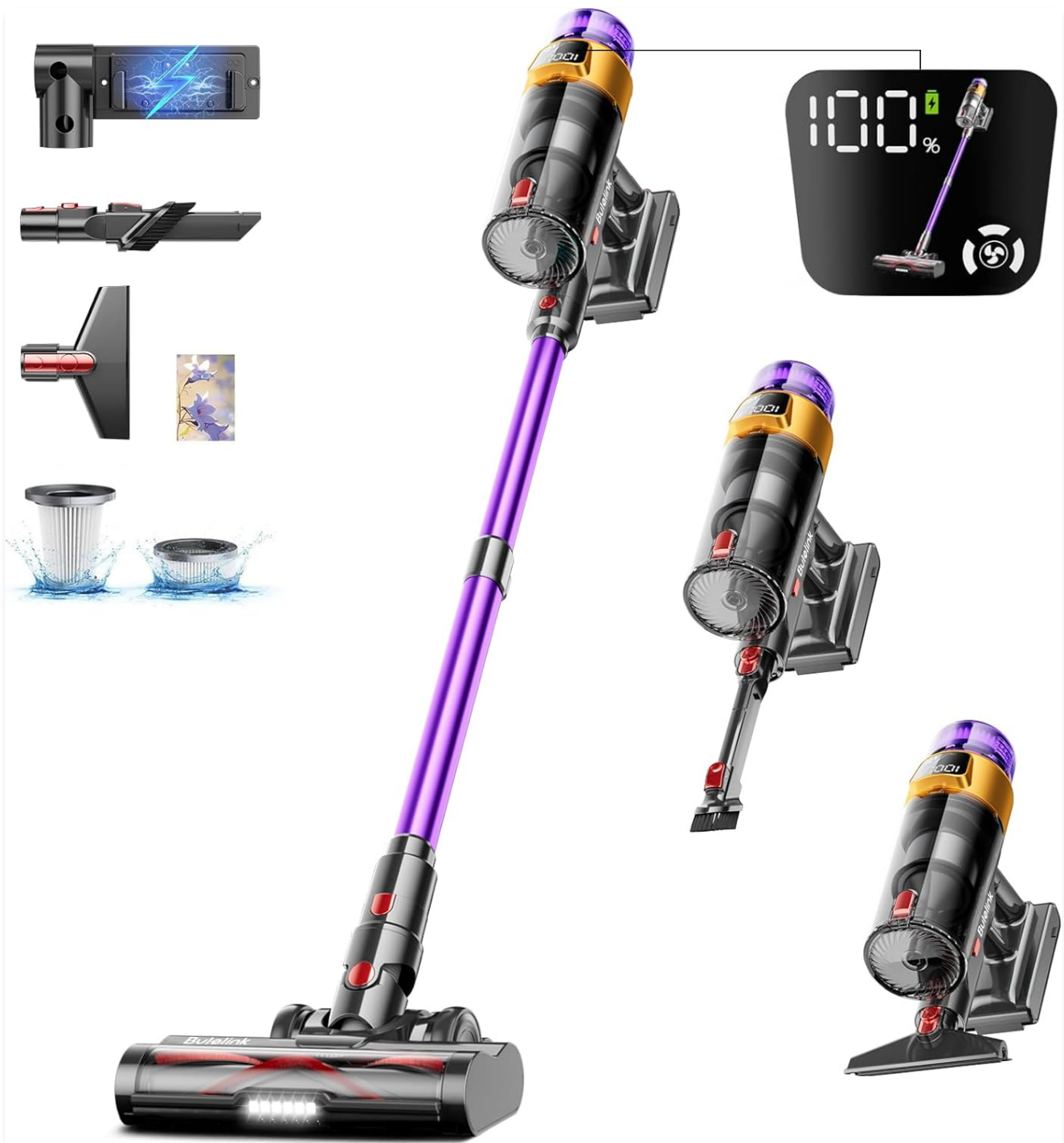
Figure 3.1: All components included in the package.