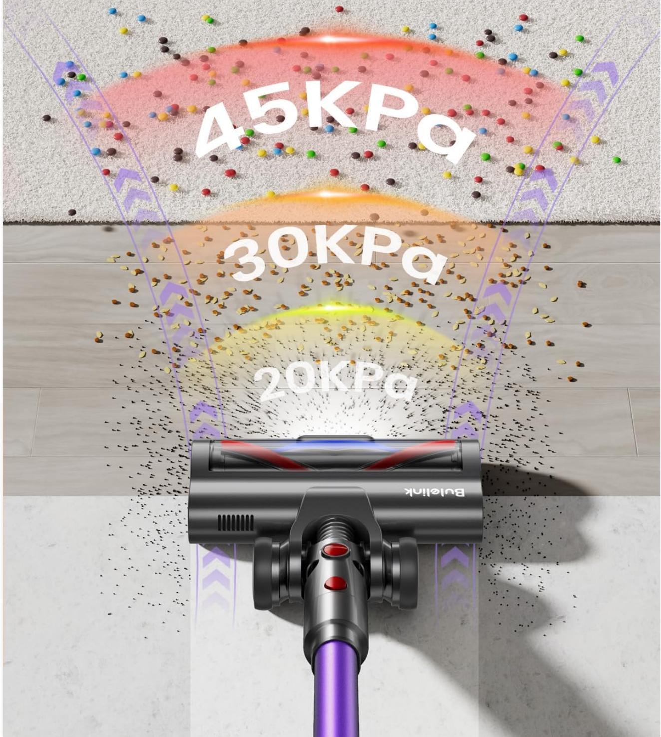
Figure 5.1: Visual representation of the three suction power levels.