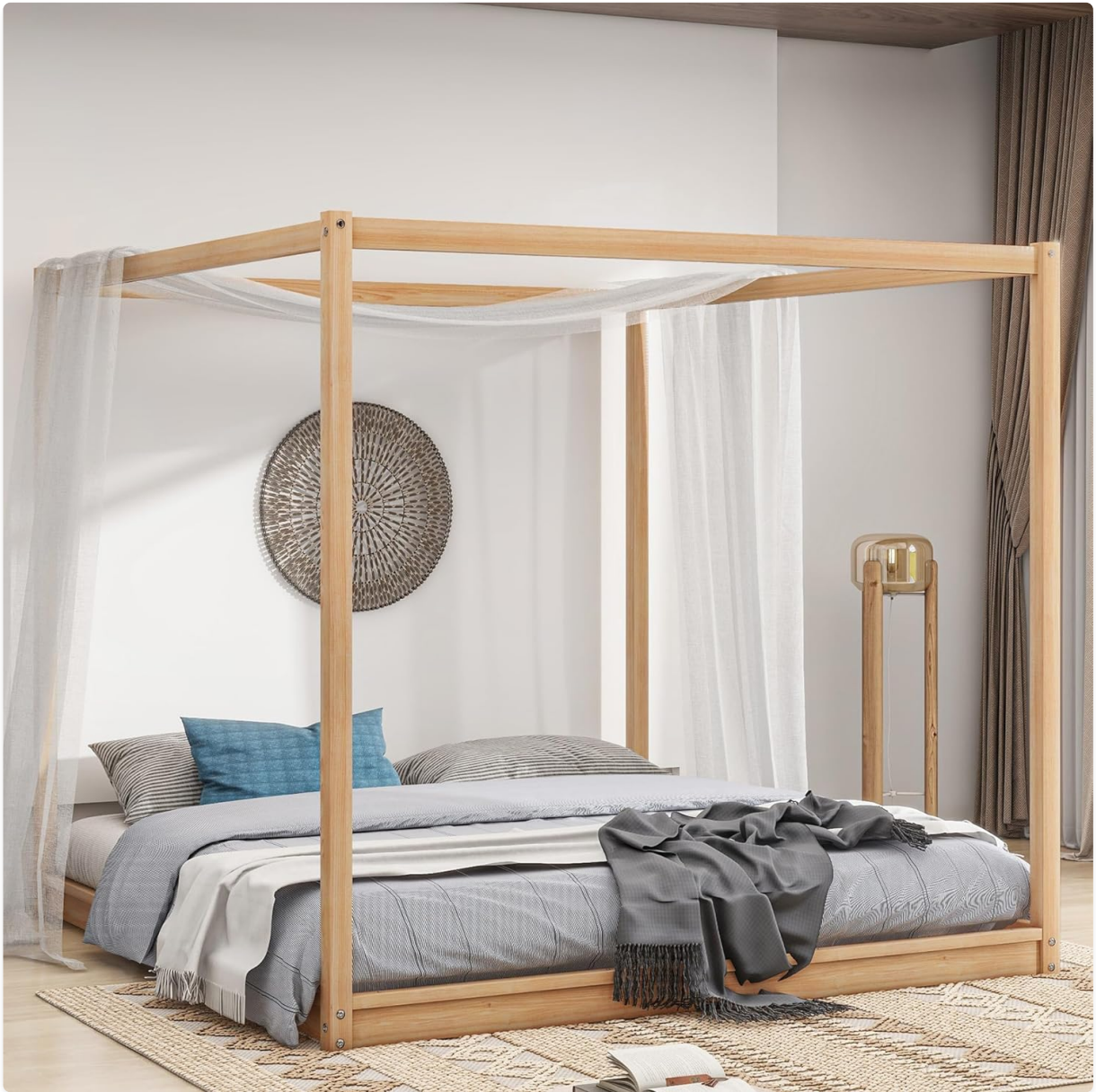
Image: Bellemave King Size Canopy Bed with white sheer curtains and bedding. This image displays the fully assembled bed with a mattress, pillows, and a blue blanket, adorned with sheer white curtains on the canopy frame.