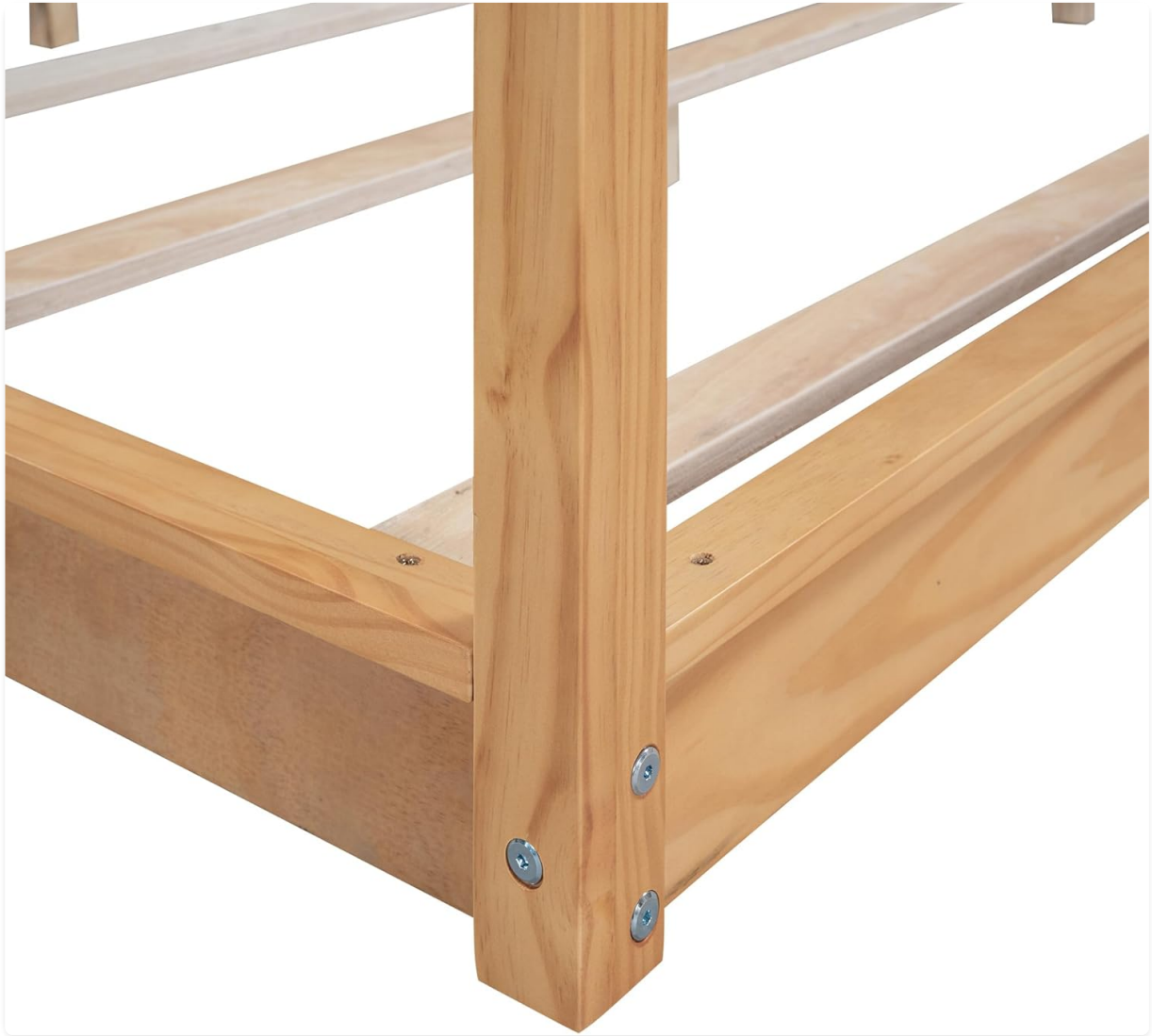
Image: Close-up view of a corner joint on the King Size Canopy Bed frame, showing secure screw connections. This detailed shot focuses on the robust construction of the bed frame's corners, illustrating how the wooden components are joined with screws for stability.