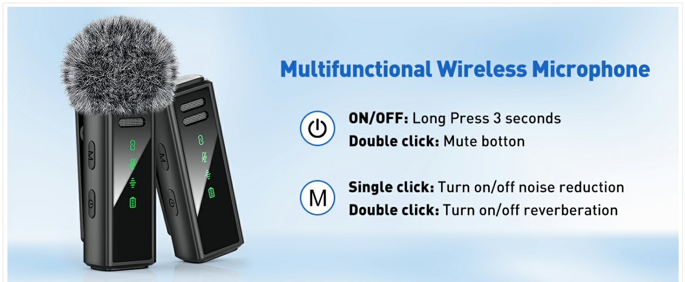
Image 3.1: Diagram illustrating the control functions of the VEZQUA J88 microphone, including power, mute, noise reduction, and reverberation buttons.