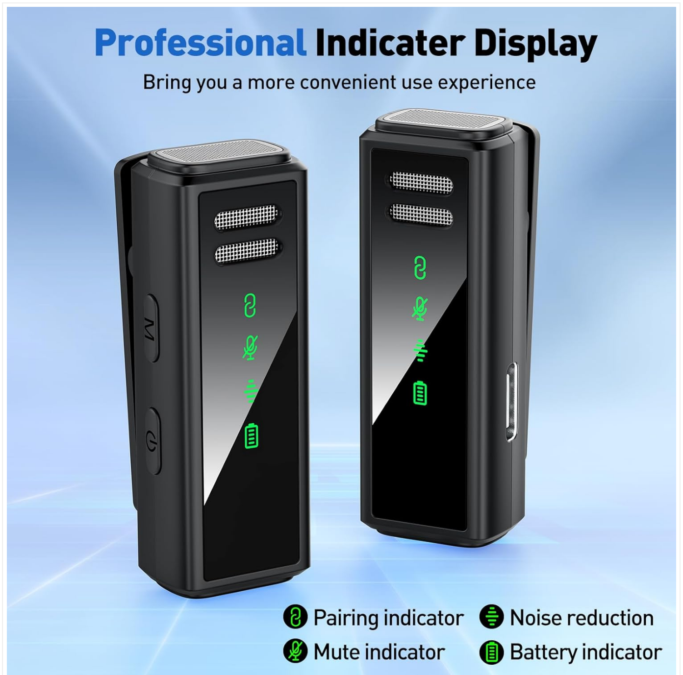
Image 3.2: Close-up of the VEZQUA J88 microphone showing the professional indicator display for pairing, noise reduction, mute, and battery status.