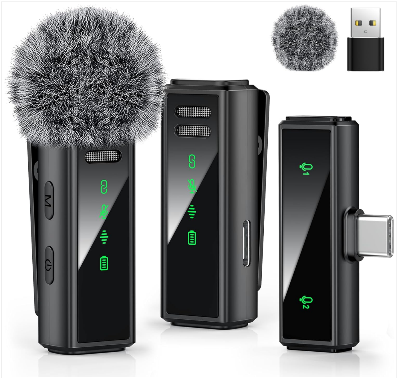
Image 1.1: Overview of the VEZQUA J88 wireless lavalier microphone system, showing two microphones with windproof covers and a USB-C receiver.