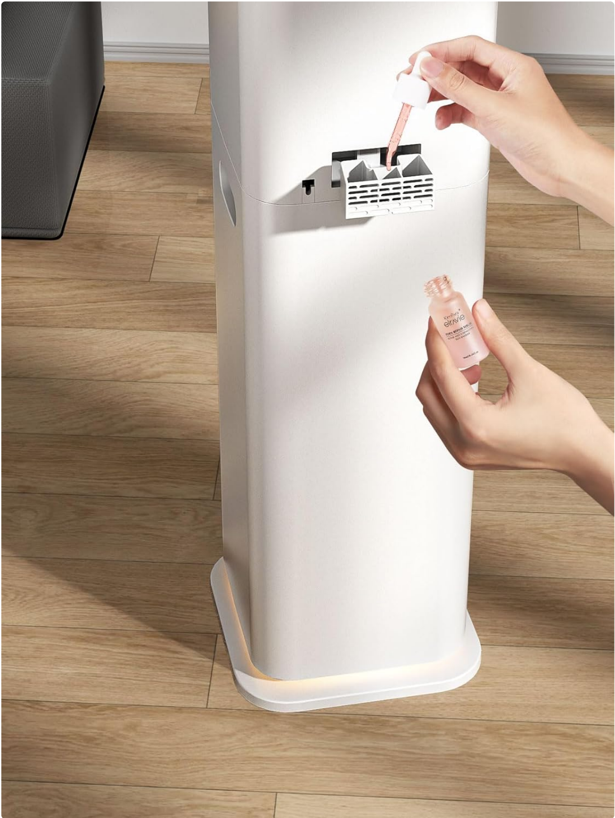
Figure 4: A hand is shown adding essential oil drops into the dedicated aroma tray located on the side of the humidifier, allowing for aromatherapy integration.