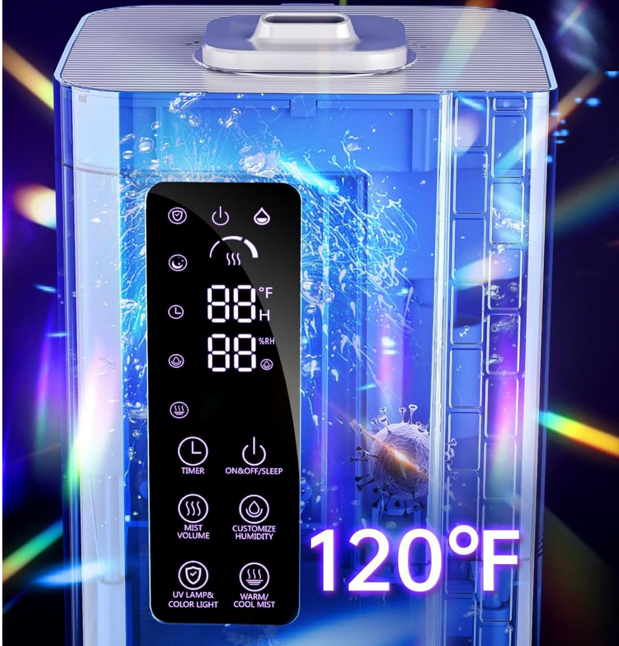
Figure 2: A close-up of the humidifier's digital control panel, indicating warm mist operation and a temperature of 120°F. The water tank is visible with blue-tinted water.