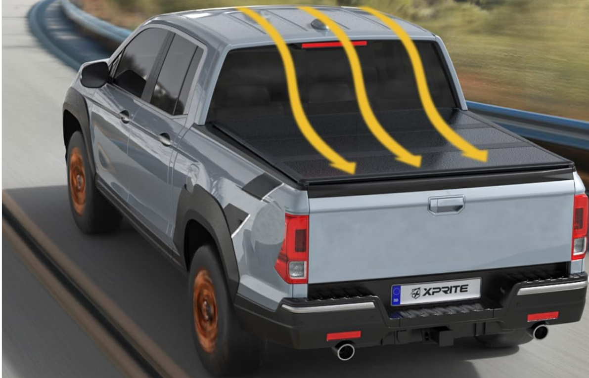
Image: A truck with the tonneau cover installed, driving on a road, with yellow lines indicating improved airflow and reduced wind resistance for better fuel efficiency.