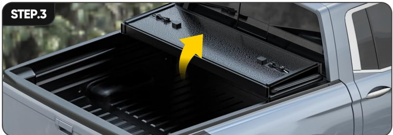
Image: A three-step visual guide demonstrating how to easily tri-fold the tonneau cover for convenient access to the truck bed.