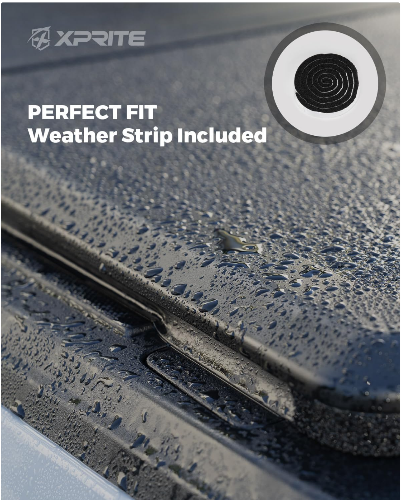
Image: A close-up view of the tonneau cover's weather strip, showing water droplets on its surface, indicating effective sealing against moisture.