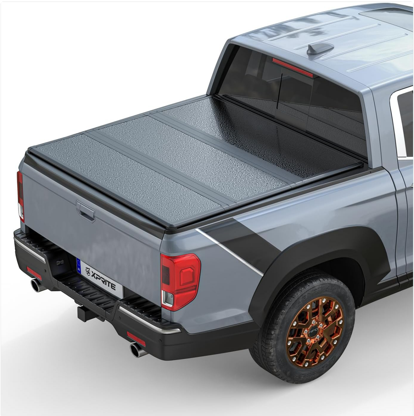
Image: Xprite Hard Tri-fold Tonneau Cover installed on a truck bed, showcasing its sleek, low-profile design.