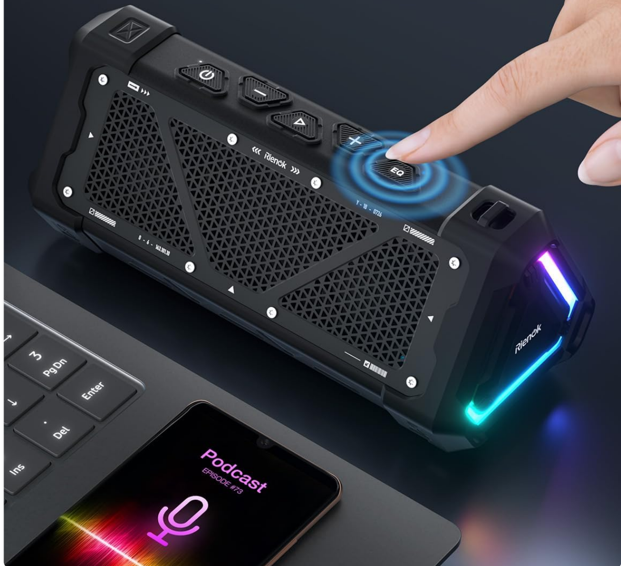
Figure 5: Shows the speaker with icons representing Vocal, Music, and Bass EQ modes.