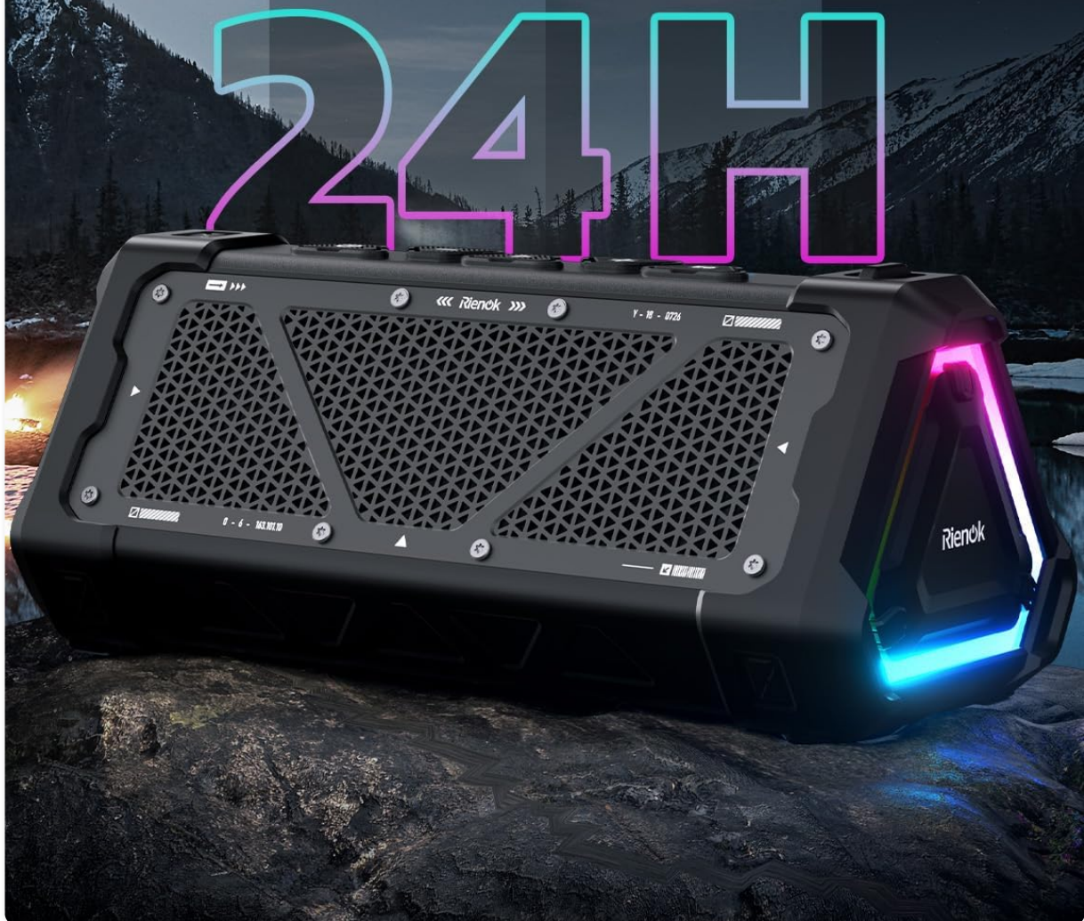
Figure 9: The speaker indicating up to 24 hours of playback time on a single charge.

Nota: El tiempo real varía según la luz, el volumen y el tipo de música