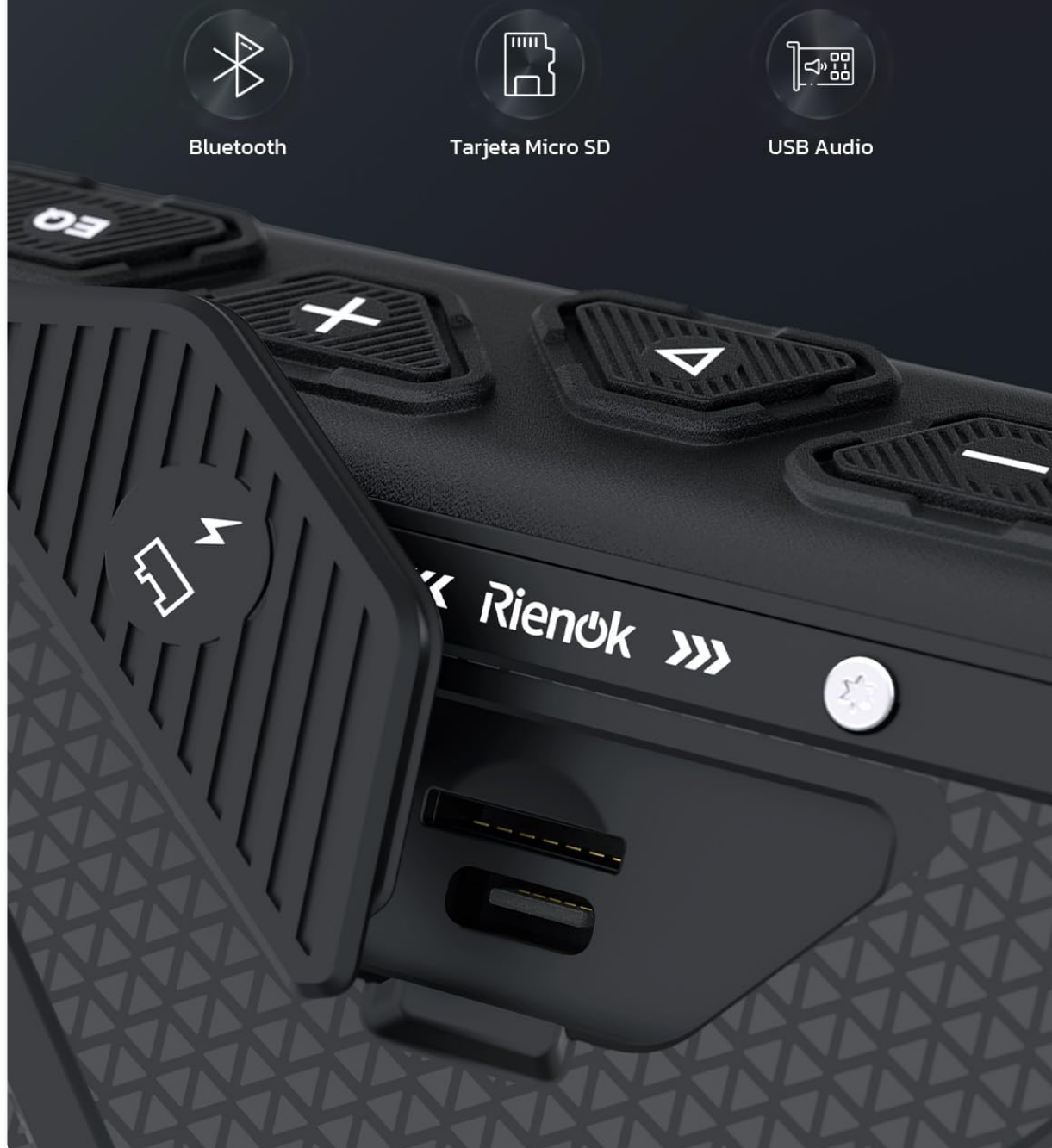
Figure 4: Depicts the three available playback modes: Bluetooth, Micro SD card, and USB Audio.