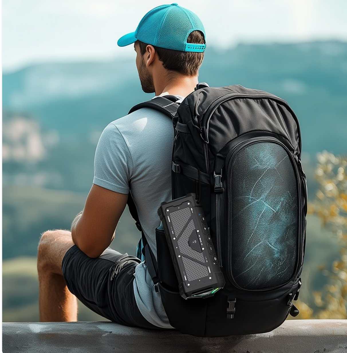
Figure 8: The portable RIENOK S11 speaker attached to a backpack, ready for outdoor use.

Disfrute de la música en cualquier momento y lugar