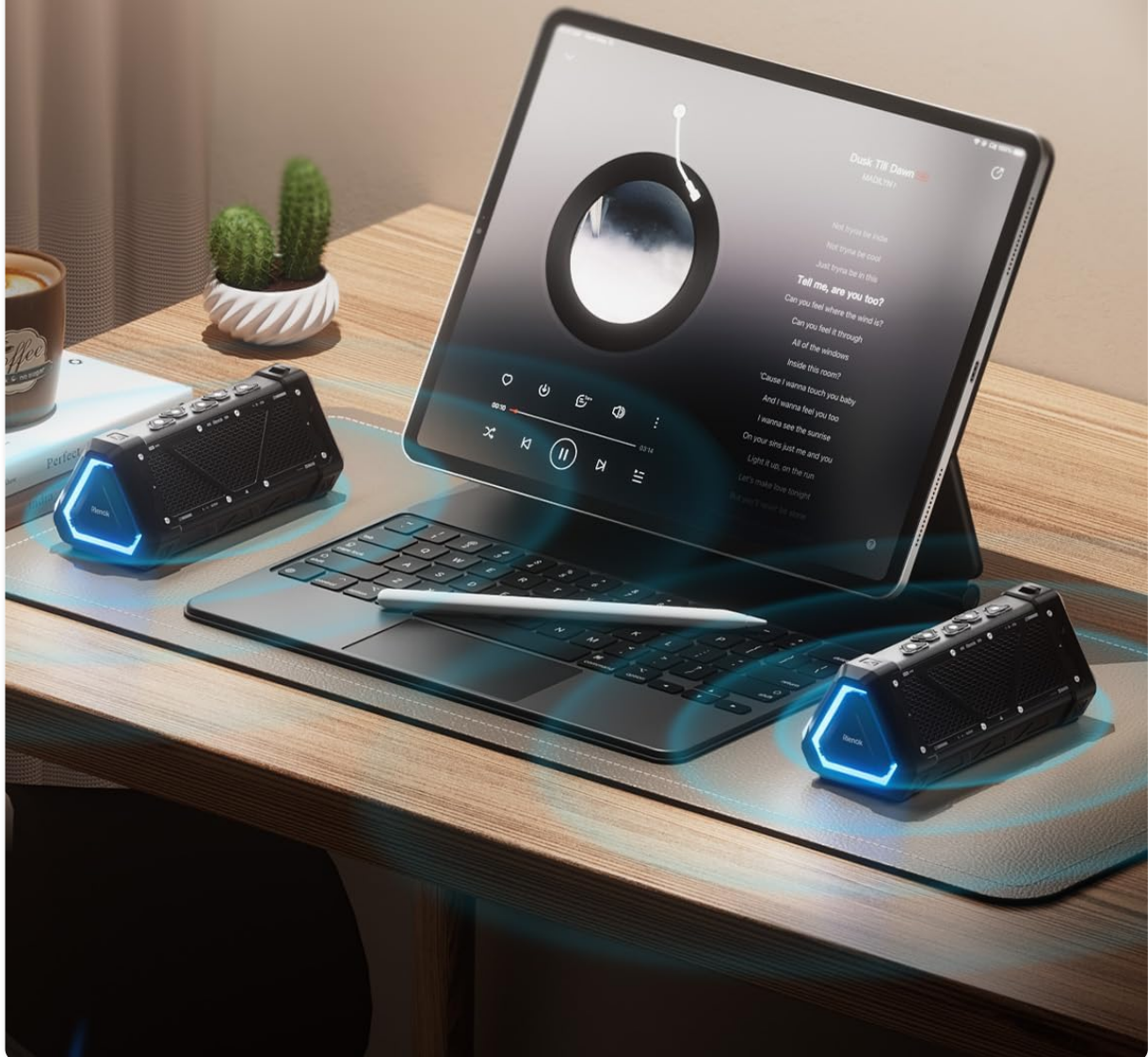
Figure 6: Two RIENOK S11 speakers set up for True Wireless Stereo sound with a tablet.

Emparejado con 2 altavoces RIENOK S11 para un sonido superestéreo de 60 W