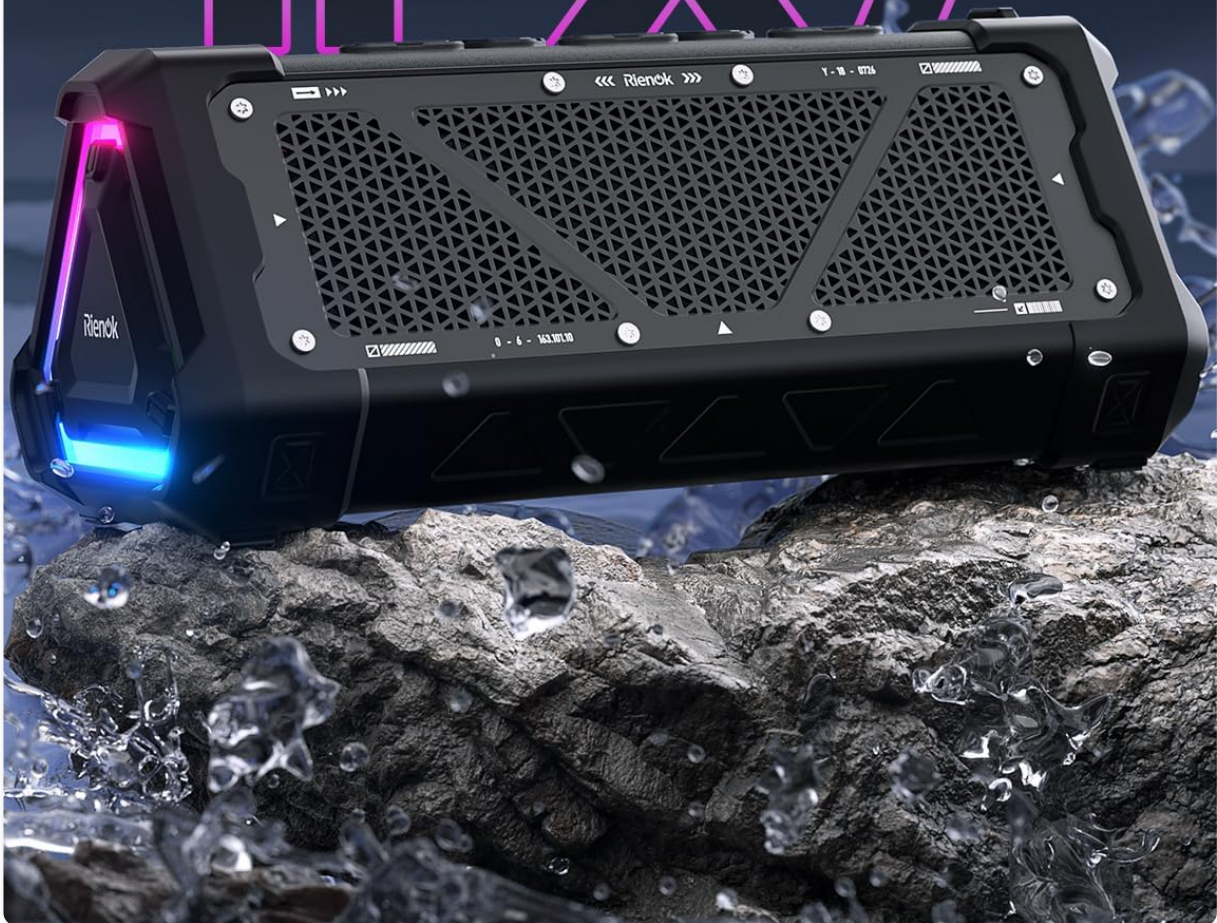
Figure 7: The RIENOK S11 speaker submerged in water, highlighting its IPX7 waterproof capability.