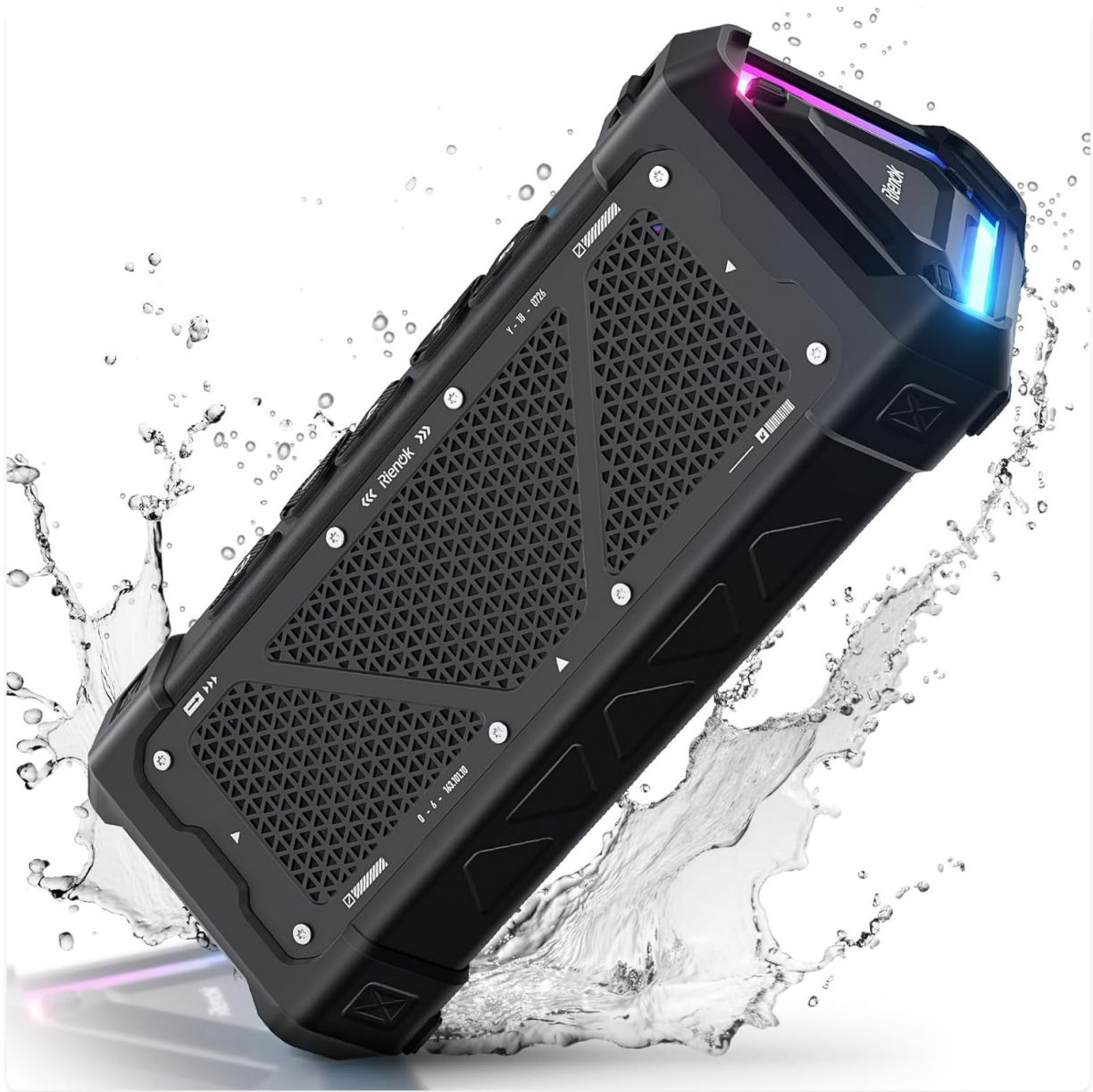
Figure 1: RIENOK S11 Bluetooth Speaker