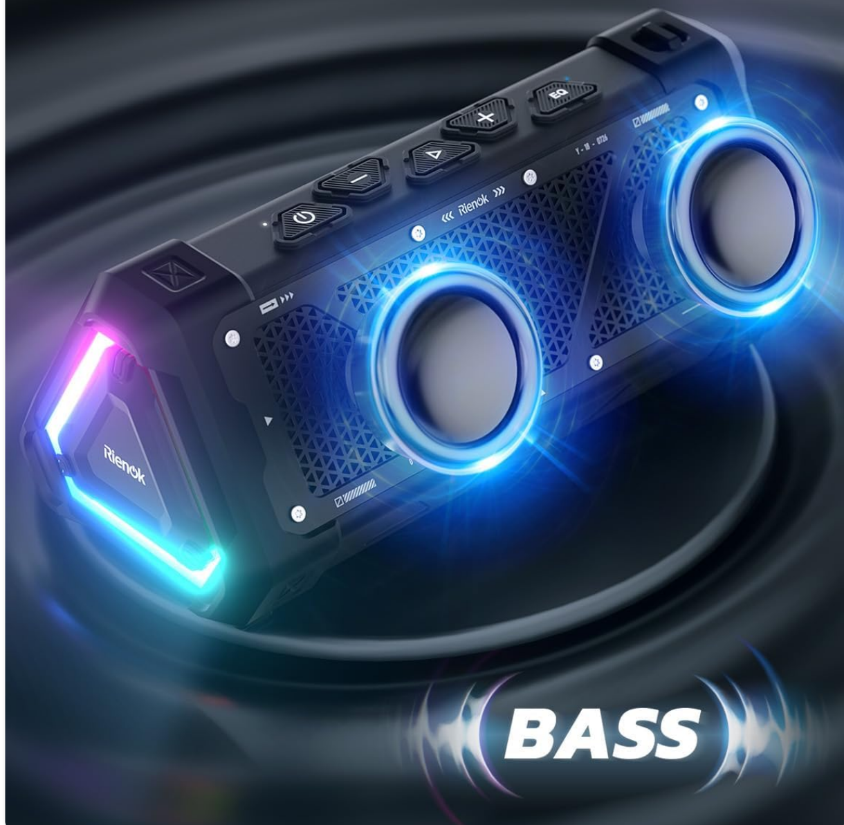
Figure 3: Illustrates the powerful 30W sound and rich stereo bass of the speaker.