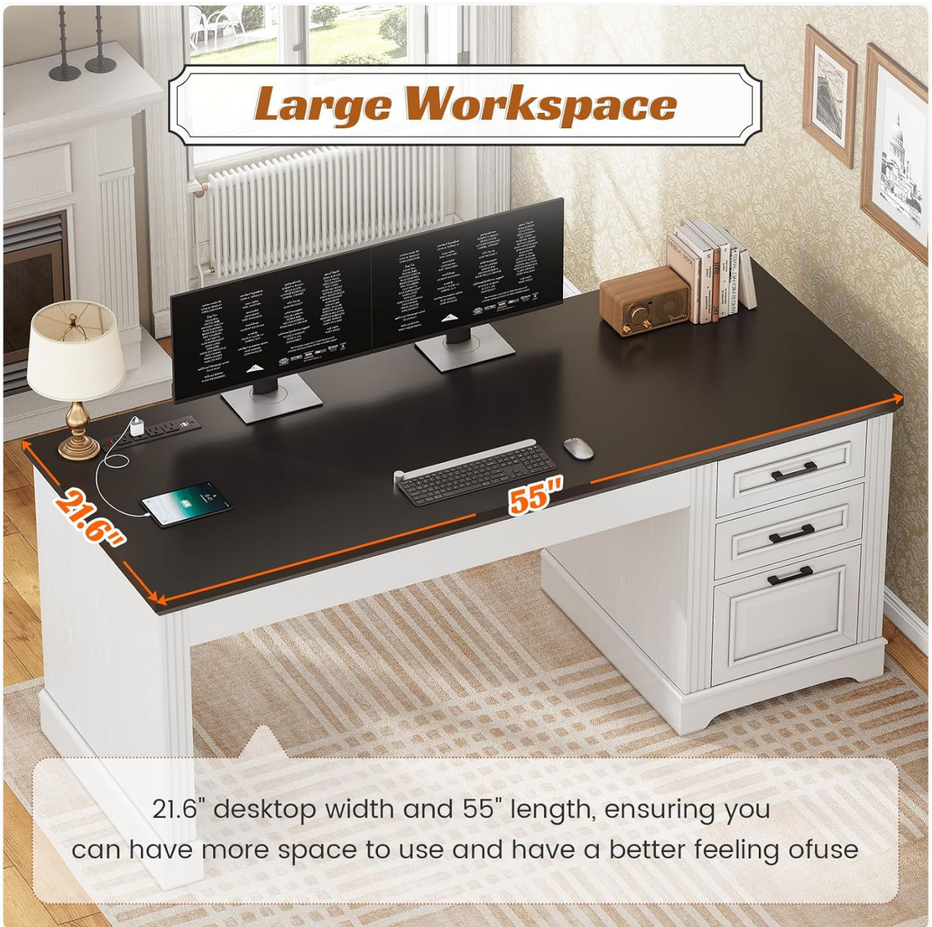
Figure 4: Integrated power outlets and USB ports for convenient device charging.