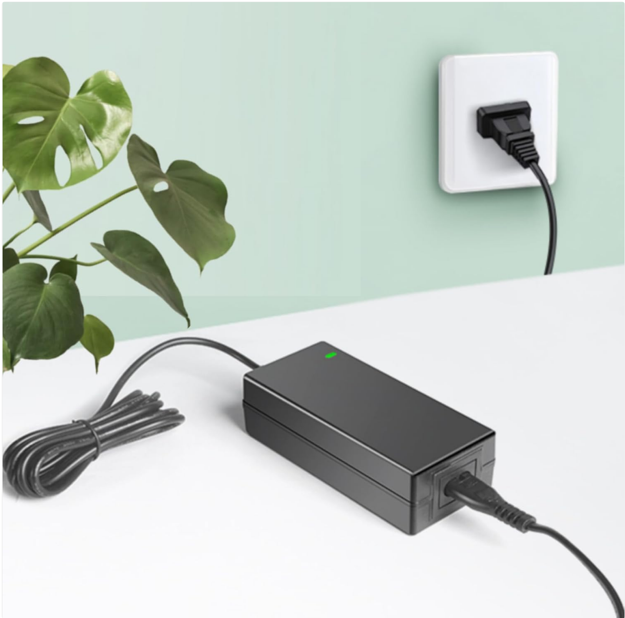
Figure 2: The AC adapter connected to a power outlet, ready for use with the terminal.