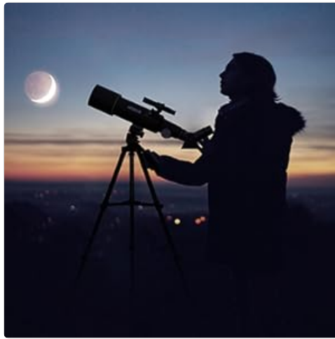
Figure 3: Finderscope attachment.