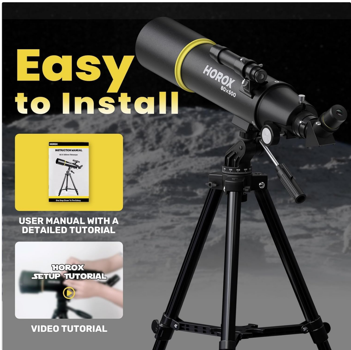
Figure 7: Stargazing with the HOROX telescope.