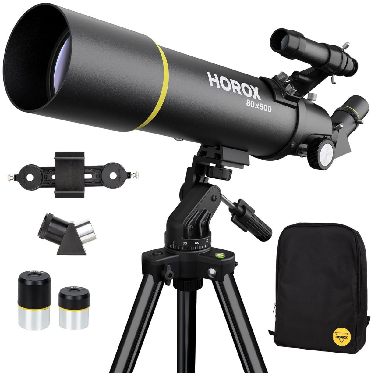
Figure 1: All components included in the HOROX Telescope package.