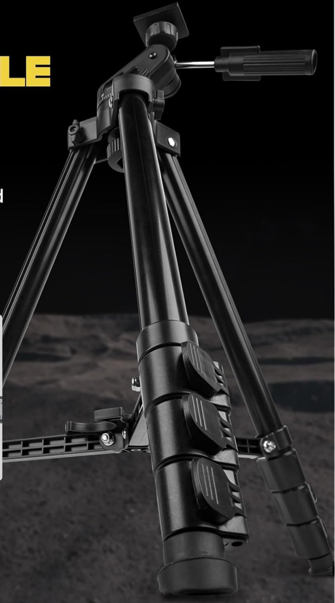
Figure 2: The stable, adjustable tripod.