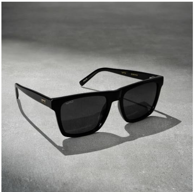
Image: Graphic detailing comfort features such as lightweight high-quality acetate frame, durable construction, and adjustable tips and temples for a custom fit.