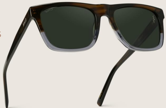
Image: Detailed graphic illustrating the design elements of the Denver Modern Square Sunglasses, including the brow slope and squared rims.

Denver's contemporary frame is defined by a subtle brow slope that transitions seamlessly into sharp, squared rims. The slightly winged temples, molded nose bridge, and sleek double rivet accents add just the right amount of edge, blending modern design with bold details for a standout look.