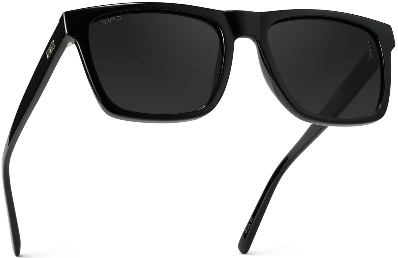
Image: Front view of the WMP Eyewear Modern Square Sunglasses, showcasing the sleek design and dark lenses.