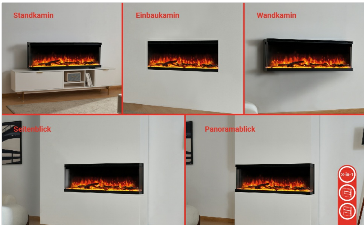
Image: KAMINIO LEA Electric Fireplace installation options.

Ensure the chosen location allows for proper ventilation and is away from combustible materials. The fireplace is designed for indoor use only. Refer to the included mounting hardware instructions for detailed steps specific to your chosen installation method.