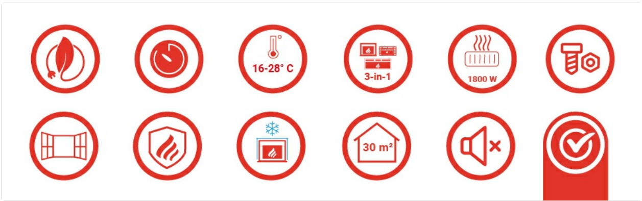
Image: Overview of KAMINIO LEA electric fireplace features.