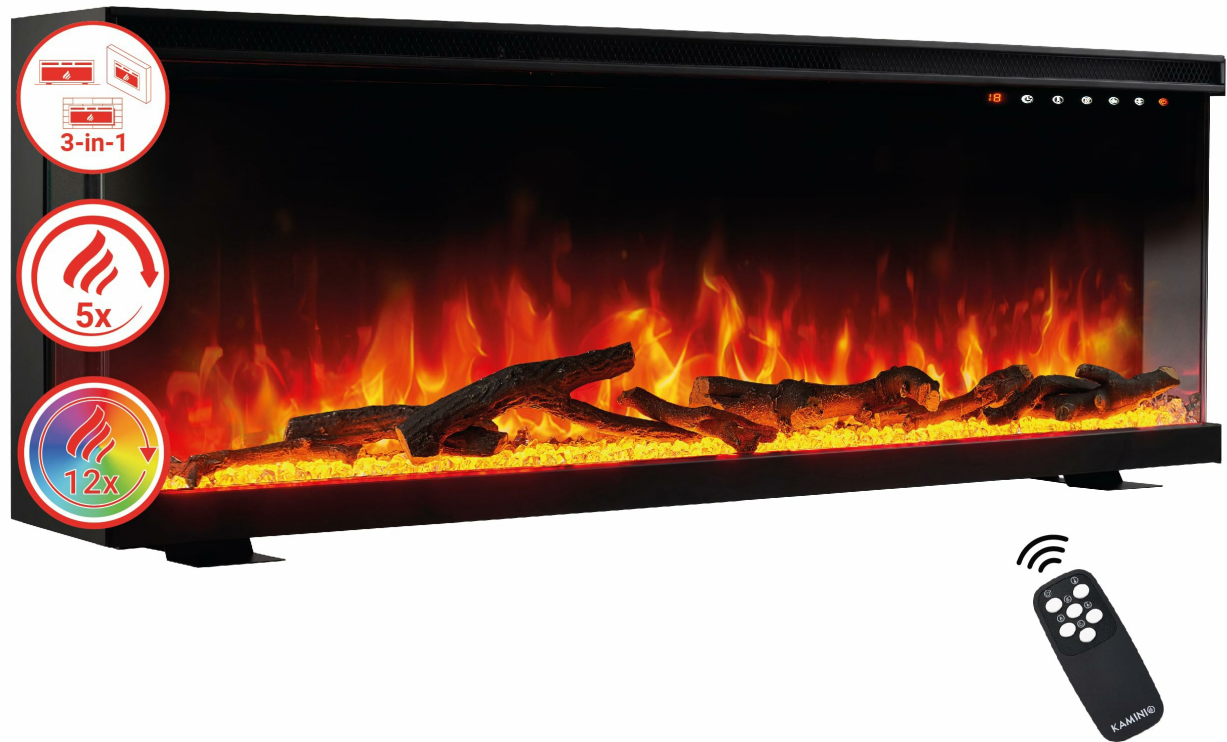
Image: KAMINIO LEA 50-inch Electric Fireplace in a modern living room setting.