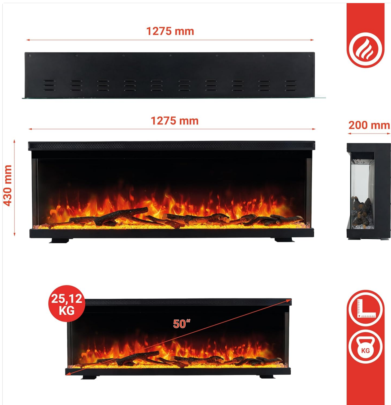
Image: KAMINIO LEA 50-inch Electric Fireplace dimensions.