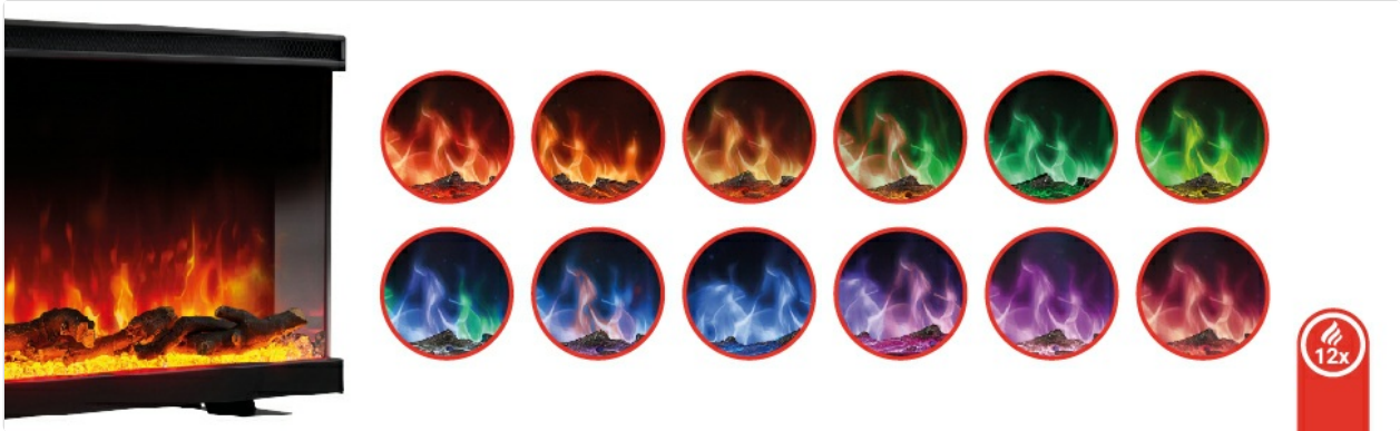
Image: Visual representation of the 12 flame colors available.

Video: Shows the heating function in operation, with warm air being emitted from the top vent.