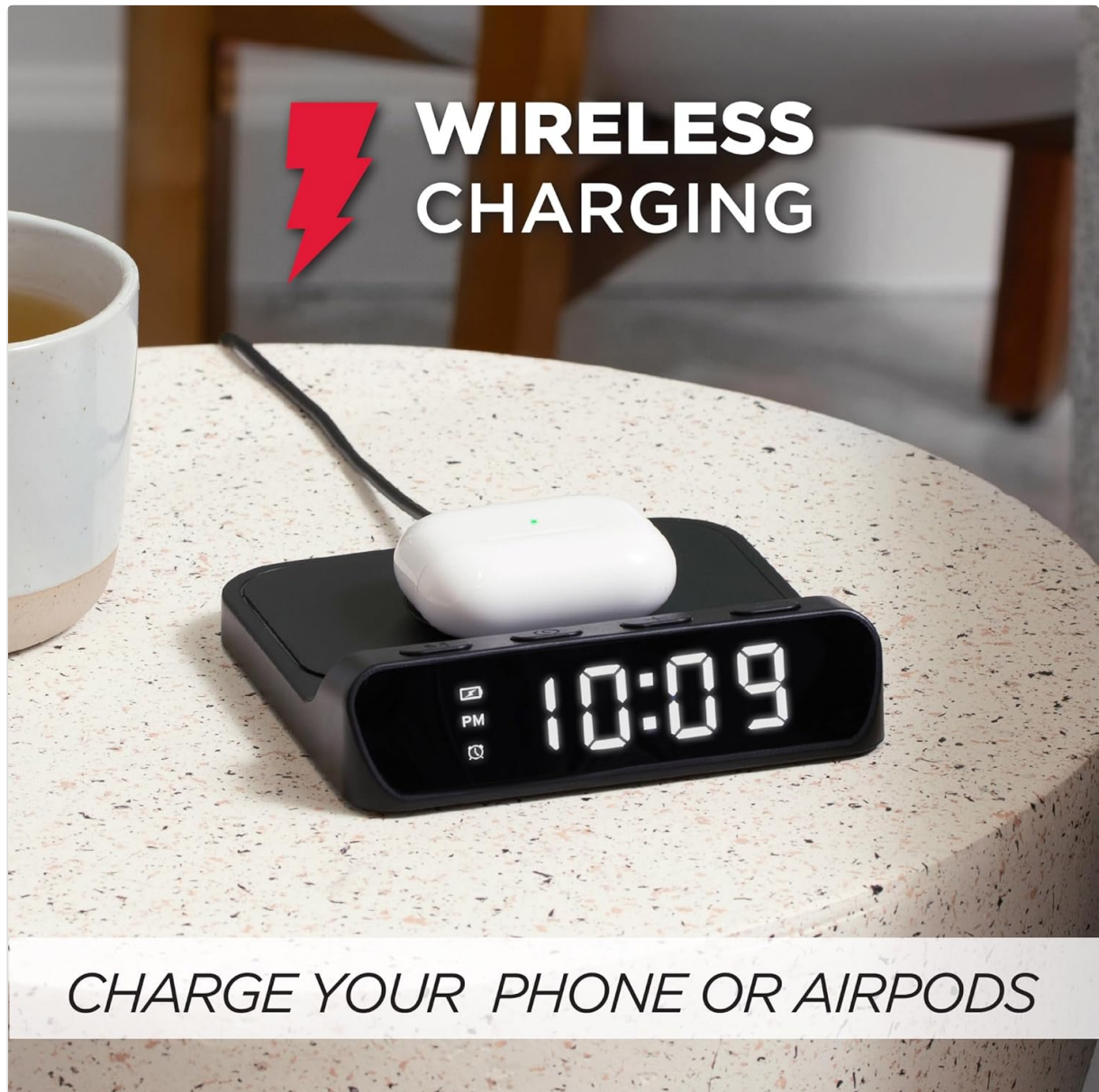
Image 5.2: AirPods case placed on the wireless charging pad of the Timex TW14 alarm clock, indicating active charging.