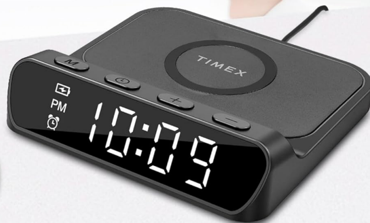
Image 3.1: Top view of the Timex TW14 alarm clock, highlighting the control buttons and the wireless charging pad. The display shows "10:09". A USB power cable is also shown.