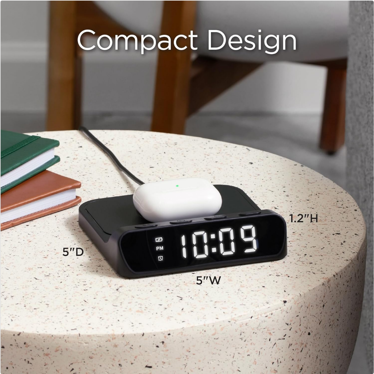
Image 8.1: Timex TW14 alarm clock with its dimensions (5"W x 5"D x 1.2"H) clearly indicated.