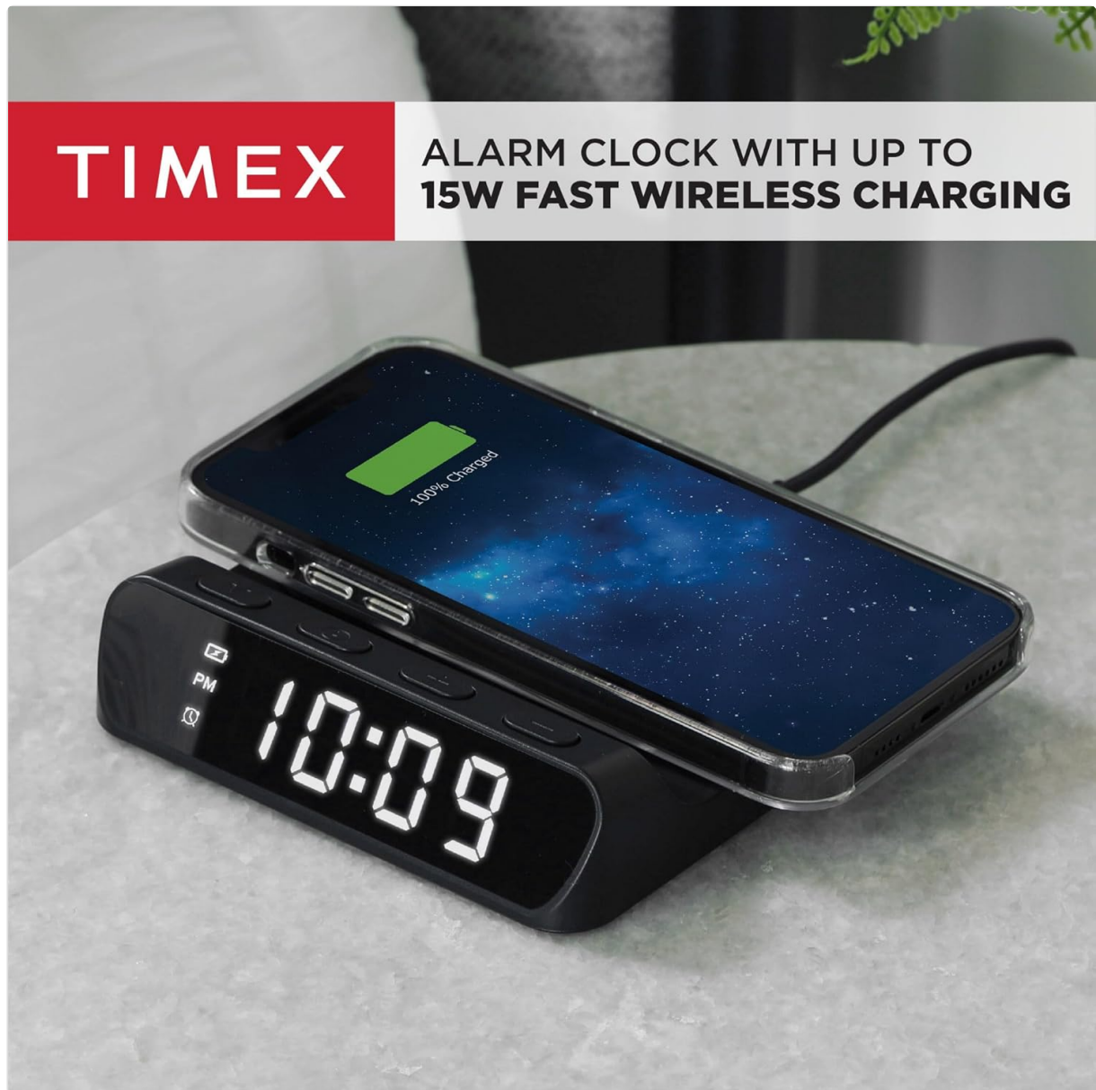
Image 5.1: An iPhone placed on the wireless charging pad of the Timex TW14 alarm clock, indicating active charging.

The Timex TW14 features a 15W wireless charging pad compatible with Qi-enabled devices such as iPhone, Android smartphones, and AirPods.