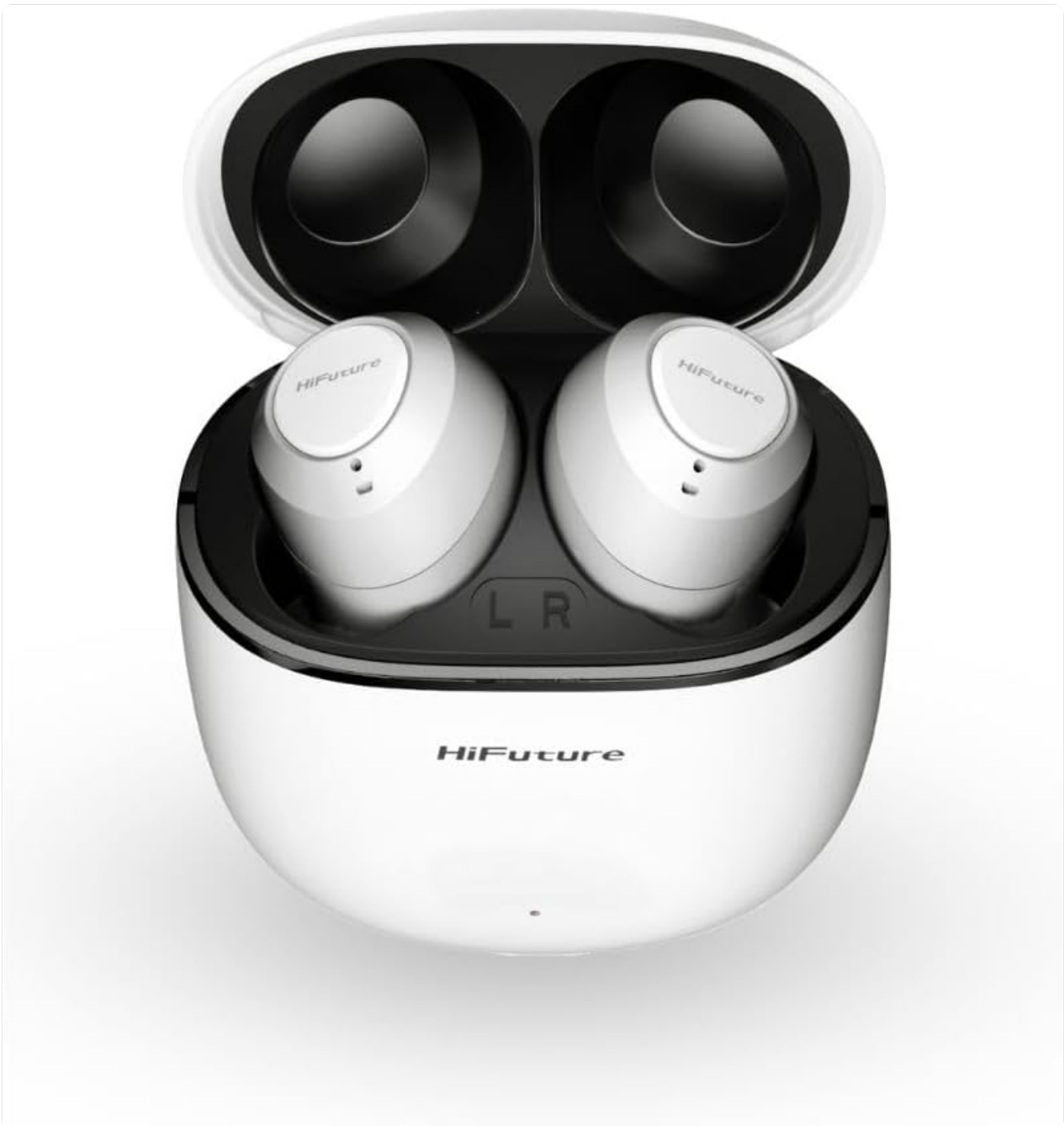
Image: HiFuture OlymBuds3 earbuds resting inside their open charging case, showcasing their compact design.