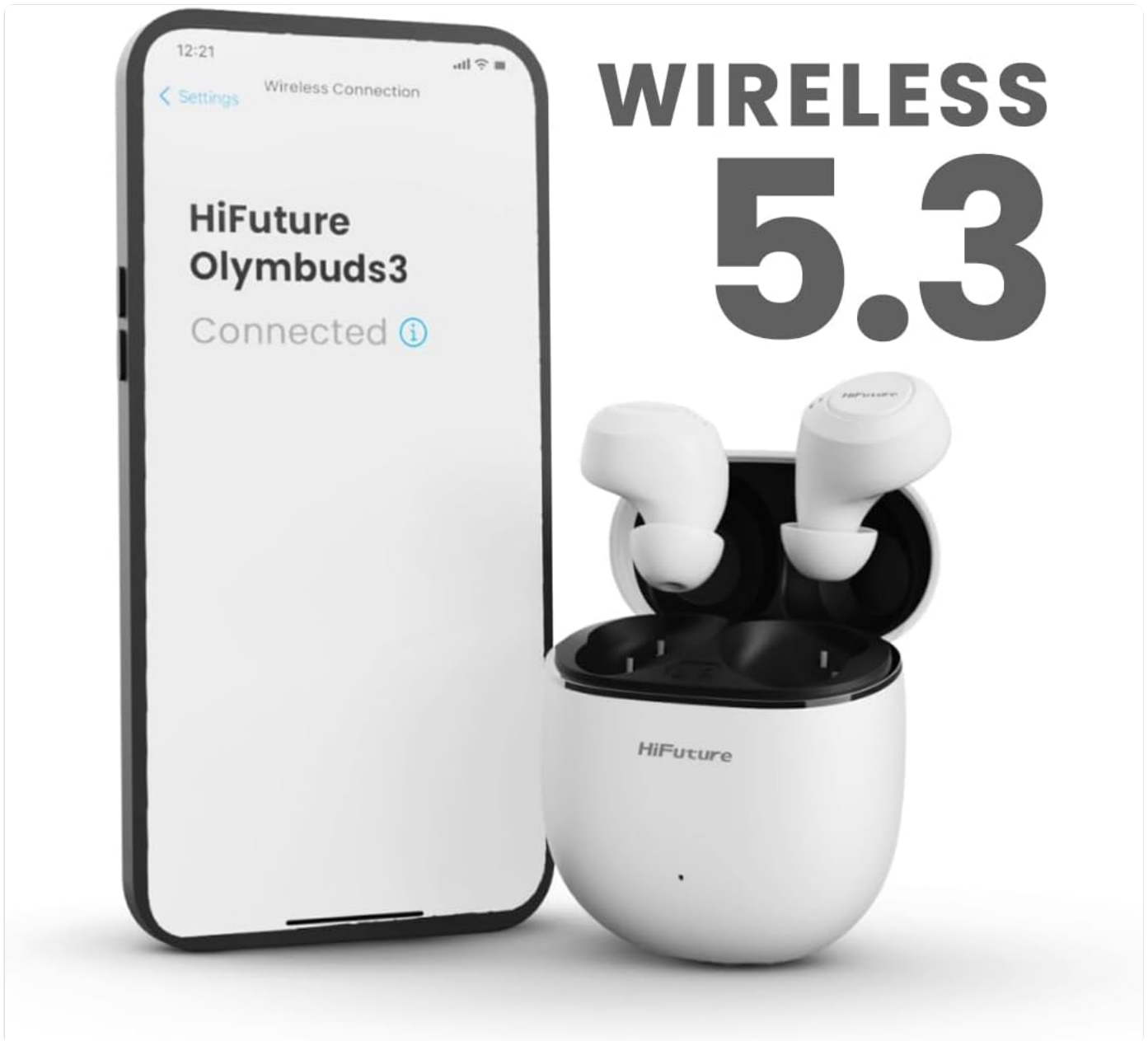
Image: A smartphone displaying a successful Wireless 5.3 connection to "HiFuture Olymbuds3", with the earbuds and case nearby.