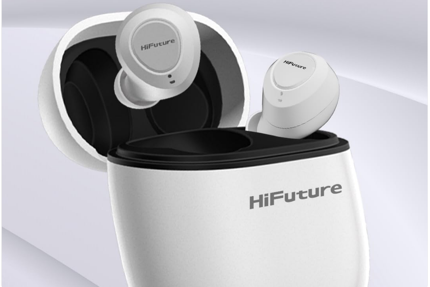
Image: A visual representation of the key features of the OlymBuds3, including the earbuds and charging case.