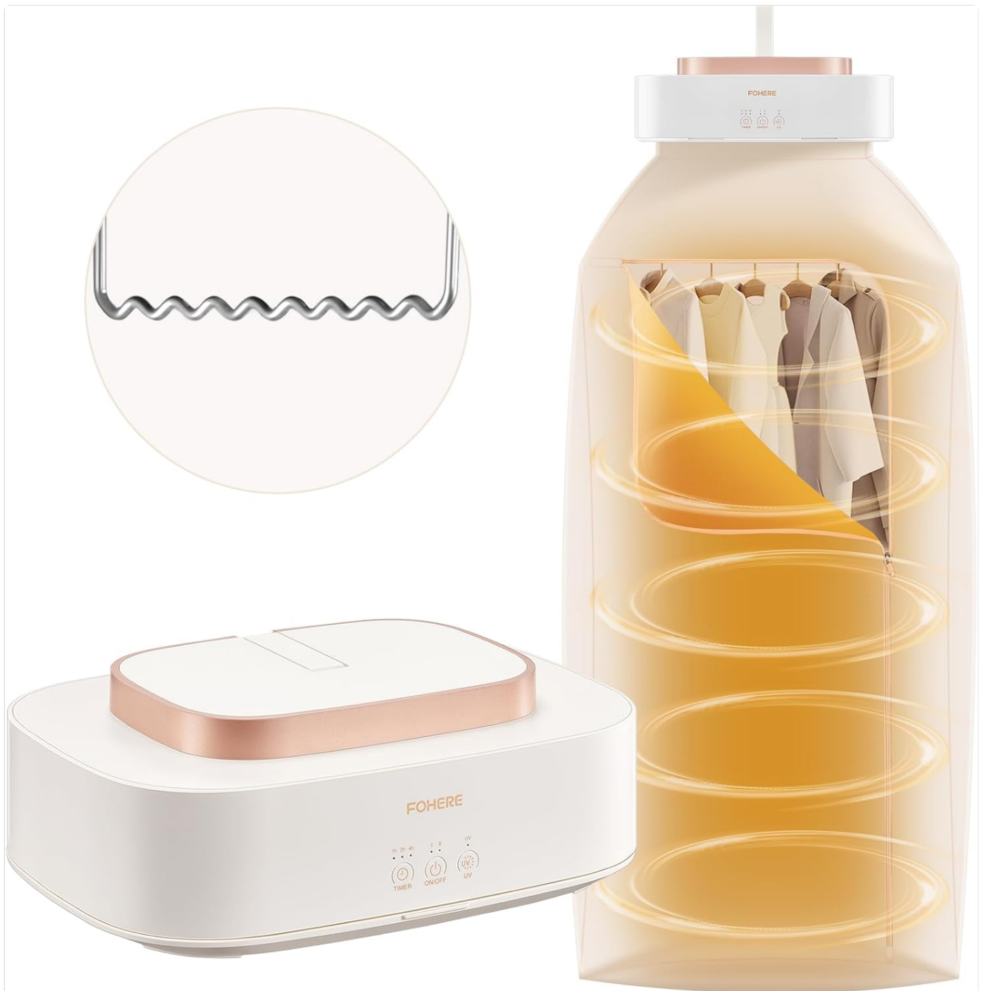
Image: Main components of the FOHERE Portable Clothes Dryer, showing the compact drying unit and the cylindrical dry bag for clothes.