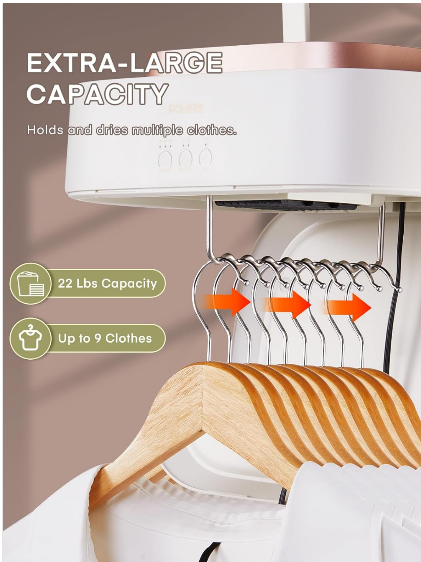
Image: Multiple garments are shown hanging inside the portable dryer's fabric bag, demonstrating its capacity to dry several items simultaneously.