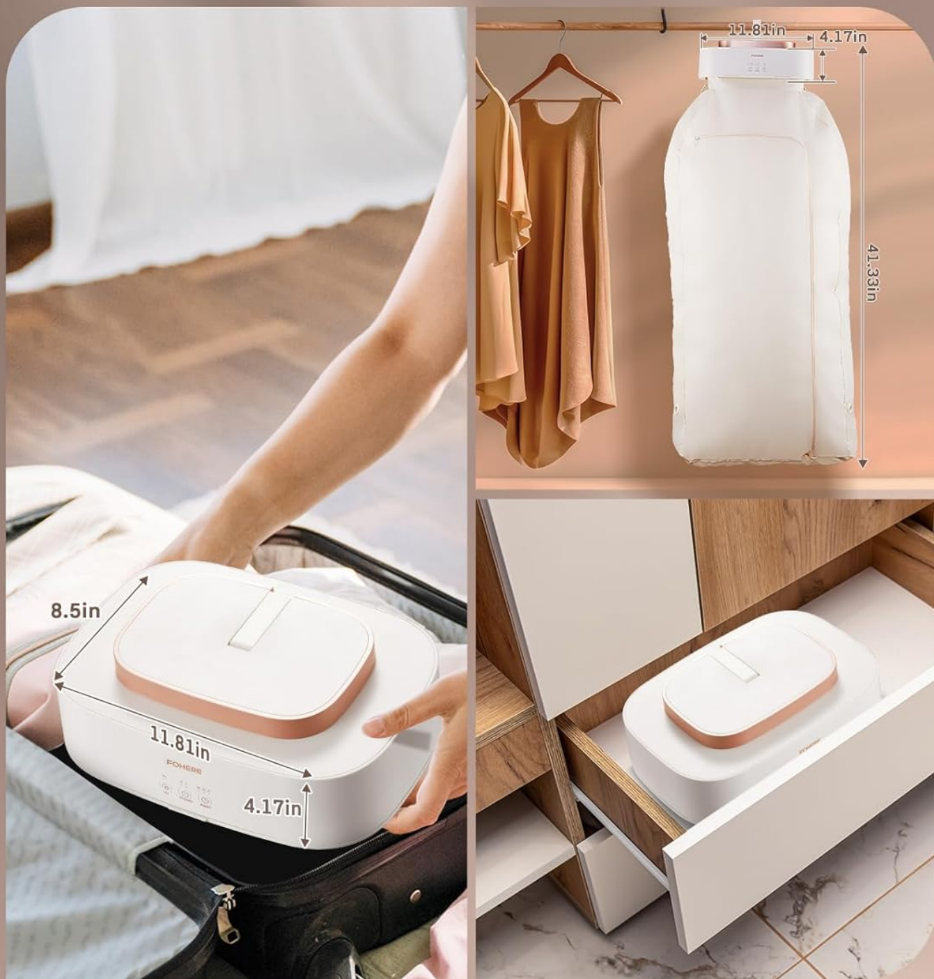
Image: The portable dryer unit is shown being placed into a suitcase and stored in a drawer, emphasizing its compact design and ease of storage for travel or small living spaces.

DOES NOT OCCUPY SPACE AND IS EASY TO STORE