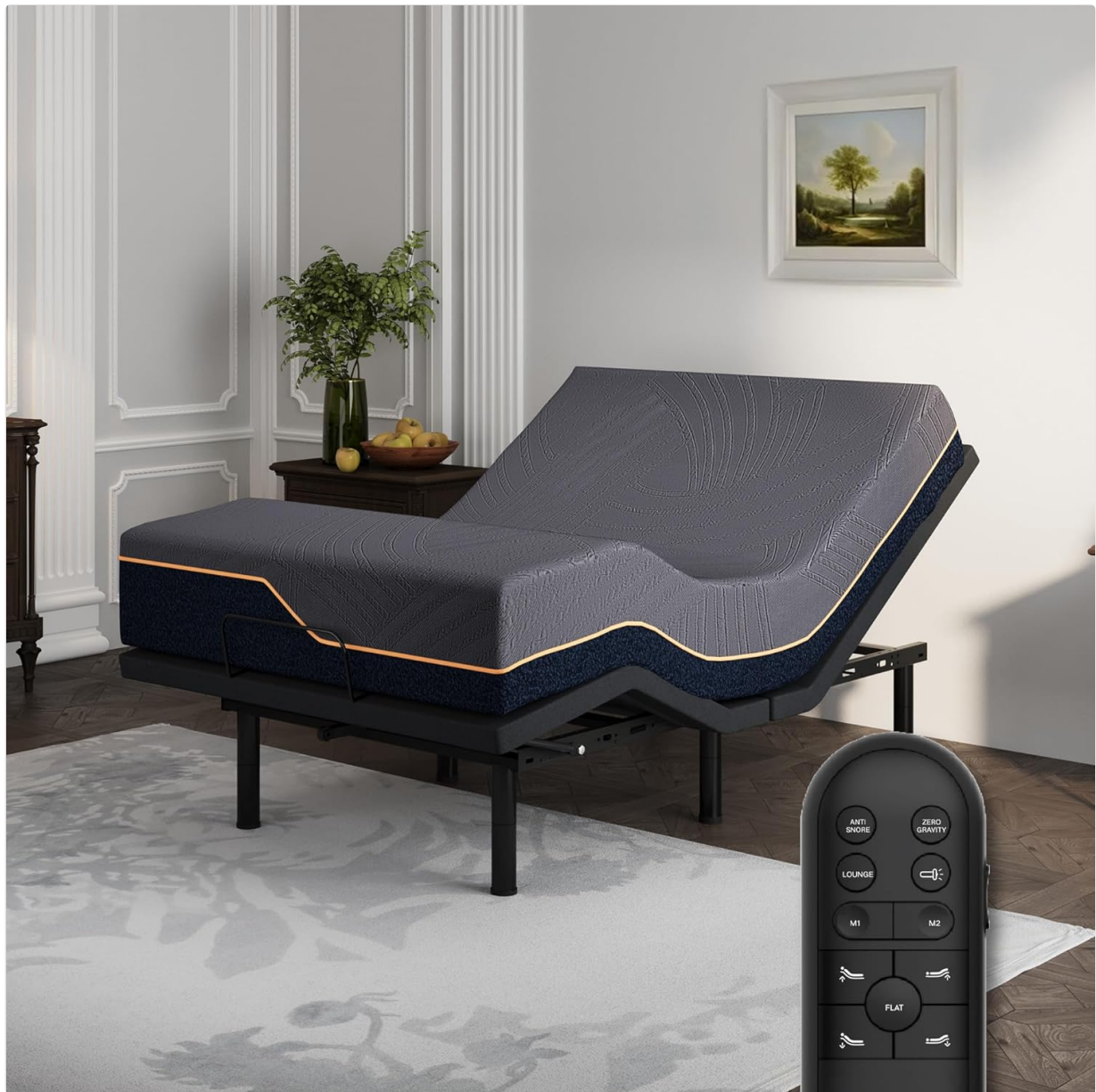
Figure 2: Adjustable bed frame with wireless remote control.