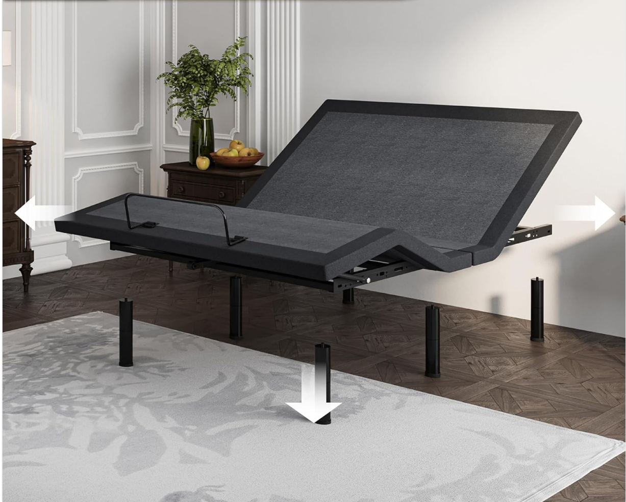
Figure 1: Quick and tool-free assembly of the adjustable bed frame.