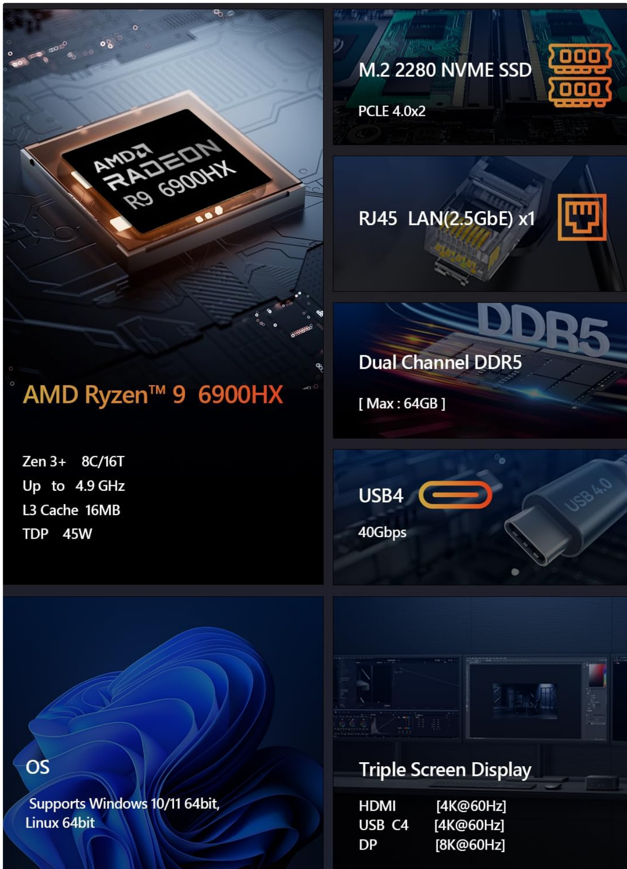
Figure 5.1: Triple Screen Display Setup