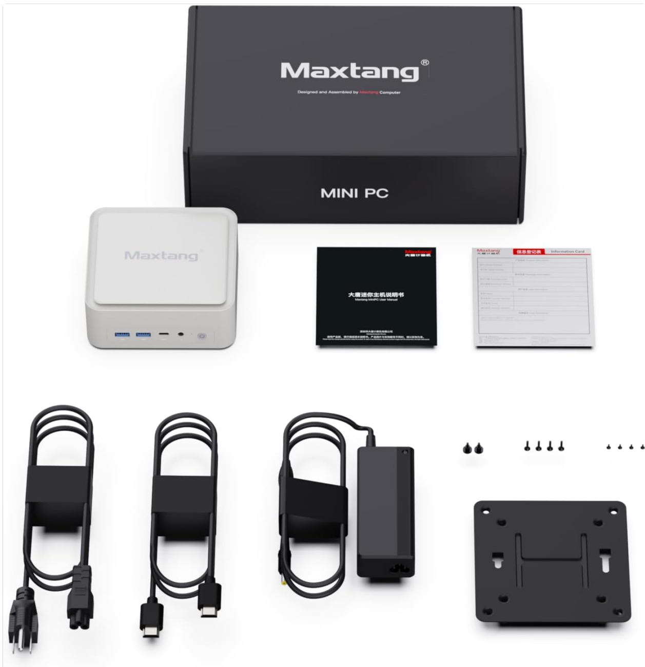
Figure 2.1: Maxtang MTN-6900HX Mini PC and Included Accessories