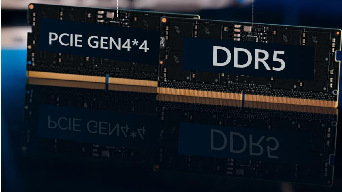
Figure 3.2: Internal Memory and Storage Expansion

Dual channel SO-DIMM DDR5 「 up to 64GB 」