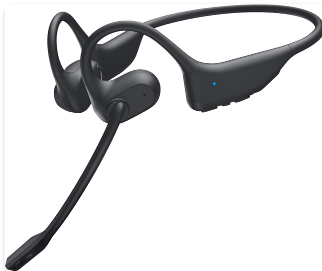
Figure 1: Gixxted O3 Open Ear Headphones, showcasing the flexible neckband and open-ear design.

The Gixxted O3 headset is engineered for an open-ear listening experience, allowing you to stay aware of your surroundings while enjoying audio. Its lightweight and flexible design ensures comfort for extended wear.