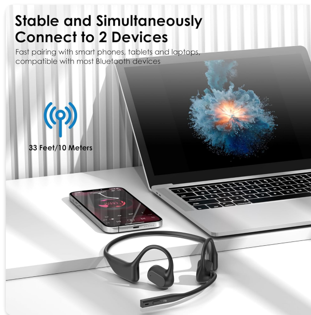
Figure 5: The headset's ability to stably connect to two devices simultaneously, compatible with most Bluetooth devices within a 33-foot (10-meter) range.