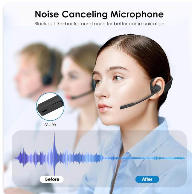
Figure 7: The AI noise-cancelling microphone effectively blocks out background noise for clearer communication.