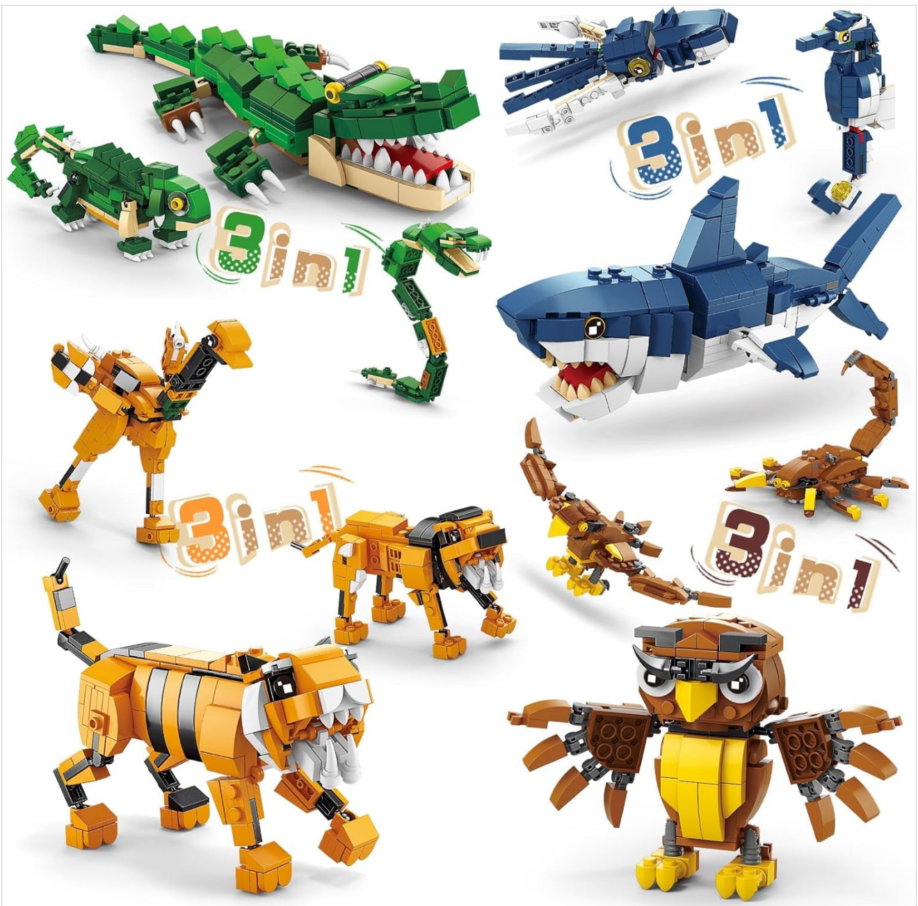
Image: Overview of the BDXEJV Creator 3-in-1 Animals Building Set, displaying the various animal figures that can be constructed.