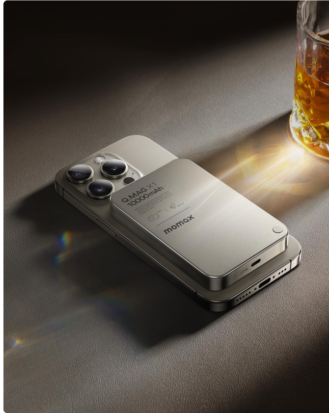
The power bank features LED indicators for battery status and a USB-C port for charging.