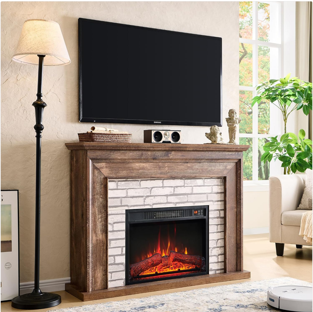
This image displays the fully assembled Aitjunz 45-inch Flip Top Electric Fireplace with Mantel, serving as a stylish TV stand in a modern living room. The fireplace features a light brown finish with a white brick-patterned insert, and the electric flames are visible.