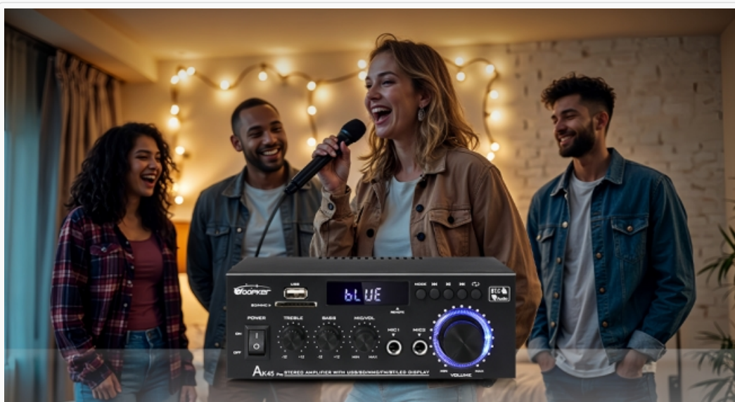
Image: The amplifier and its remote control.

The included remote control allows you to manage power, mode selection, volume, track skipping, and other functions from a distance. Ensure the remote has working batteries and is pointed towards the amplifier's front panel.