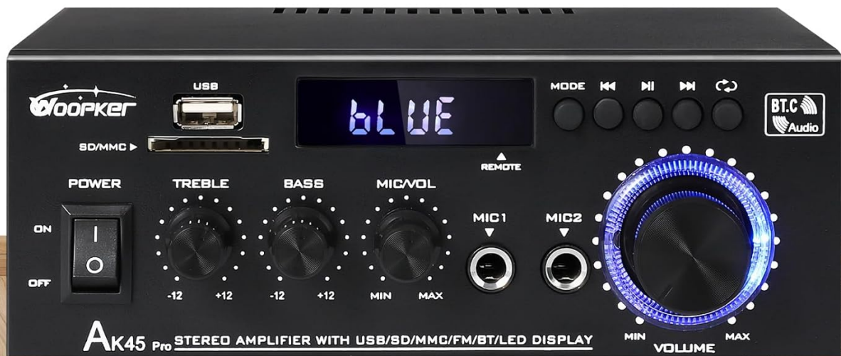
Image: The amplifier's front panel highlighting various input modes.

Press the Mode Button on the front panel or the remote control to cycle through available input sources: Bluetooth, USB, SD, FM, and RCA.