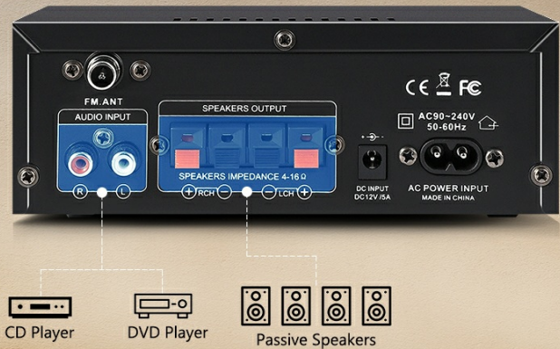
Image: Diagram showing the AK45Pro Audio Amplifier, AC Power Cord, Remote Controller, and User Manual.