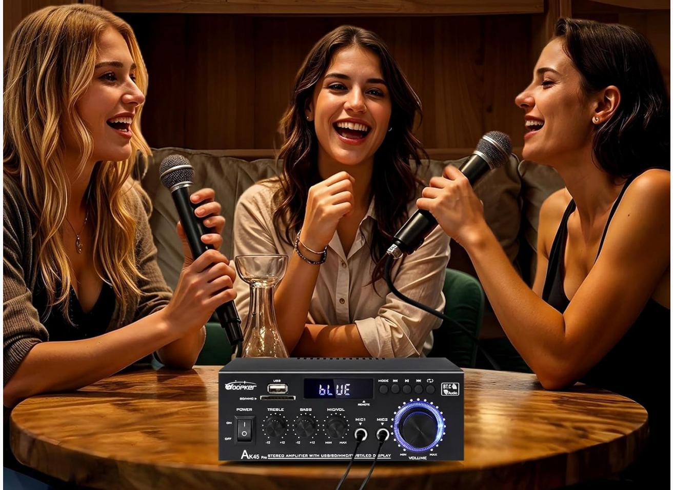
Image: The amplifier with two microphones connected, indicating its karaoke capability.

Connect up to two microphones to the MIC1 and MIC2 input jacks on the front panel. Adjust the microphone volume using the Mic Volume Knob .