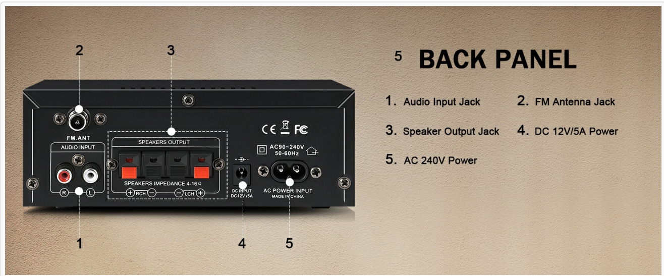
Image: Speaker connection diagram showing positive and negative terminals.