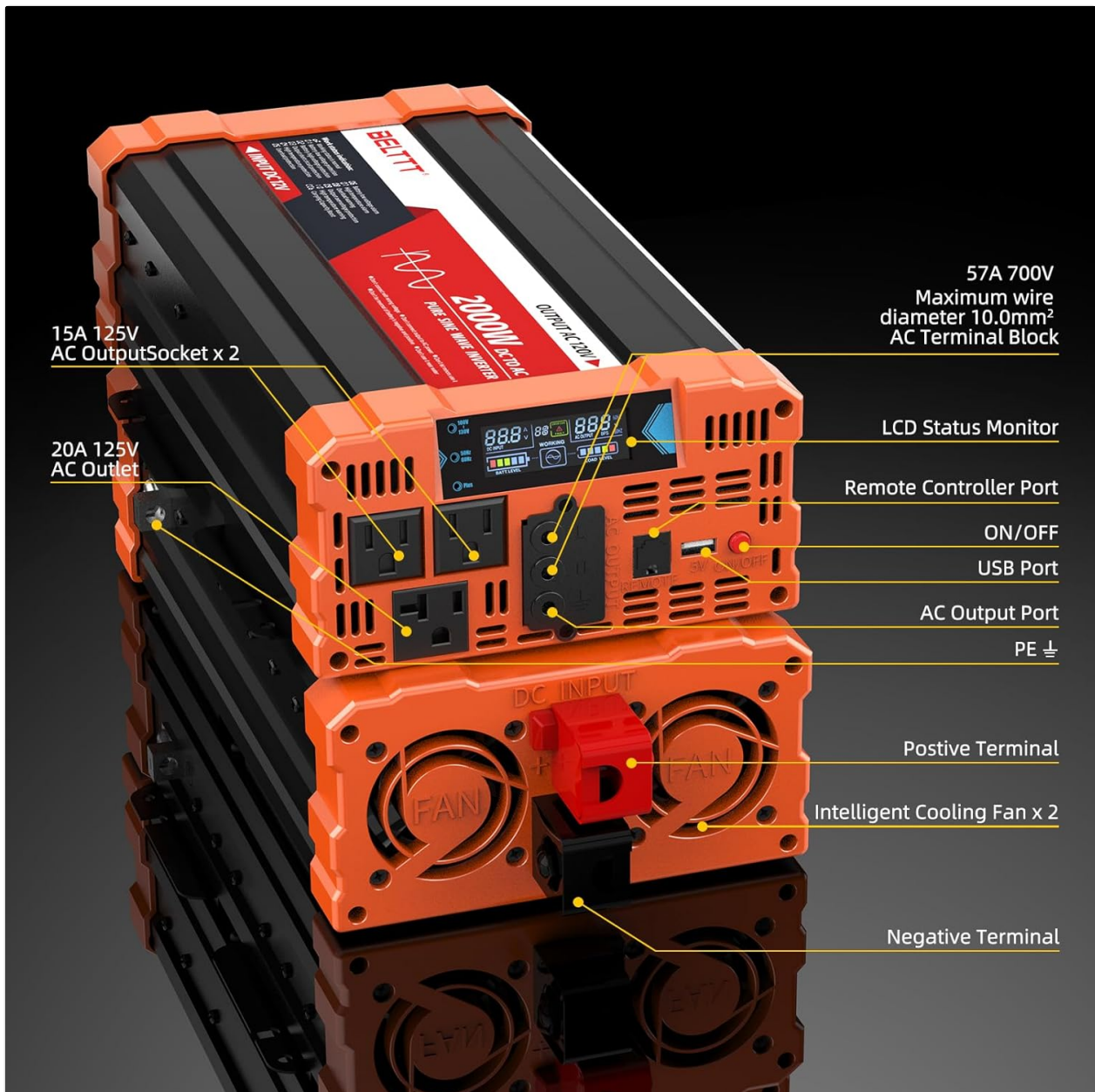
Figure 2.2: Detailed view of the inverter's front and rear panels, illustrating the AC output sockets, 20A outlet, USB port, remote controller port, LCD status monitor, DC input terminals, and intelligent cooling fans.