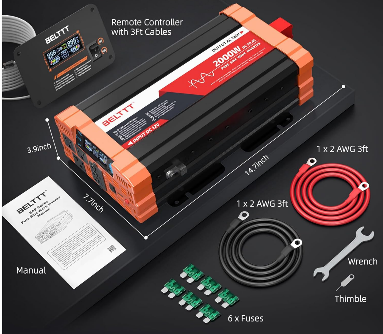
Figure 3.1: All components included in the product package, such as the inverter, remote controller, battery cables, manual, wrench, thimble, and fuses.