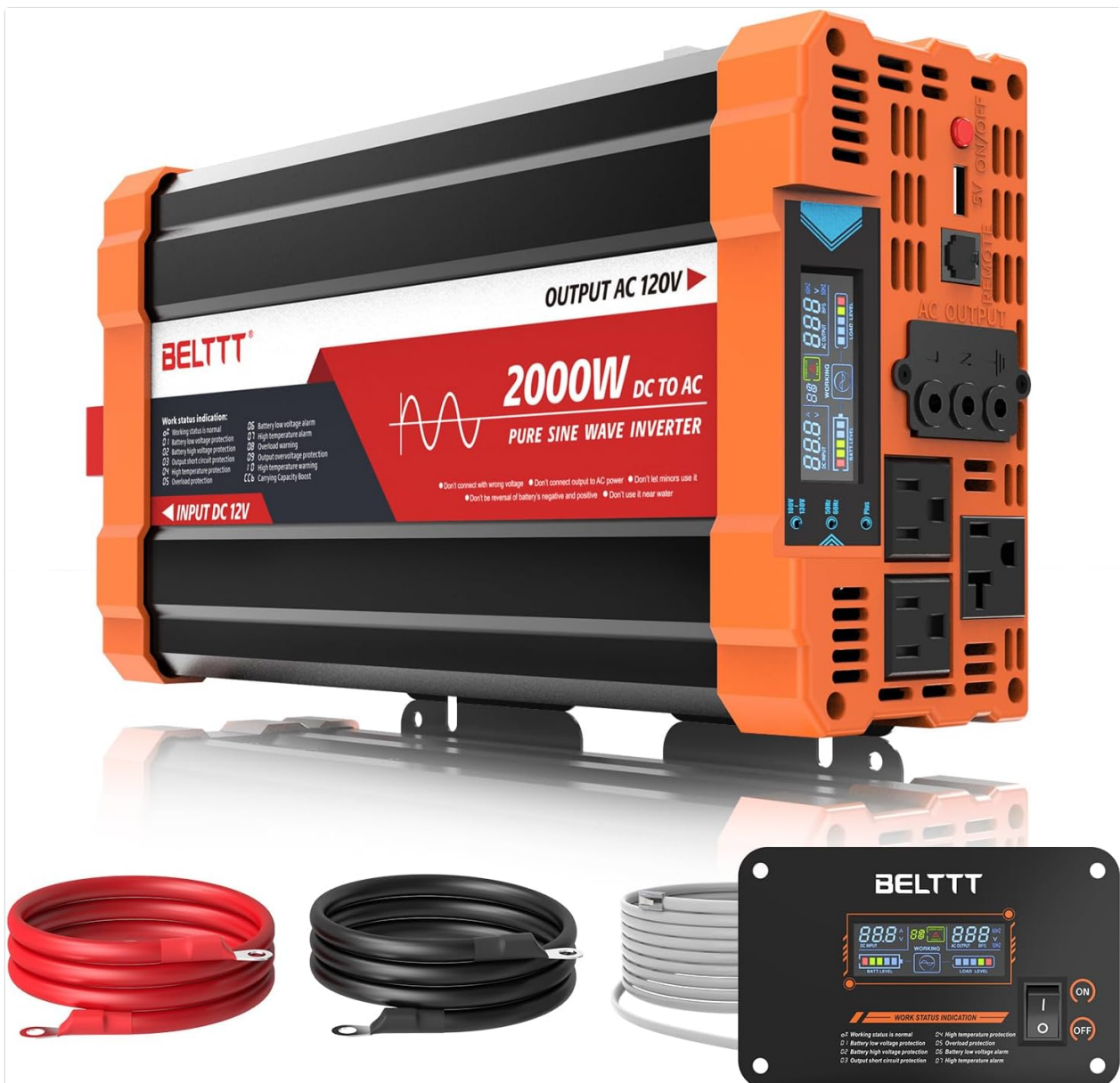
Figure 2.1: The BELTTT 2000W Pure Sine Wave Inverter shown with its battery cables and remote control unit.