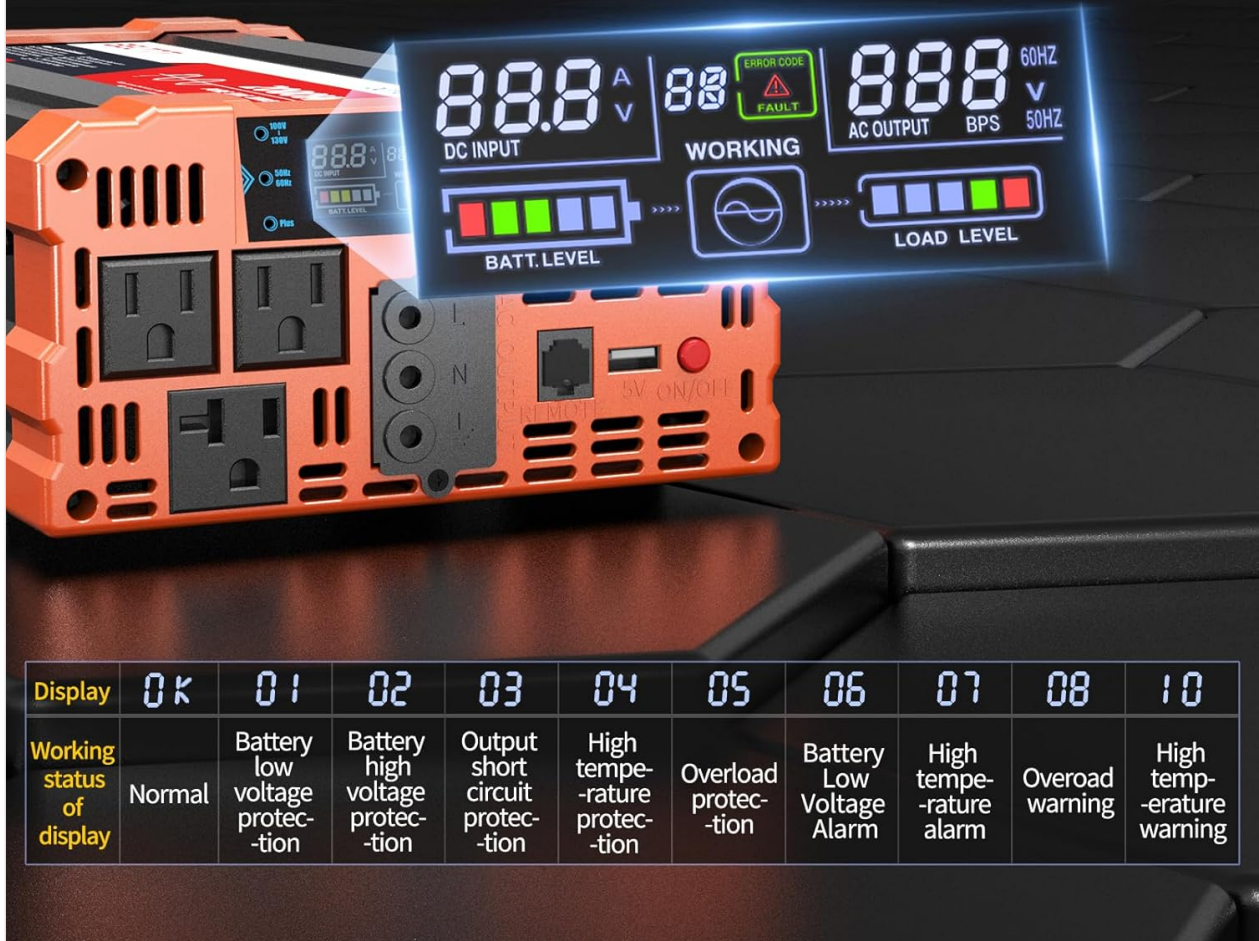
Figure 5.1: The intelligent LCD display showing input DC voltage, AC output voltage, battery level, load level, and a table of error codes for quick diagnosis.

Output voltage and frequency can be adjusted in a small range using tools