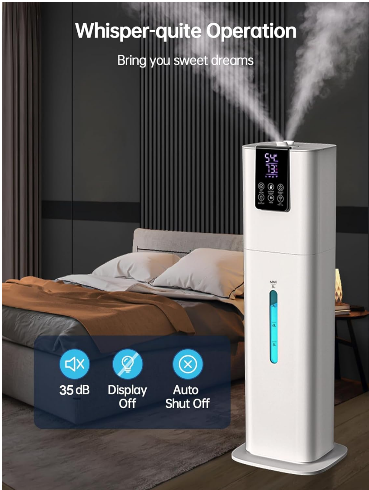
Image: The humidifier operating quietly in a bedroom at night, illustrating its sleep mode features.