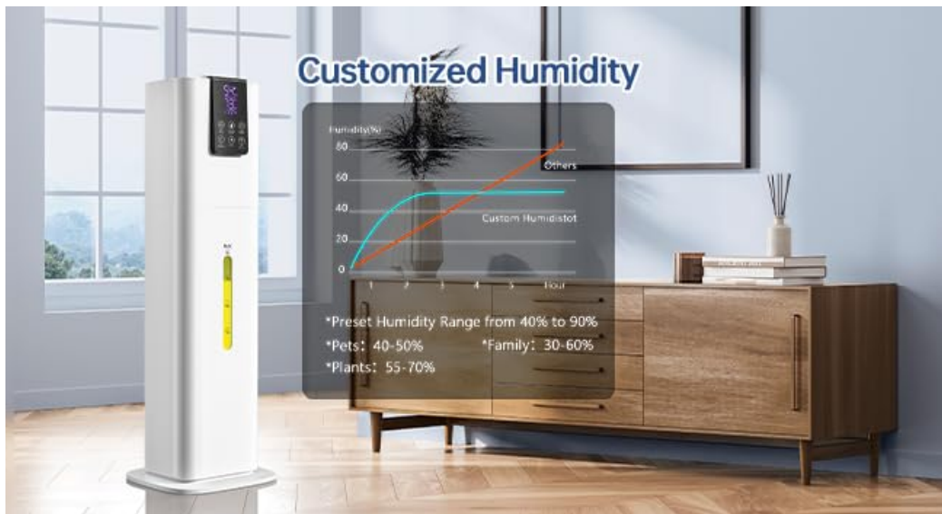
Image: Display showing customized humidity settings and recommended ranges for different environments.