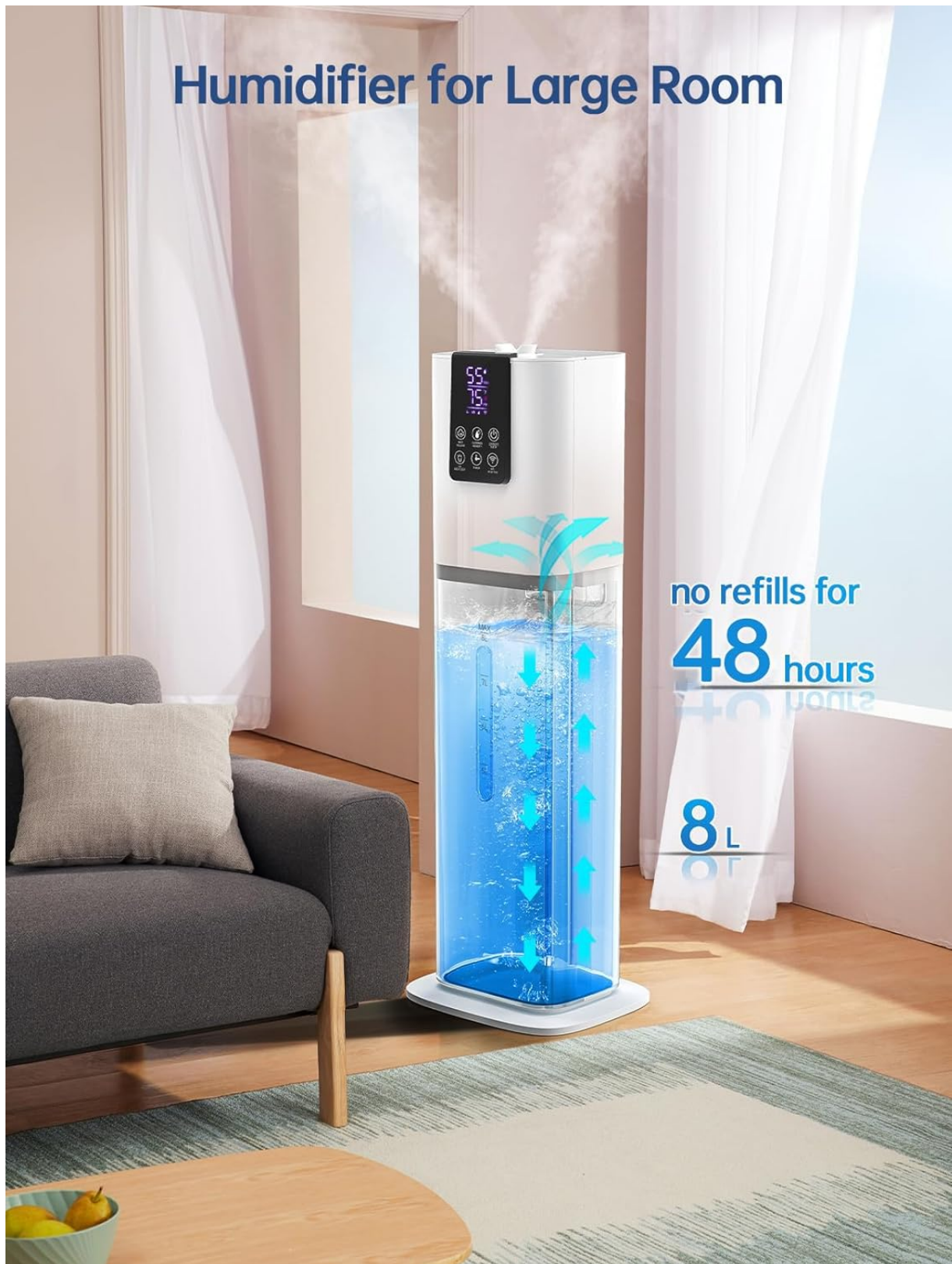
Image: The Hiswelle H786 humidifier positioned on the floor in a living room, demonstrating its floor-standing design.