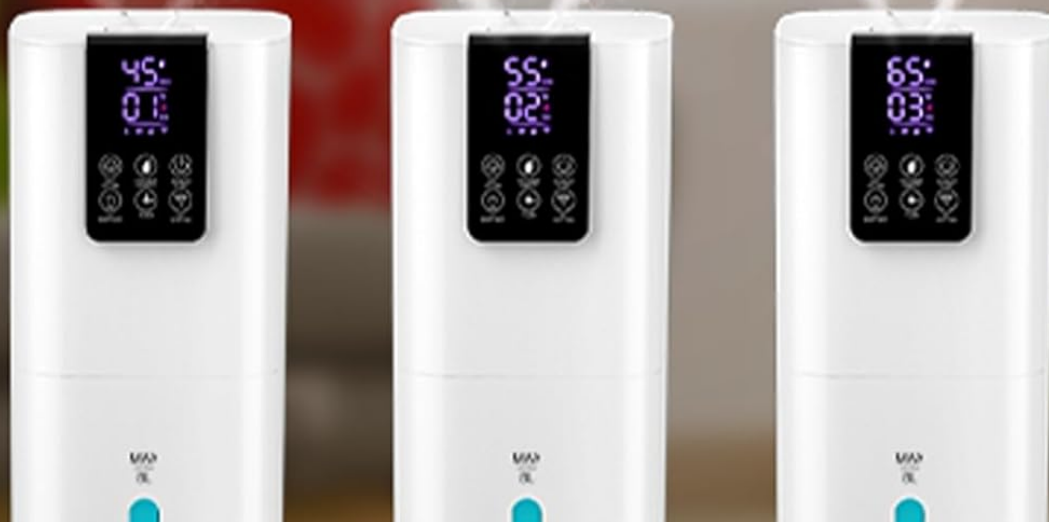
Image: Visual representation of the 3 mist volume levels and the 360° rotating nozzle.