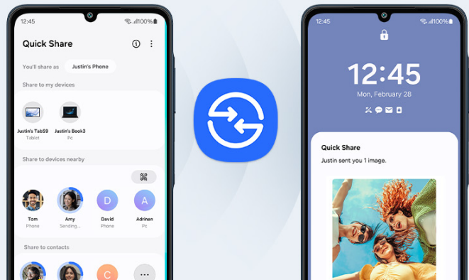
Image: Quick Share functionality.

Sharing files is a breeze with Quick Share 10 . It's fast, easy, and secure.