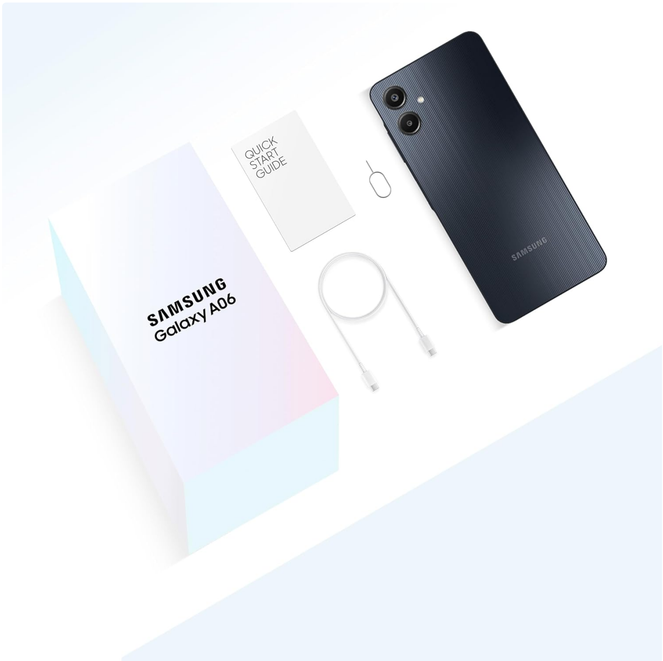
Image: Samsung Galaxy A06 box contents.