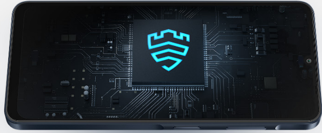
Image: Samsung Knox Vault for secure data.

Samsung Knox Vault 4 EAL5+ certified 5 , is like a safe within a safe, physically isolating PINS, passwords and other private info. This protects you from hackers and hardware attacks.