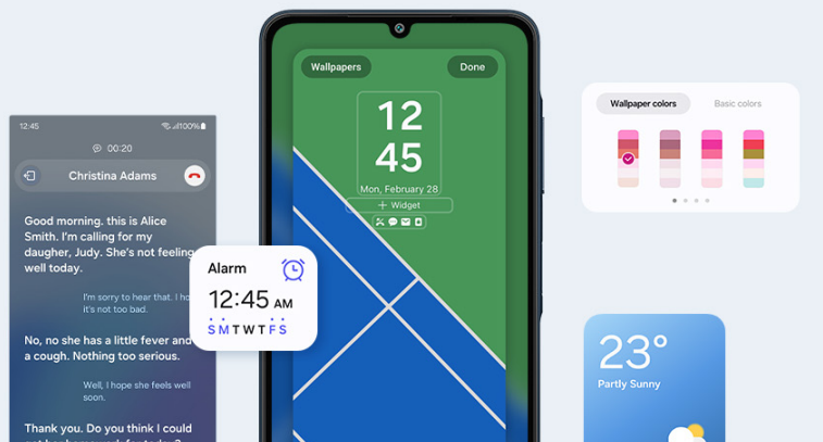
Image: One UI 6.1 interface.

One UI 6.1 11 lets you run things effortlessly just the way you like it. It's all about personalizing your everyday experiences.