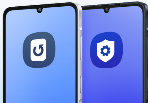
Image: OS and Security Updates.

Your device is your partner. Ensured with 2 generations of OS upgrades 9 and 4 years of security updates 9 . Your device experience with Galaxy A06 just gets better overtime.