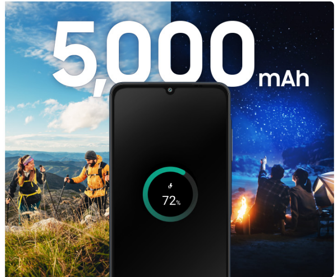
Image: Powerful 5000mAh battery for extended use.

Enjoy more of what you love without worrying about battery life—Galaxy A06 goes longer on a single charge with the 5000mAh (typical) 6 battery. And with 25W 7 Fast Charging, it's back in action quickly.