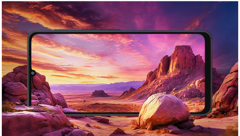
Image: Overview of Samsung Galaxy A06 features.

Maximize your view with the 17.13cm 1 HD+ display. Smooth 60Hz scrolling and the LCD U-Cut display. That gives you more room to enjoy your content. Experience the upgrade.