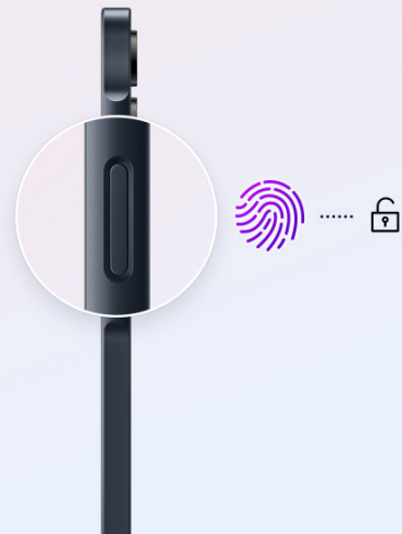
Image: Secure access with side fingerprint scanner.

Unlocking is a breeze with the side fingerprint sensor. It offers a reliable single-press verification and allows you to set double-press shortcuts for your camera or other frequently used apps.