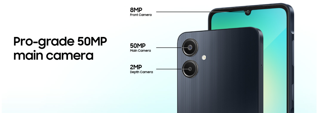
Image: Pro-grade 50MP main camera details.